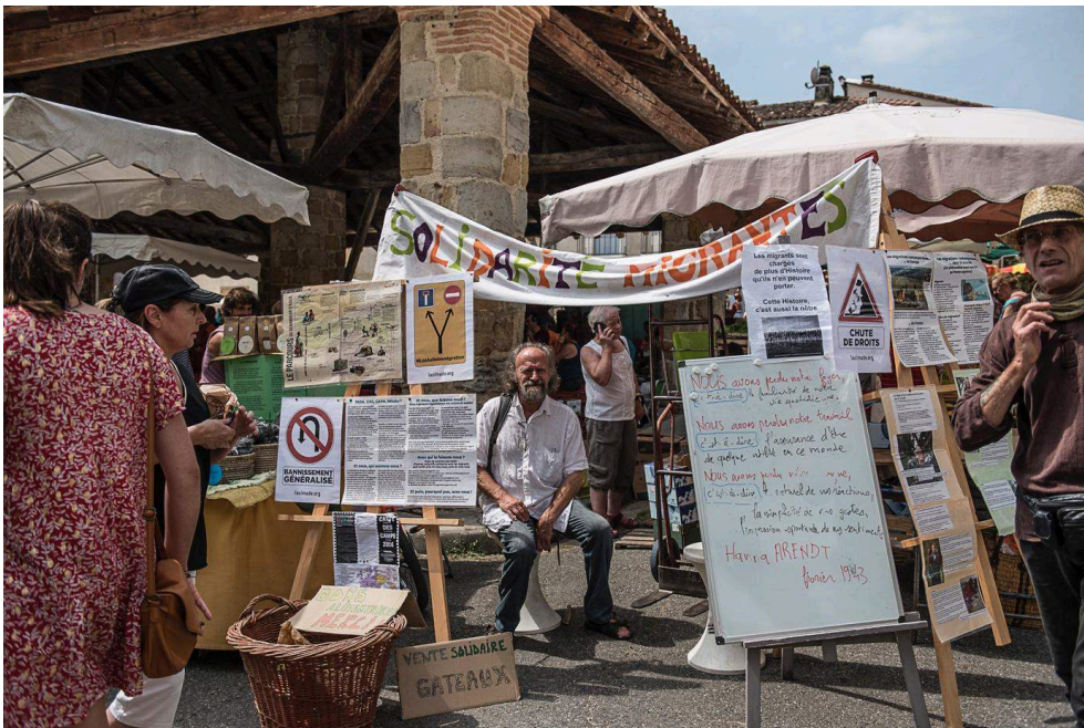
Photograph by Céline Gaille, May 2019