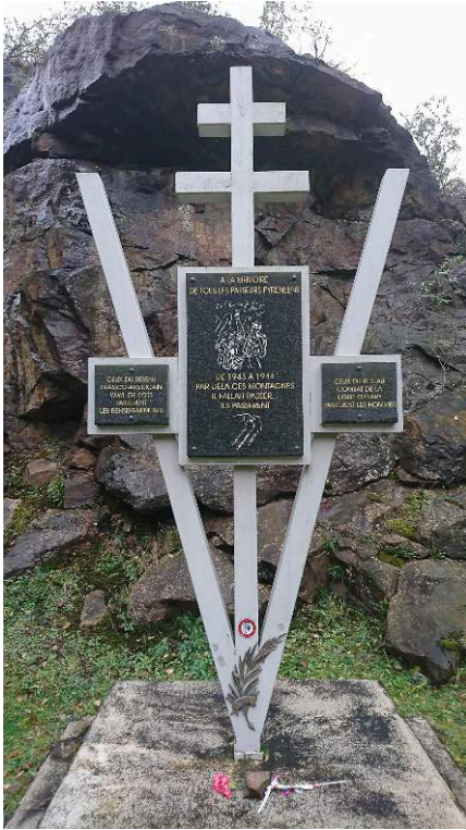
November 2019