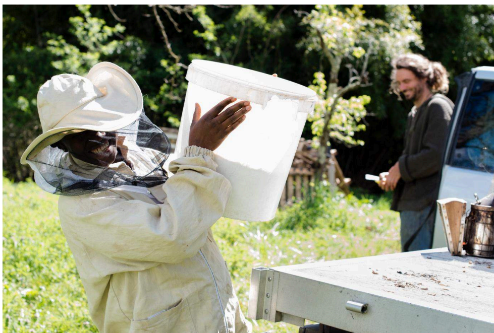
Photograph by Céline Gaille, March 2019