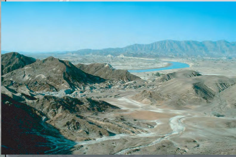
11. Sotka Koh