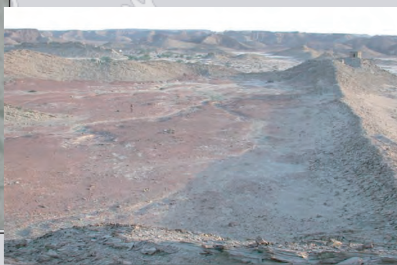
12. Sutkagen Dor