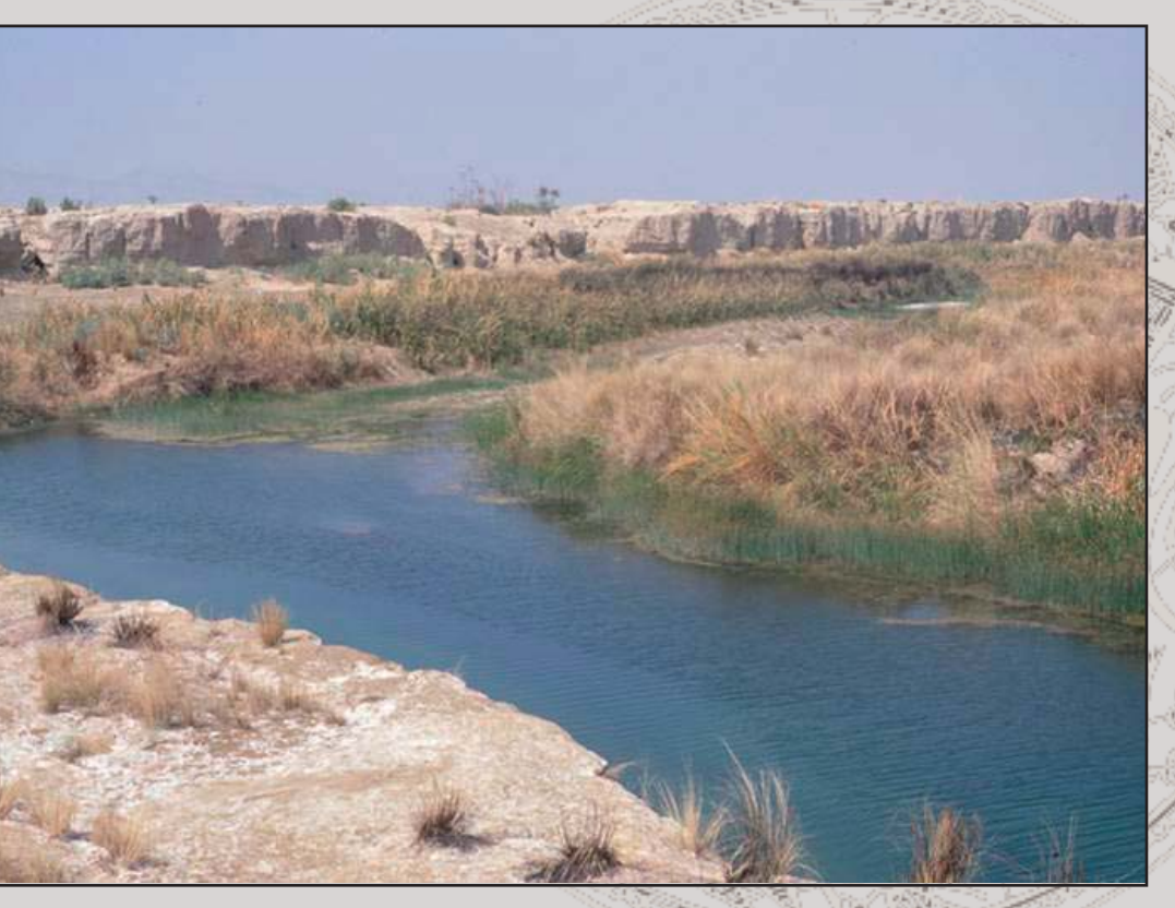
The site of Mehrgarh cut by the Bolan River