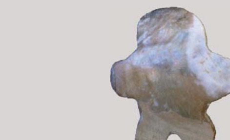
Mother-of-pearl figurine and funerary goods from period I