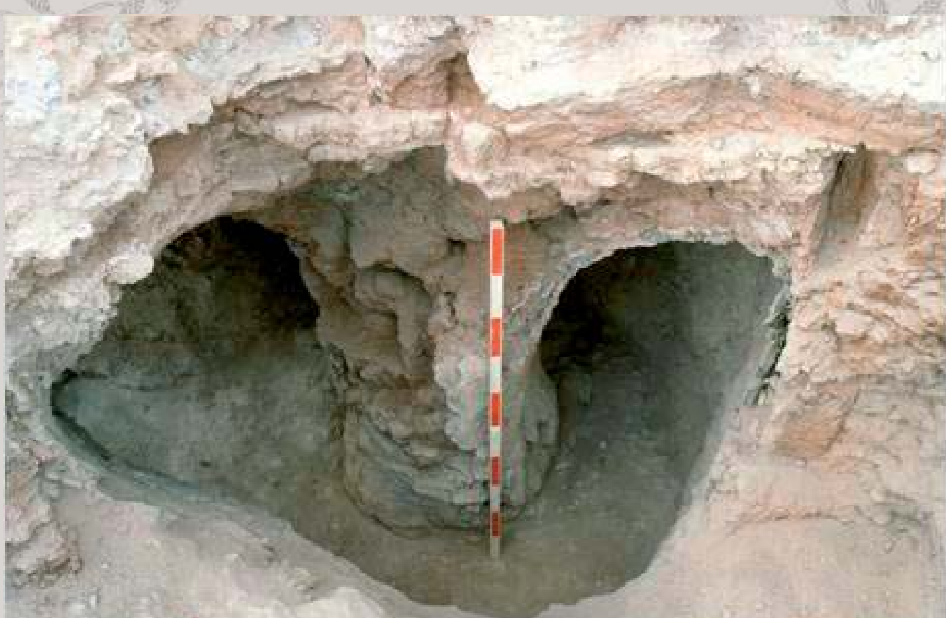
Lal Shah: double-chamber potter's kiln from period Nausharo IC (2700-2600 BC).