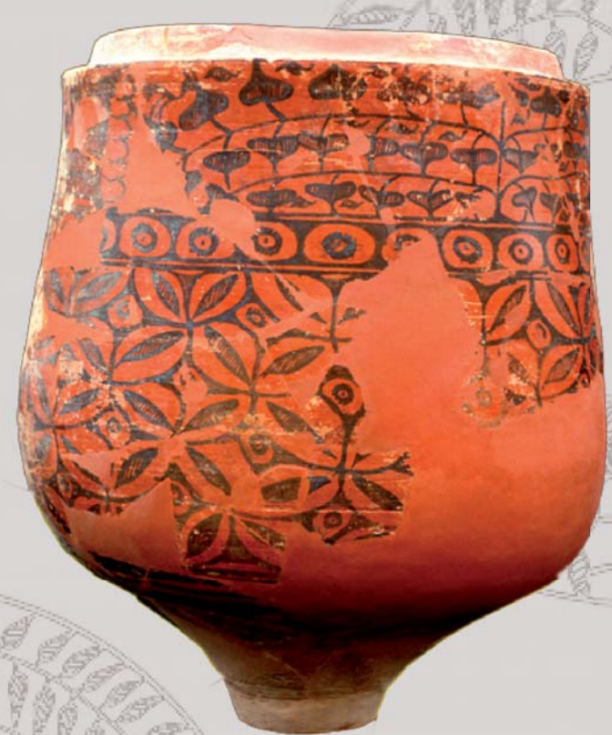
Period II pottery.

The excavated remains from Nausharo periods II and III (2nd half of the 3rd millennium BC) show the features of a classical Indus Civilization site with a planned architecture associated with drains and sanitary installations. The pottery has evidenced a stylistic and technological evolution similar to those of other Indus sites in the Greater Indus Valley. Besides pottery, all the other artefacts (seals, figurines and other objects) are typical of the Indus civilization. In period IV (2100-1900 BC), the material assemblage of Nausharo also includes some features characteristic of the Oxus Civilization which has developed in Central Asia (Margiana, Bactria) between 2200 et 1800 BC. Artefacts characteristic of the Oxus civilization were also discovered, mainly in graves, at Mehrgarh VIII, Sibri, Dauda Damb and at Quetta.