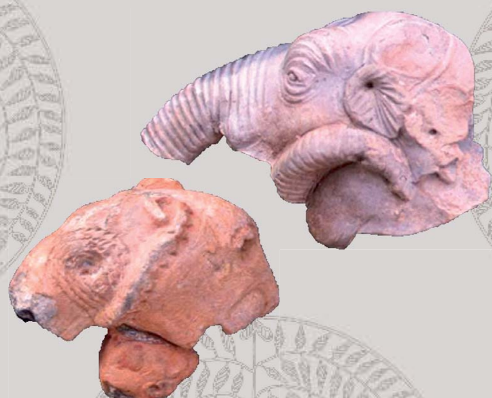
Terracotta figurines, steatite stamp seals, necklace with terracotta beads and miniature cart from period III (2300-2100 BC).