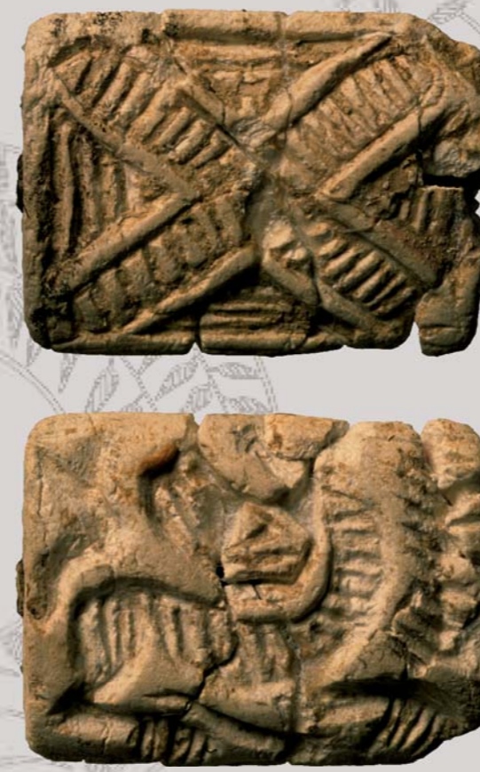
Funerary pottery from Dauda Damb, seal and metal weapon from Sibri (2100-1900 BC).