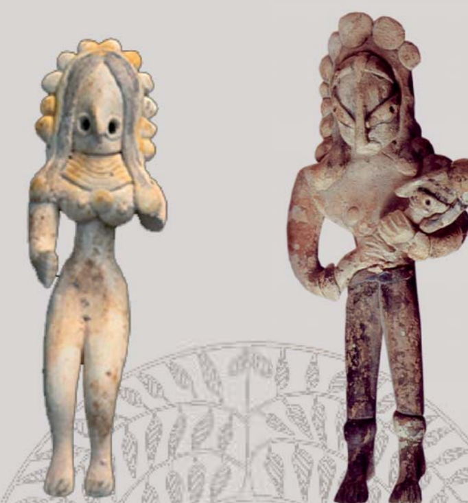
Human figurines from period IB (2900-2700BC) and ID (2600-2500 BC)