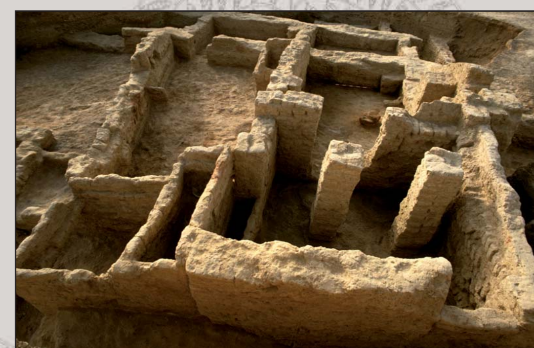
Mudbrick architecture of period IC