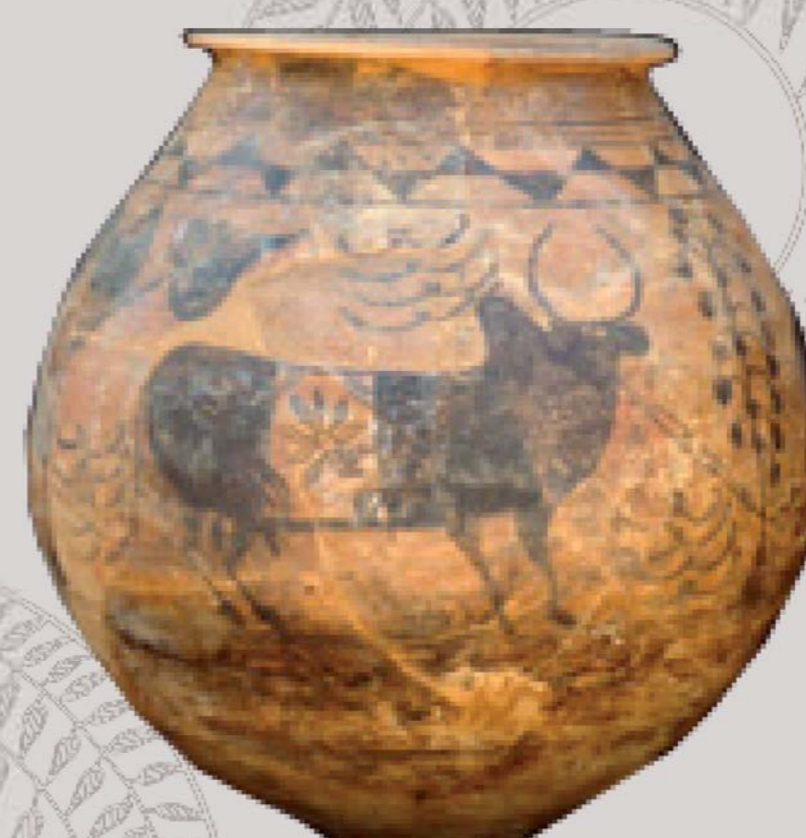
Period ID pottery