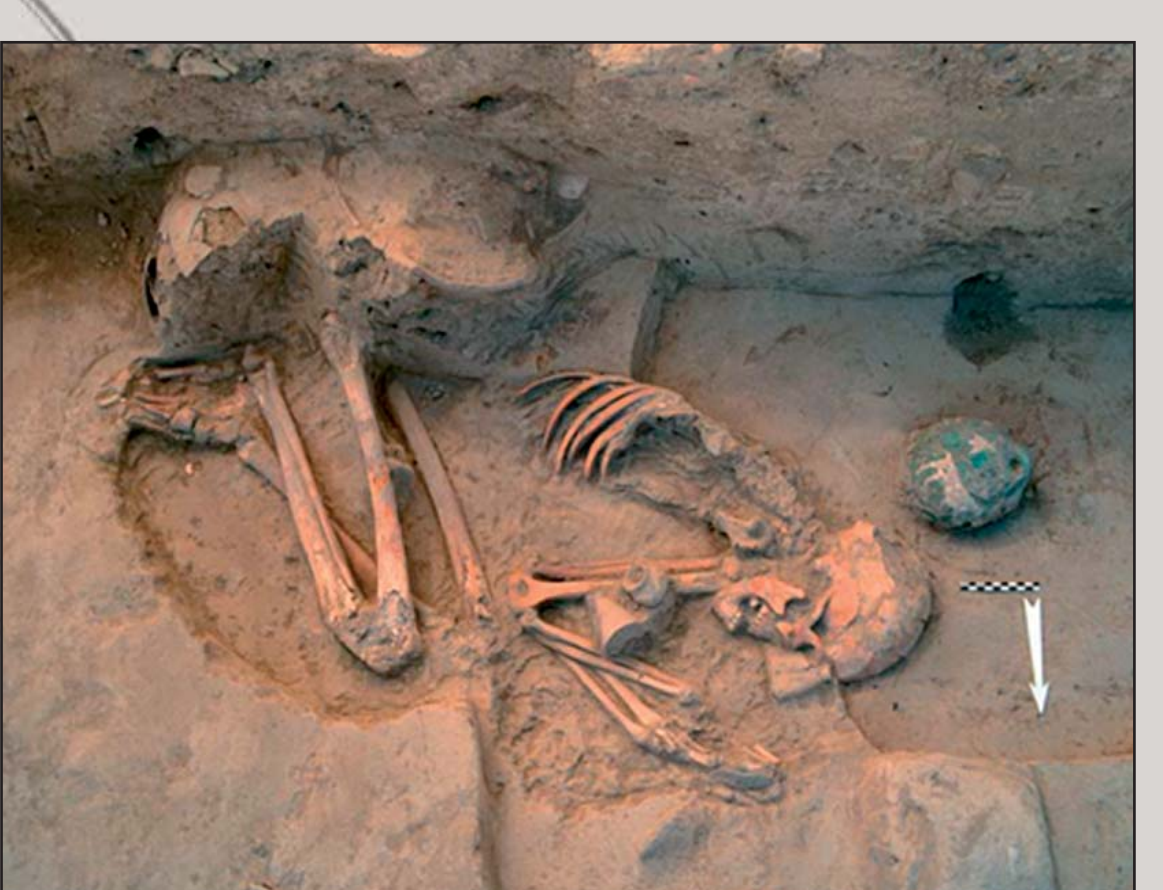
A period IIIa grave with the 'leopard weight' (2nd half of the 4<sup>th</sup> millennium /beginning of the 3<sup>rd</sup> mil. BC.

At right: detail of the 'leopard weight' analyzed