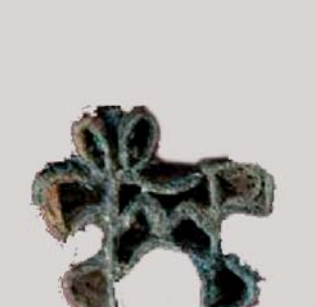
Metal seals and necklace (beads in fired and unfired steatite, cornelian and lapis-lazuli) discovered in period IIIa graves (2<sup>nd</sup> half of the 4<sup>th</sup> millennium/beginning of the 3<sup>rd</sup> millennium BC).