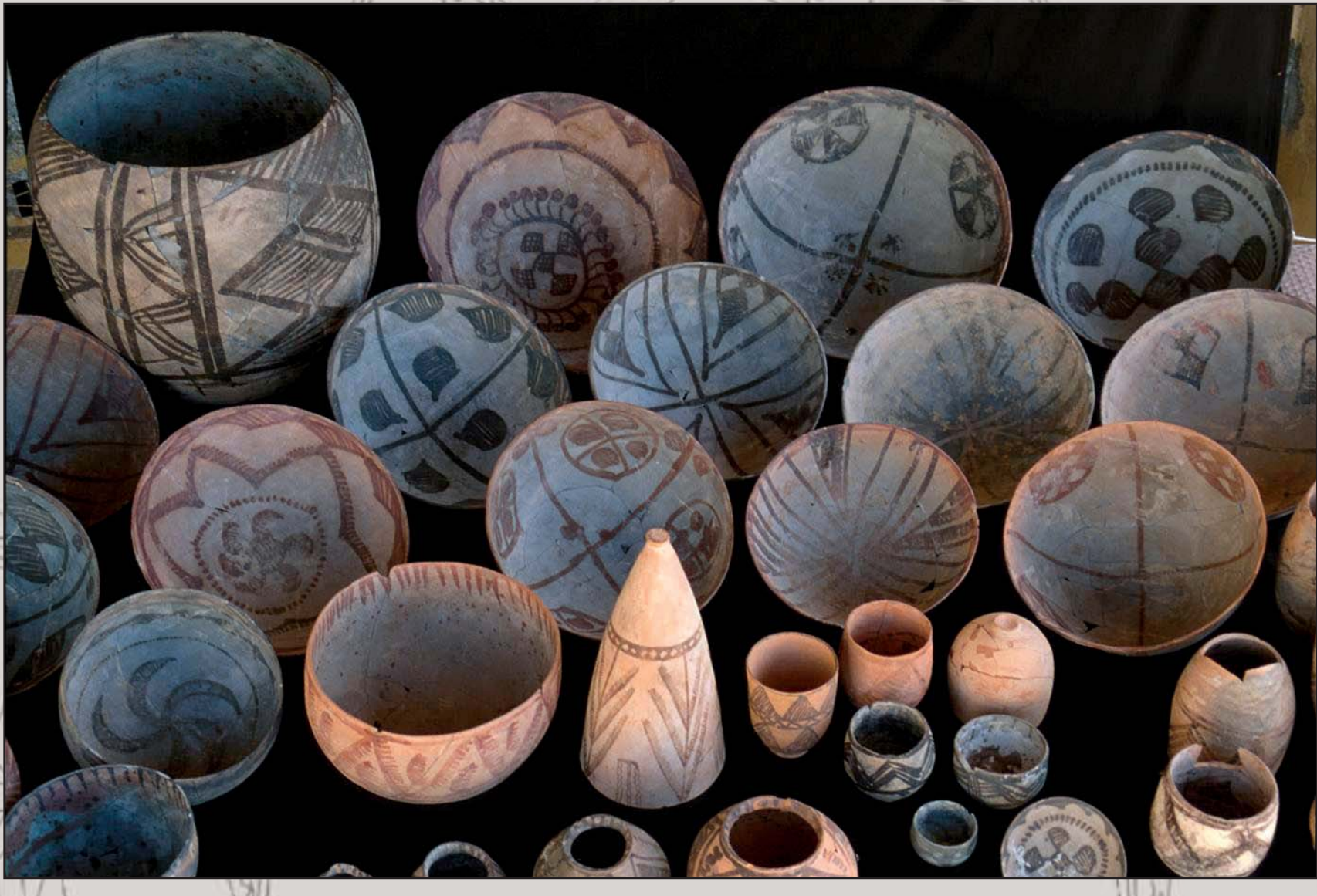
Funerary pottery from period IIIa (2<sup>nd</sup> half of the 4<sup>th</sup> millennium/beginning of the 3<sup>rd</sup> millennium BC).