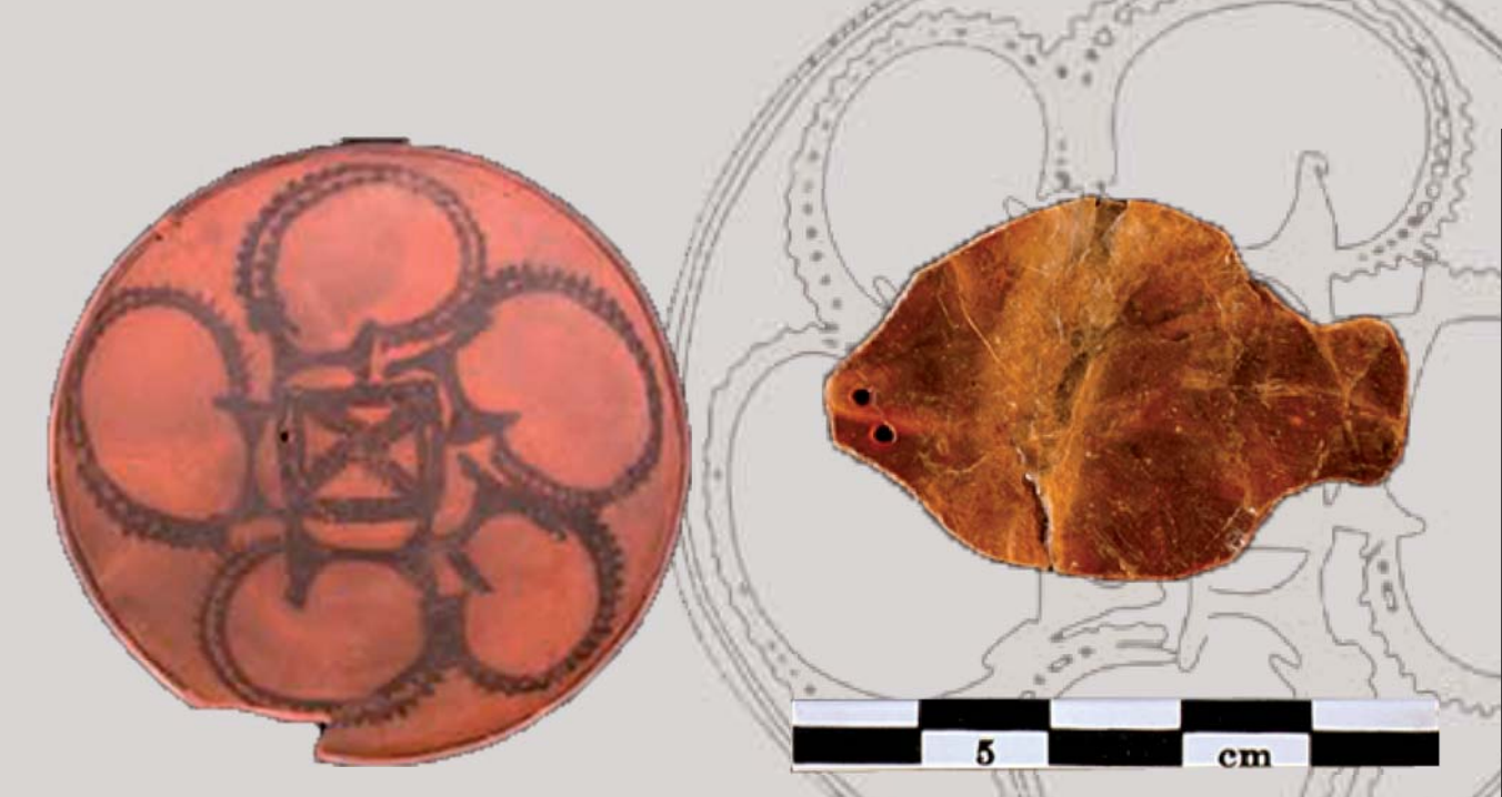
Period II pottery and fish-pendant in mother-of pearl (1st half of the 4<sup>th</sup> millennium BC).