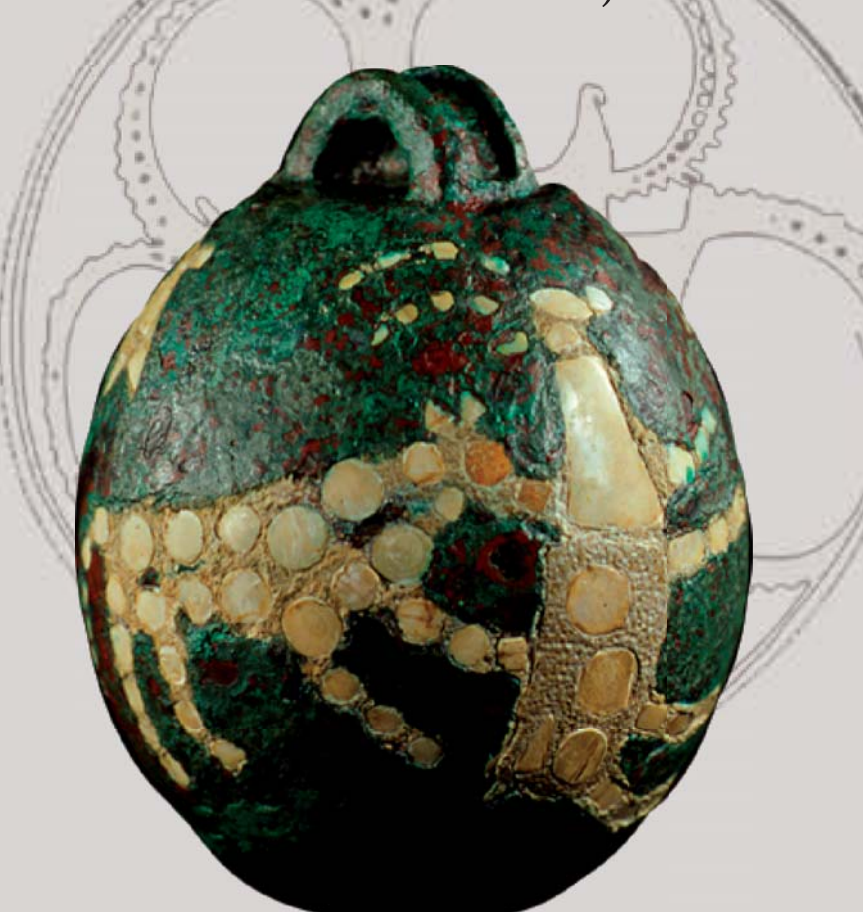
in the Center for Research and Restoration of the