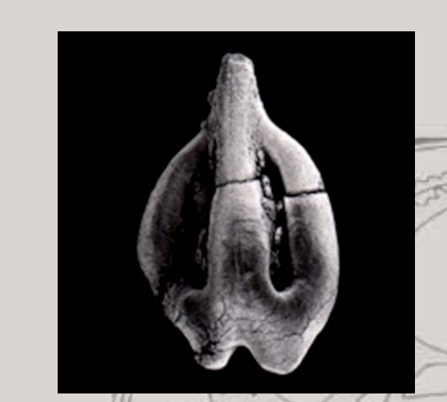
Protohistoric grape seed and flotation treatment processedby M. Tengberg to collect archaeobotanic remains.