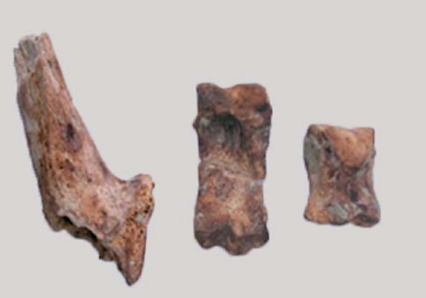
Studying mammal and fish bone remains.