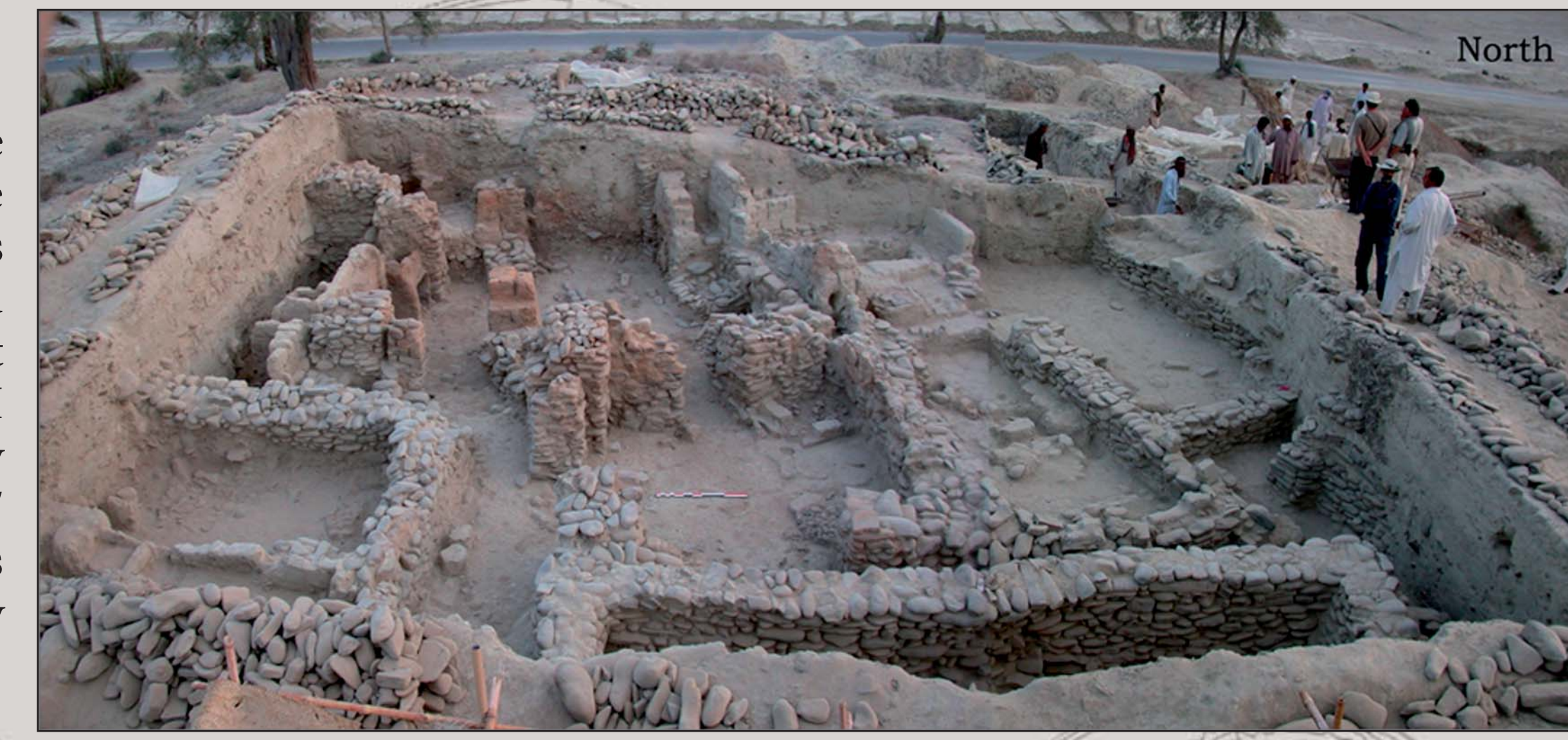
Period II architectural levels in Trench II (1st half of the 4th millennium BC).

The site of Shahi-Tump (10km south from Miri Qalat) is located on the left bank of the Kech River. The objective of the field-campaigns was to broaden our knowledge of the Chalcolithic occupation (5<sup>th</sup>-4<sup>th</sup> millennium BC) in Makran. Circular hut basemements dated to period I (5th millennium BC) were excavated in Trench I, while several Period II (1st half of the 4th millennium BC) architectural levels with quadrangular rooms built in stone and mudbricks were unearthed in Trench II on the top of the site. The period II occupation is also characterized by the discovery of burials which form the "oldest cemetery of Shahi-Tump". A later cemetery, dated to period IIIa (2<sup>nd</sup> half of the 4<sup>th</sup> millennium/ beginning of the 3<sup>rd</sup> millennium BC), has also provided the remains of 120 individuals buried with rich funerary deposits which included numerous painted pottery and highly elaborated craft products: metal objects (seals, tools, mirrors...), beads, stone vessels, etc.