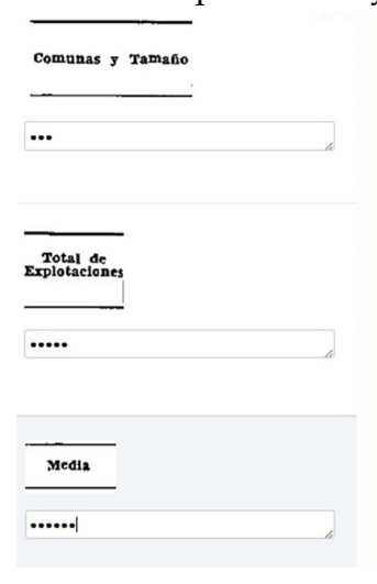
Figure 3. Ex-ante productivity test 2

There were 4 versions of the previous link (one for each treatment condition): "Thank you very much for your expression of interest. Below you can find more information about the position: