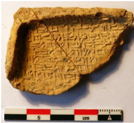
Fig. 8: Inside of the envelope Kt 93/k 865