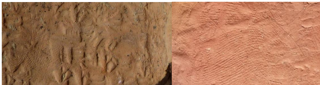
Fig. 12: textile and fibers imprints on the inside of envelopes

Several inner sides of envelope fragments show imprints of textiles and fibers; in such cases, the negative imprints of the tablet's signs are less visible. Such textile imprints were already observed on some tablets, and it was suggested that these tablets had been enclosed in their envelope before being completely dry. 47 In such a case, a fine textile was used to wrap the tablet before applying the envelope in order to avoid the clay of the tablet from sticking to the envelope. 48 When there was enough time to let the tablet be completely air dry, then there was no need to use a textile, the addition of a new and fresh layer of clay would not stick to it.