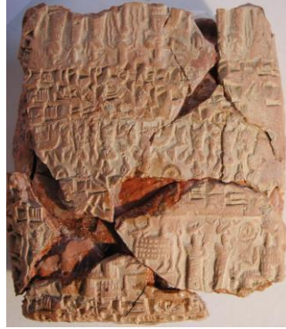
Fig. 6: Contract, Kt 93k 215a (4,7x4,2 cm)

On the envelope, there is no ruling separating the lines of text contrary to the systematic ruling on the tablet, even in the case of legal documents on which the text is quite long. The text is written with the same orientation as the seal impressions, but in some instances, some seal impressions may appear upside down (Fig. 6).