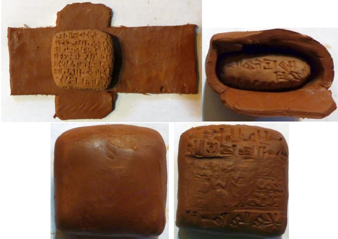
Fig. 14: The different steps in the manufacture of an envelope.

At last, before closing the envelope, it is necessary to leave a lot of free space between the tablet and the envelope, because during the drying process, the clay retracts a lot and thus can easily split or even break itself by retracting on the tablet. This explains why many envelope fragments have impressions of positive cuneiform signs, as the envelope by retracting took on the shape or even stuck to the tablet. Of the first envelopes made, one envelope out of two cracked after one day, and some even broke after two days. The envelope did not adhere to the tablet, and it was possible to make a replacement envelope after removing the remains of the broken envelope. If, when closing the envelope over the tablet there is too much free space, then it becomes very difficult to write on the envelope and to unroll the cylinder seals. It is therefore very important to find the best possible balance to adjust the clay envelope around the tablet.