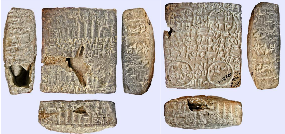
Fig. 3: Envelope of a loan contract belonging to Aššur-taklāku, the debtor is Kabašunuwa, son of Kēna-Aššur Kt 93/k 942 (4,6 × 5,1 cm).

mentioned at the beginning of the text, on the obverse of the envelope, in the form 'kišib PN' with their fathers' names (Fig. 3). In general, on the envelope, one finds first the names of the witnesses followed by those primarily concerned by the contract, as for example the debtor for a loan contract.