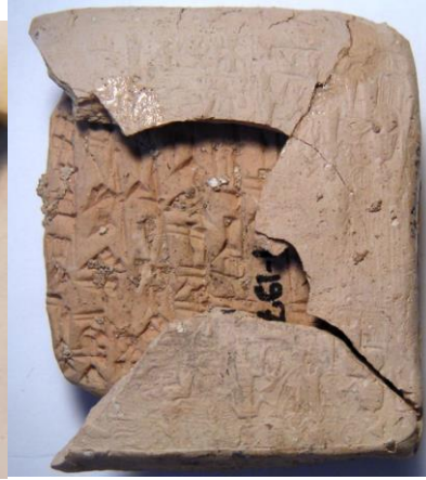
Fig. 9: Join between envelope fragments Kt 93/k 232+136 + 220