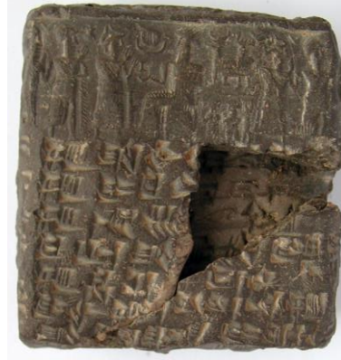
Fig. 4b: Contract, Kt 93/k 945 (5,3x5,7 cm). The text on the envelope is written parallel to the one on the tablet, but head to tail.

The seals were usually first impressed on the envelope before the text was written; thus some wedges overlap regularly the feet or the heads of the figures of the seal's scene (Fig. 5).