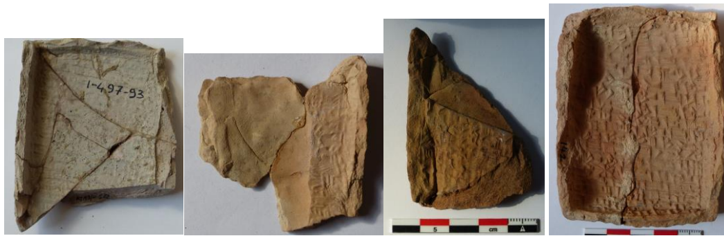
Fig 11: Insides of envelope fragments.

the tablet and over itself so that it's both ends overlapped. The envelope was more or less thick, often thinner on the edges than on the obverse or on the reverse where the clay overlapped. Different layers of clay can be sometimes distinguished (Fig. 11). 46 Indeed, inside some of the envelope fragments, we observe a completely smooth part, suggesting that, either on the obverse or on the reverse, the layers of clay of the envelope superimposed allowing to close it. When broken, the superimposed layers have been occasionally detached leaving a more or less flat surface, along the zone with negative imprints of cuneiform signs (Fig. 11).