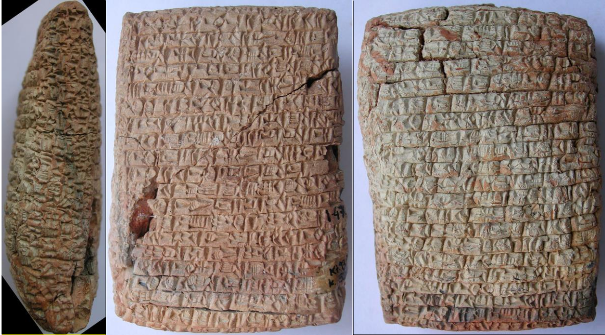
Fig. 1: Letter to Rabi-Aššur, Ataya, Puzur-Aššur, Šu-Ištar, Šamaš-abi, Anina, Amārum, and Tariša from Aššur-taklāku; Kt 93/k 526 (4,9x6,7 cm), left edge, obverse and reverse.

The envelope protected the letter during its transportation, both the object itself and the intimate character of the text content. The obverse of the envelope contains the name or the names of the addressees, sometimes with their patronyms, and the name of the sender, whether one or several, with the indication that he has or they rolled his or their seal on the surface of the envelope; the corresponding seal impressions are visible on both sides and over all the edges (Fig. 2). The owner(s) or user(s) of the seal(s), often anepigraphic, can therefore be identified more easily. In a few cases, two or three lines of text are added, prompting the reader to carefully read the content of the message. The reverse of the envelope with its two seal impressions, with a blank space in between, is usually uninscribed. Thus, when we deal with a fragment of the reverse, it is very difficult to match it with its corresponding tablet.