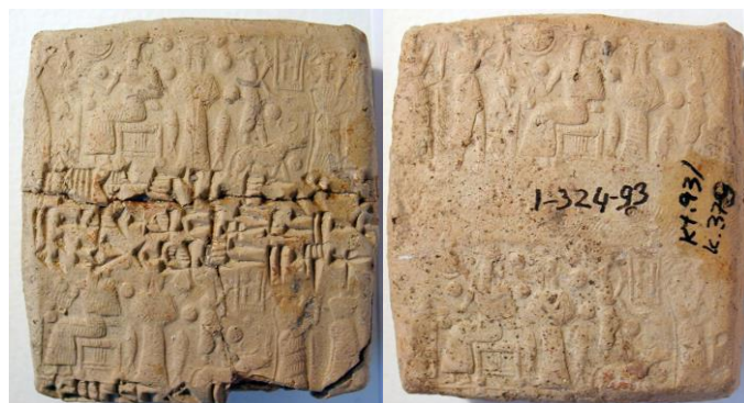
Fig. 2: Envelope of a letter from Ah-šalim to Ištar-bāni, Kurub-Ištar and Hattiya; Kt 93/k 379 (5 × 4,6 cm).

The envelope protected the letter during its transportation, both the object itself and the intimate character of the text content. The obverse of the envelope contains the name or the names of the addressees, sometimes with their patronyms, and the name of the sender, whether one or several, with the indication that he has or they rolled his or their seal on the surface of the envelope; the corresponding seal impressions are visible on both sides and over all the edges (Fig. 2). The owner(s) or user(s) of the seal(s), often anepigraphic, can therefore be identified more easily. In a few cases, two or three lines of text are added, prompting the reader to carefully read the content of the message. The reverse of the envelope with its two seal impressions, with a blank space in between, is usually uninscribed. Thus, when we deal with a fragment of the reverse, it is very difficult to match it with its corresponding tablet.