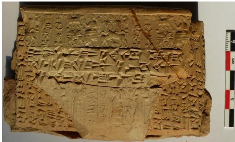
Fig 4c: Letter Kt 93/k 143 (env. 6,5 × 9,5 cm). The text on the envelope is written perpendicular to the one on the tablet.

The seals were usually first impressed on the envelope before the text was written; thus some wedges overlap regularly the feet or the heads of the figures of the seal's scene (Fig. 5).