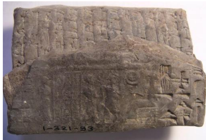
Fig. 7: Royal letter Kt 93/k 201+376+381 (8,4 × 5,3 cm, envelope 4,2 × 8,6 )

On the envelope, there is no ruling separating the lines of text contrary to the systematic ruling on the tablet, even in the case of legal documents on which the text is quite long. The text is written with the same orientation as the seal impressions, but in some instances, some seal impressions may appear upside down (Fig. 6).