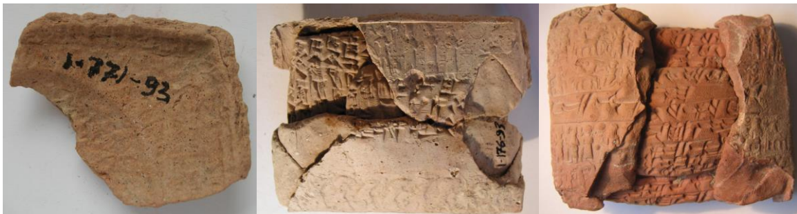
Fig. 10: inside of the envelope Kt 93/k 843 with the negative imprint of a “second page”; Kt 93/k 211: Tablet and “second page” preserved in their envelope; Kt 93/k 55+120+831+240: join between two envelope fragments, main tablet and “second page”.

The inner side of some envelope fragments have a circular depression indicating that the letter originally contained two ‘pages’ enclosed in the same envelope (Fig. 10). The second ‘page’, referred to in the texts as šibat tuppim , ‘tablet supplement’, is usually a flat oval or lenticular piece of clay written only on one side and placed over the obverse or the reverse of the main tablet, with the text facing the envelope. 45 When the envelope was open, the two pages of a letter were separated and there is no indication in the text helping to match them again. To connect them again, the identification of the corresponding envelope is of great help. When the envelope has remained intact, a bulge on one of its faces indicates the presence of a small second page (Fig. 10). There are several such small tablet supplement in the ‘1993 archive’, some remained seldom.