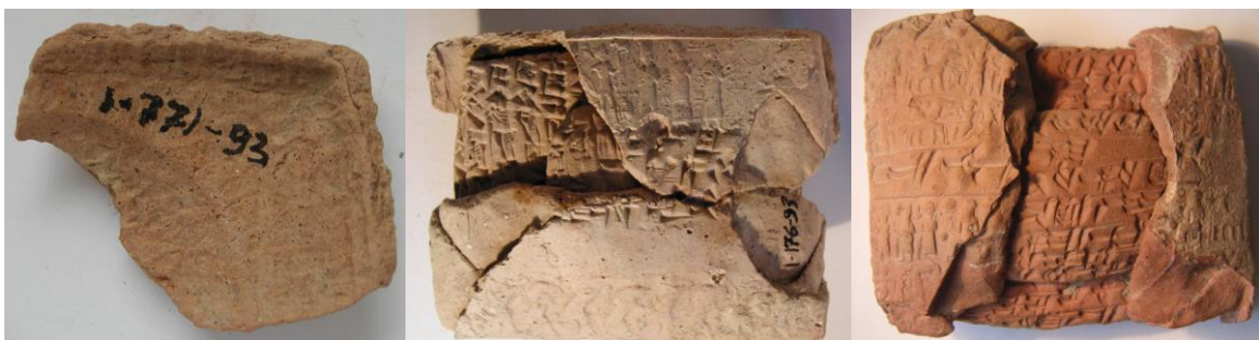
Fig. 10: inside of the envelope Kt 93/k 843 with the negative imprint of a “second page”; Kt 93/k 211: Tablet and “second page” preserved in their envelope; Kt 93/k 55+120+831+240: join between two envelope fragments, main tablet and “second page”.

The inner side of some envelope fragments have a circular depression indicating that the letter originally contained two ‘pages’ enclosed in the same envelope (Fig. 10). The second ‘page’, referred to in the texts as šibat tuppim , ‘tablet supplement’, is usually a flat oval or lenticular piece of clay written only on one side and placed over the obverse or the reverse of the main tablet, with the text facing the envelope. 45 When the envelope was open, the two pages of a letter were separated and there is no indication in the text helping to match them again. To connect them again, the identification of the corresponding envelope is of great help. When the envelope has remained intact, a bulge on one of its faces indicates the presence of a small second page (Fig. 10). There are several such small tablet supplement in the ‘1993 archive’, some remained seldom.