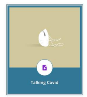
Figure 7: Navigation in the 'Coffee Break' space

Finally came the Coffee Break space that encouraged interaction and allowed for less formal discussions around the themes of the event (including the participant anecdotes and the 'elephant