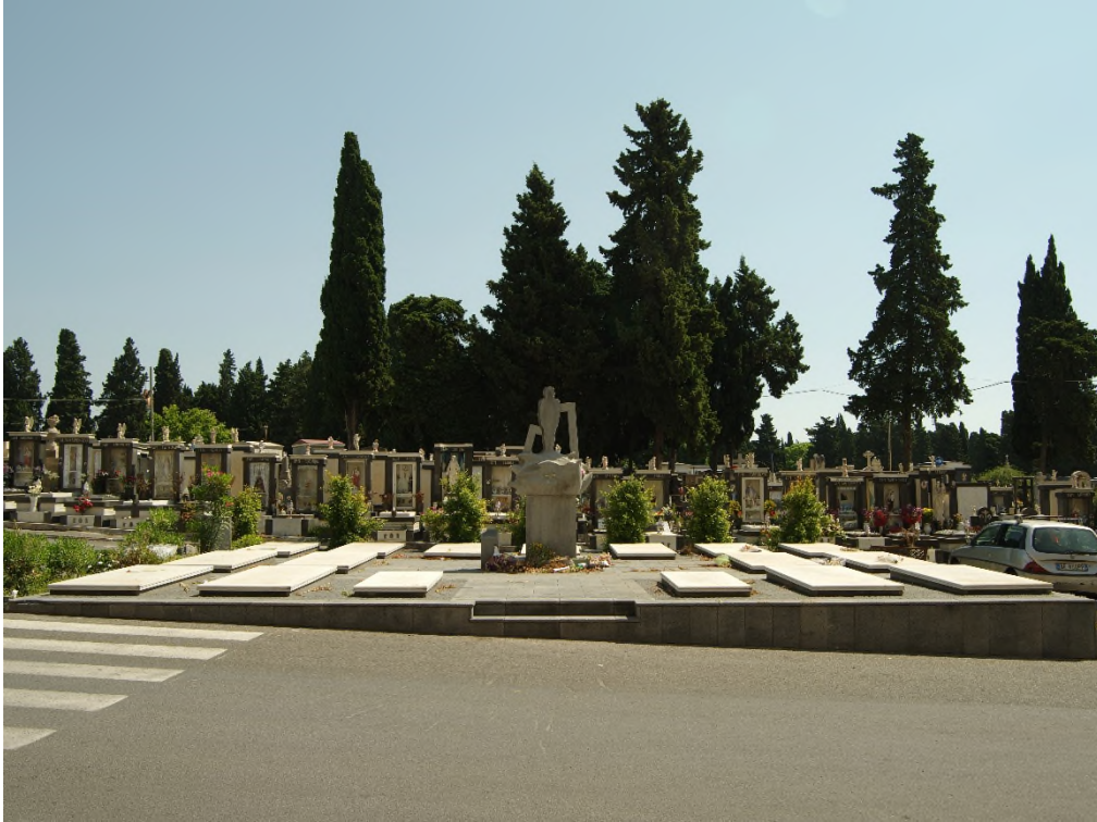
Picture of the monument erected by the City of Catania to commemorate the deceased migrants.