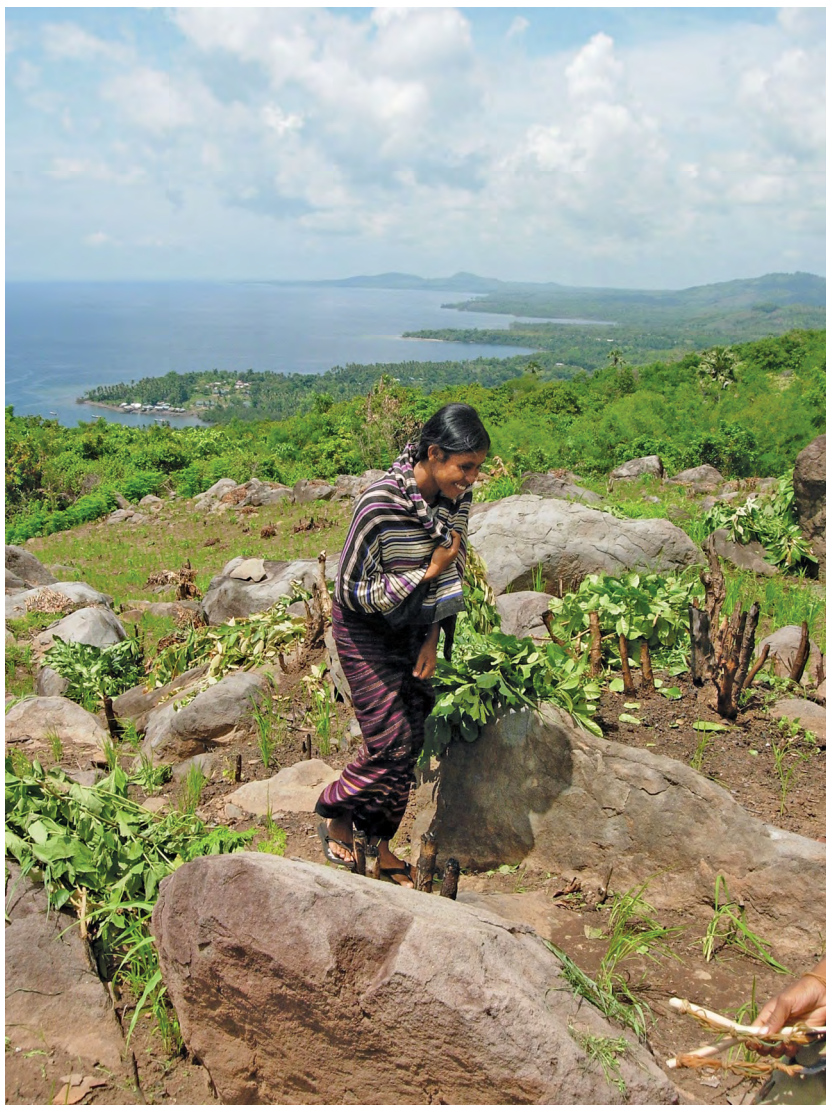
Plate 7.2 A rice maiden, helo nikat ritual, Waiklibang, 2007