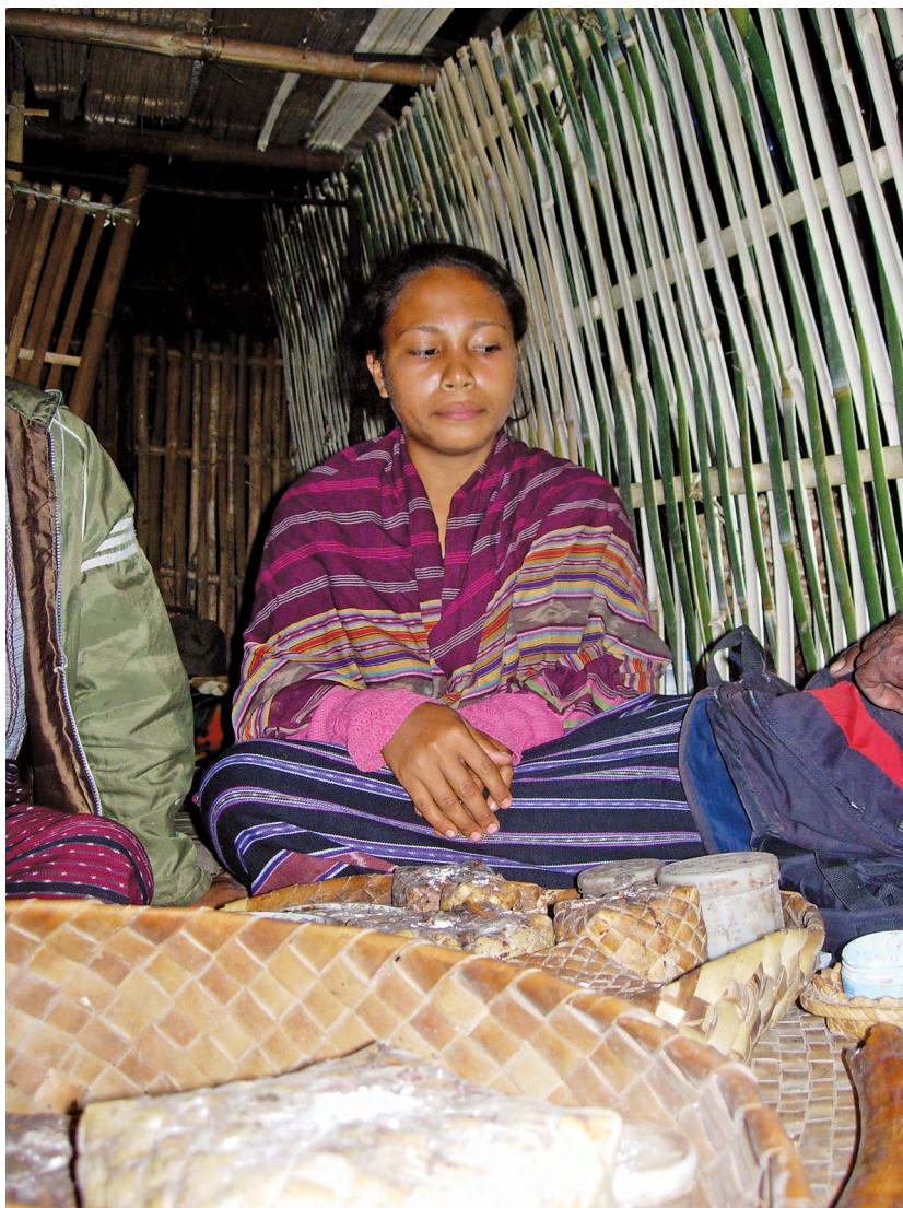
Plate 7.1 A rice maiden, dokan gurun ritual, Waiklibang, 2006