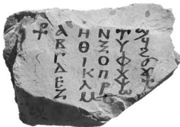
Figure IV.8.1. A limestone ostrakon with a Coptic alphabet (Thebes, seventh to eighth century). The Greek letters are on the first four columns and the Egyptian ones on the fifth. O. Frange 480, TT 29 inv. 292414.

(p. 619) Coptic manuscripts, however, are rarely associated with an archaeological context and are often deprived of absolute dating. Thus the main challenge of palaeography is to overcome this lack, trying to place in time and space a witness detached from its original environment (Kasser 1991b). It is a still underdeveloped and inexact discipline, the task being complicated by the fragmented state of the documentation, the diversity of textual genres and dialects, and the multiplicity of materials as well as the conservatism of the scribes and copyists. It can rely to some extent on the comparison with Greek manuscripts produced in Egypt, especially in the period before the Arab conquest. It also shares several issues with the study of Oriental manuscripts. Other important questions related to social phenomena are also at stake in Coptic palaeography, namely, the existence and organization of writing centers (scriptoria) or the modalities of learning.