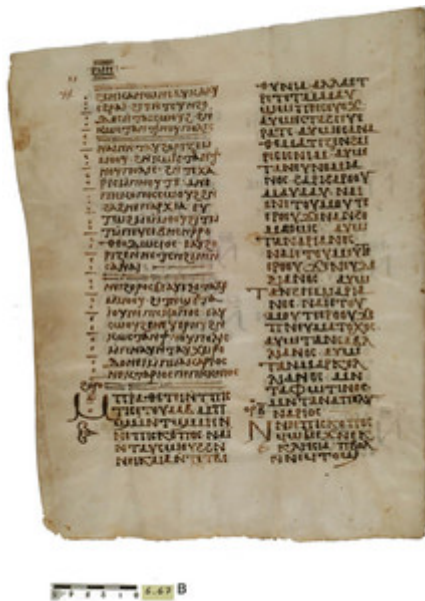
Figure IV.8.2. A leaf of a manuscript with a Coptic translation of the Acta Conciliorum (White Monastery, tenth to eleventh century). The text is copied in Coptic majuscule, while the introductive sections are in sloping majuscule. IFAO, Copte 067v.

These types can be matched with periods of time as shown in Table IV.8.2, which is inspired by a recently proposed classification for “canonized” scripts in early Greek manuscripts (Orsini and Clarysse 2012). It should be added to the types mentioned earlier an upright and thin majuscule, only found in papyri of the earliest period. Such a periodization remains rough, as several types of writing are used at the same time, especially the biblical majuscule, which has a long history, and even within the same (p. 622) manuscript. This latter phenomenon is known as the use of “distinctive” scripts. For example, a manuscript copied in unimodular majuscule may include section titles in bimodular majuscule, while the final annotations of the copyist (colophons) are generally written in sloping majuscule (Figure IV.8.2.).