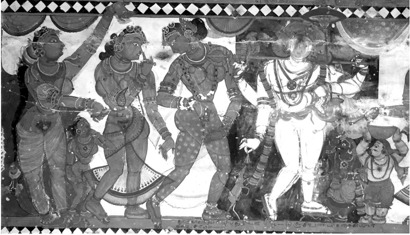
Fig. 4. The Devadāru myth is frequently inflected in the South for other purposes. Here, in one of the ceiling-paintings of the maṅḍapa in front of Śiva’s consort in Chidambaram, Śivakāmeśvarī, the story involves not only the seduction of the sages’ wives by Śiva, but also the seduction of the priapic sages themselves (not shown in this photograph) by Viṣṇu as Mohinī, all as part of a legend justifying the sacredness of Tillai (now Chidambaram).

In the following list, for example, which we find at the top of a long quotation attributed to the Kāraṅṅagama (but not found in either of the printed editions of that text) in Vedajñāna’s 16 th -century Āśauca-dīpikā (“Lamp illuminating [the rules of] Impurity”), we read of numerous grades of women belonging to Śiva, culminating in those with the most prestigious name, Rudrakanyā.