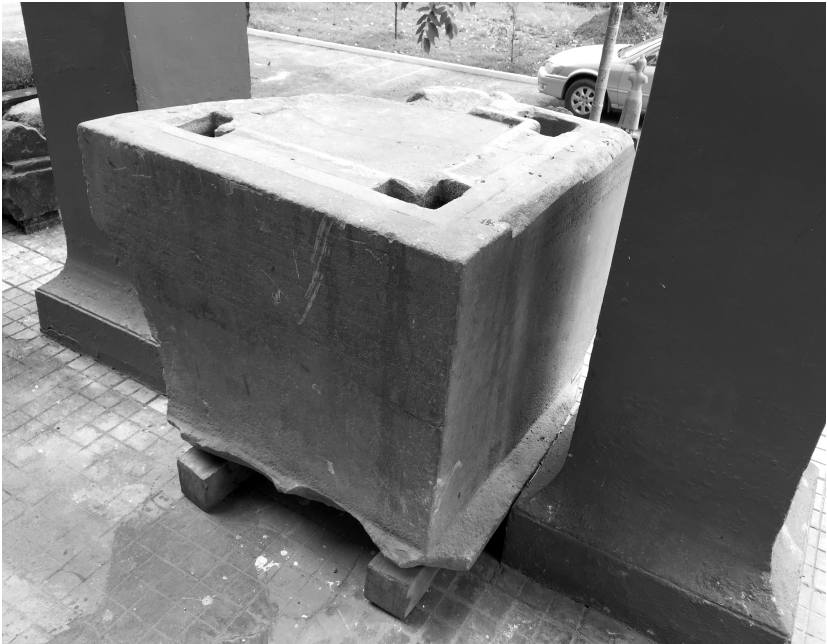
Fig. 1. Pedestal from Angkor Borei.

Another Khmer inscription is therefore worth introducing at this juncture: an imposing pedestal in sandstone inscribed on three of its four faces stands in front of the Stone Restoration Workshop of the National Museum of Cambodia in Phnom Penh.