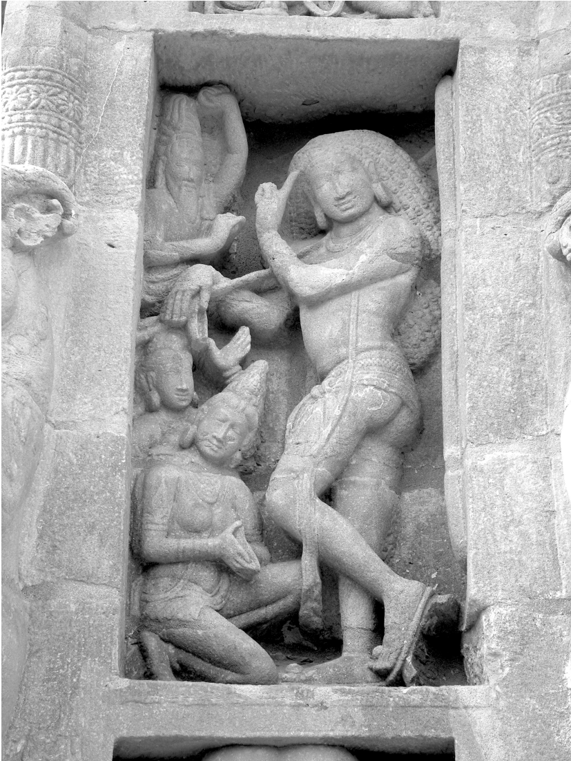
Fig. 3. The Devadāru myth is a popular one in literature and sculpture in the Tamil South. This panel in the Kailāsanātha temple in Kancheepuram shows Śiva among the ascetics' wives, with an ascetic behind.