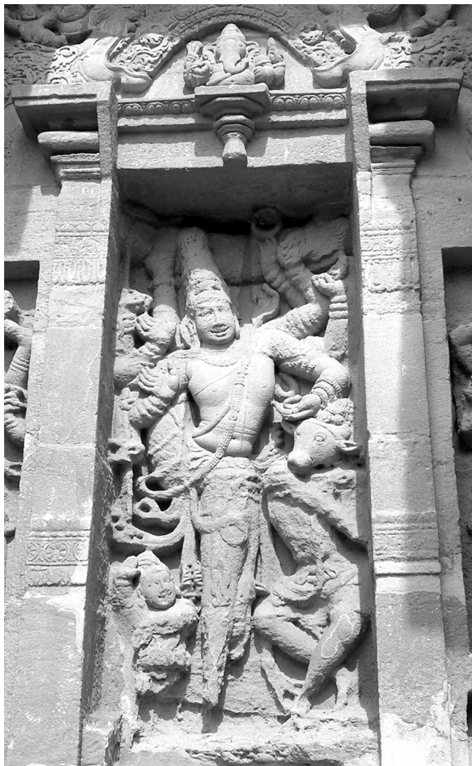
Fig 5. Kailāsanātha, Śiva and Nandin dancing.