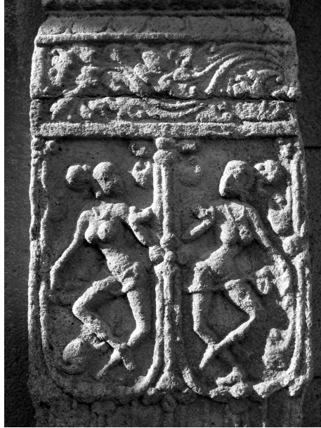
Fig. 6. Sculpture of dancing figures decorating the temple of Pullamangai.

The making of temples, tanks and gardens, the construction of causeways (?) and fireplaces (?), giving thousands of cows to brahmins through an intermediary recipient , directing the worship and offerings to deities, giving money that can be spent on the above: these are [the expenses paid for out of] excess income for the best class of courtesans. 48