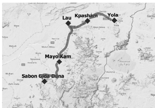
Figure 1. The itinerary of the 2016 AdaGram survey

details). The general goal of this survey was to gather basic lexical and grammatical data for a number of languages of the region about which almost nothing is known. Another goal was to establish contacts with these linguistic communities to prepare ground for prospective PhD candidates who would undertake comprehensive grammatical and lexical descriptions of these languages for their PhD. Figure 1 shows the itinerary of the survey with Yola as its starting point and the four settlements visited, Kpasham, Lau, Mayo Kam and Sabon Gida Duna.