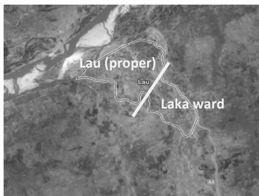
Figure 3. The two parts of the town of Laka: Lau proper and the Laka ward

However, our survey established that the town of Lau is divided between two distinct linguistic communities who speak mutually unintelligible languages. The map in Figure 3 shows the town of Lau and its approximate division into two parts, Lau proper in the northwest closer to the Benue River and the Laka ward of Lau (Hausa Angawan Lakawa , formerly known as Garin Lakawa 'Laka town').