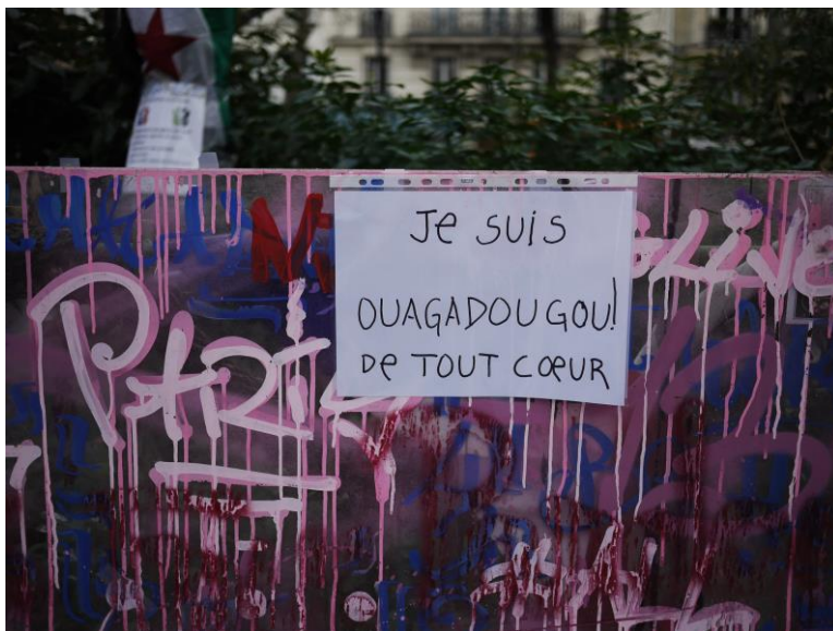
Fig.3: ‘I am Ouagadougou! with all my heart’. Bataclan, Paris, 18 January 2016 © G r me Truc

countries, from Portugal to Tunisia, as occurred previously in London after the bombings on 7 July 2005 (Truc 2018). From the start, the (bi)nationality of the victims and some of their close friends and relatives, staged the memorial as a transnational symbolic space. But beyond this first dimension, the transnationalization of the grassroots memorials also relied on the frequent inclusion of other terrorist attacks in the scope of the events to be mourned and memorialized on these sites. In December 2015, it was someone from Turkey who attached a message to the metal fence in front of the Bataclan, paying homage to the victims of the attack in Ankara on 10 October 2015. 8 Again in January 2016, a man who identified himself as coming from Africa, pasted a short but clear message on a pre-existing pink poster speaking of love, ‘I am Ouagadougou! with all my heart’ [Fig.3], the Burkina Faso capital having just been hit by a terrorist attack. 9