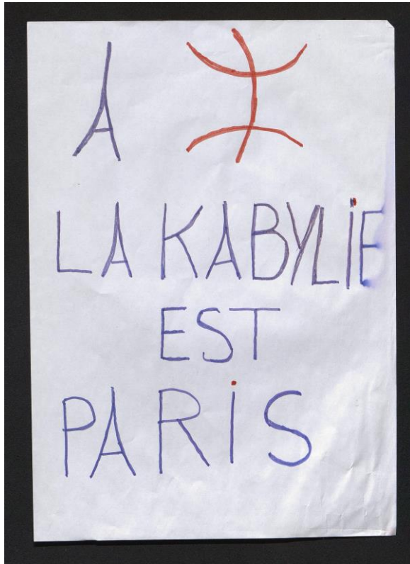
Fig.1 'Kabylia is Paris' © Paris Archives, document 3907W1-109

After the 11 March 2004 attacks in Madrid, messages written by migrants were mainly from countries of South America – Ecuador, Peru, Colombia, Argentina, etc. (Sánchez-Carretero 2011). Given the history of migration in France, it is not very surprising to note that in the case of the post-13 November grassroots memorials in Paris, countries of Africa, and more precisely former French colonies of North Africa prevail – particularly Algeria, but also Morocco and Tunisia. It must also be taken into account that the perpetrators of the November attacks were from families originating from these countries and that these Islamist attacks, consequently, were particularly difficult to live with for French citizens born in these same countries and of Muslim faith or culture (see Geisser et al. 2017; Beaud 2018, cpt.10).