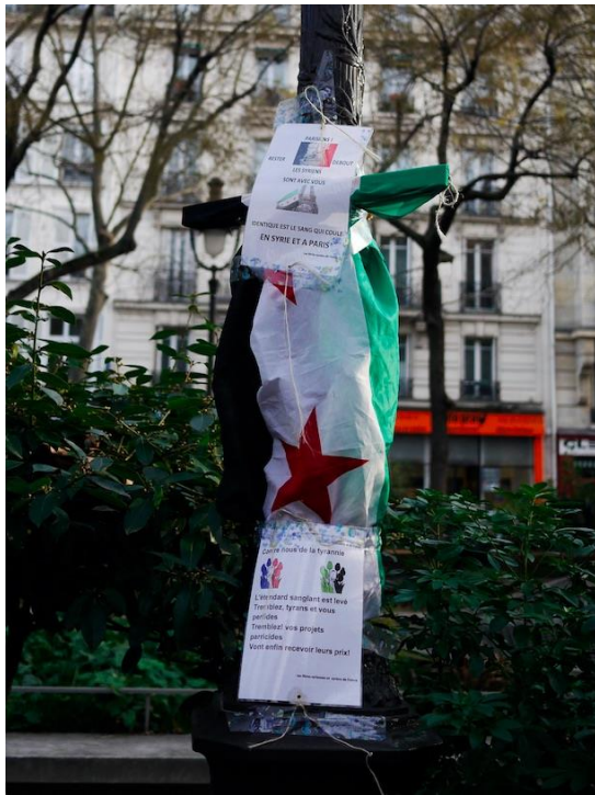
Fig.2: Messages left by the ‘Free Syrians of France’ in front of the Bataclan, 11 January 2016 © G r me Truc

Paris' 7 . Here, migrants appear as a key factor in the transnationalization of the post-November grassroots memorials in Paris.