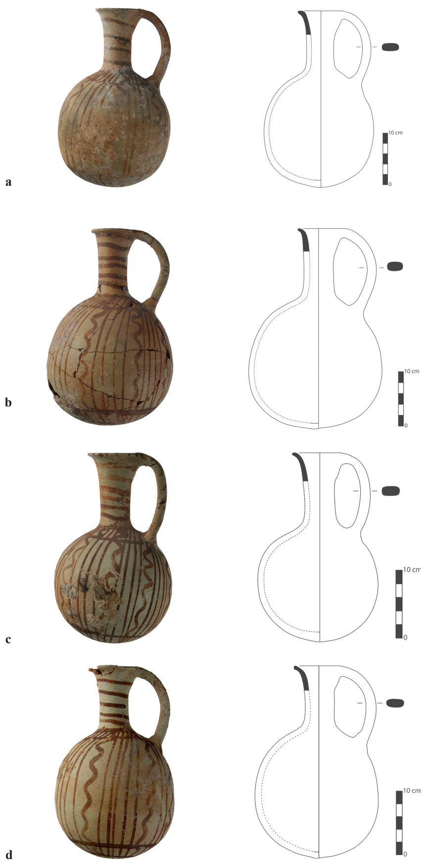
Pl. 1 Local imitations of Cypriot WP PLS juglets from L1421, Area F/II, a. 9556 ; b. 9557 ; c. 9559 ; d. 9560