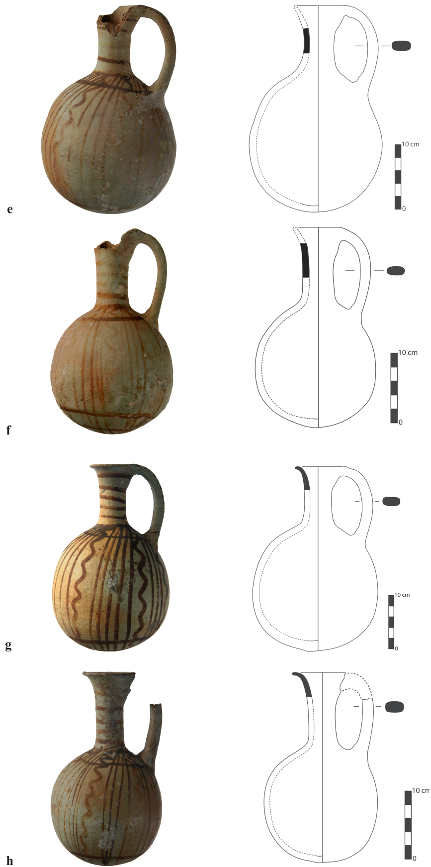
Pl. 2 Local imitations of Cypriot WP PLS juglets from L1421, Area F/II; e. 9561 ; f. 9562 ; g. 9582 ; h. 9583