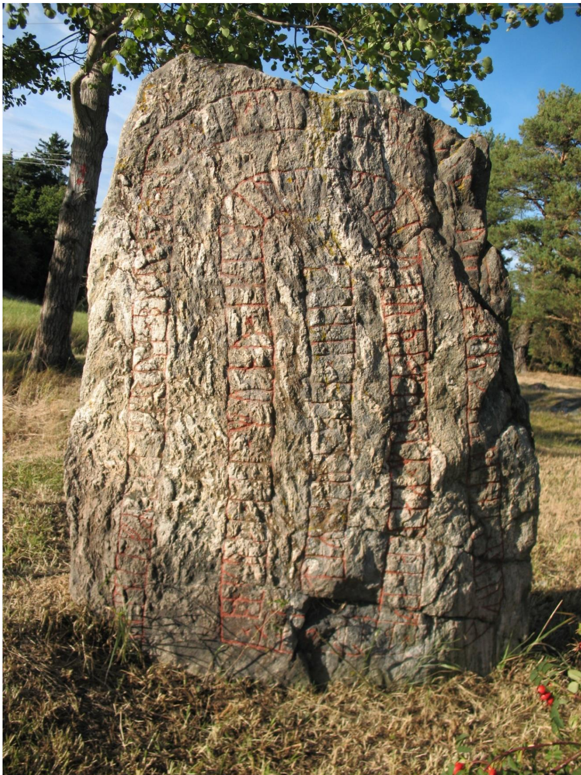
The Eggeby stone, in Sweden, Viking Age memorial runestone.

By focusing on the rune-stone U 69 Eggeby (Spånga sn, Sollentuna hd, Uppland, Sweden), Marco Bianchi is interested in potential traces of other media in with Runic inscriptions and how they might have been understood by contemporary,