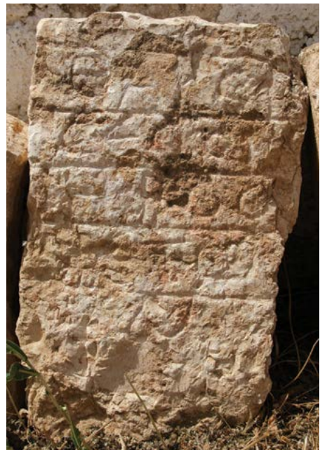
Figure 23: Tombstone of Severos (18).