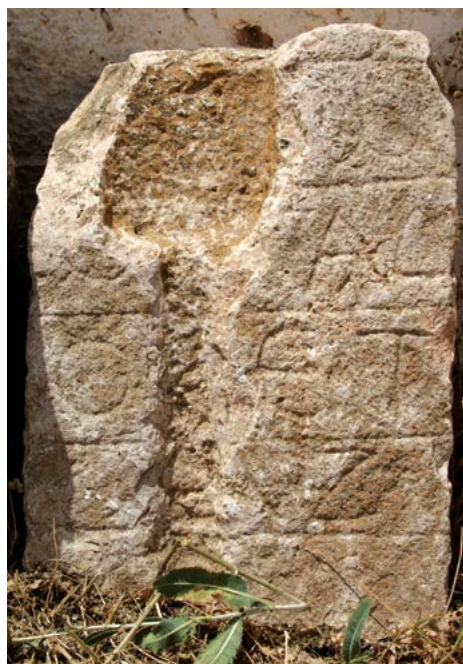
Figure 25: Tombstone of ...os son of Gados (20).