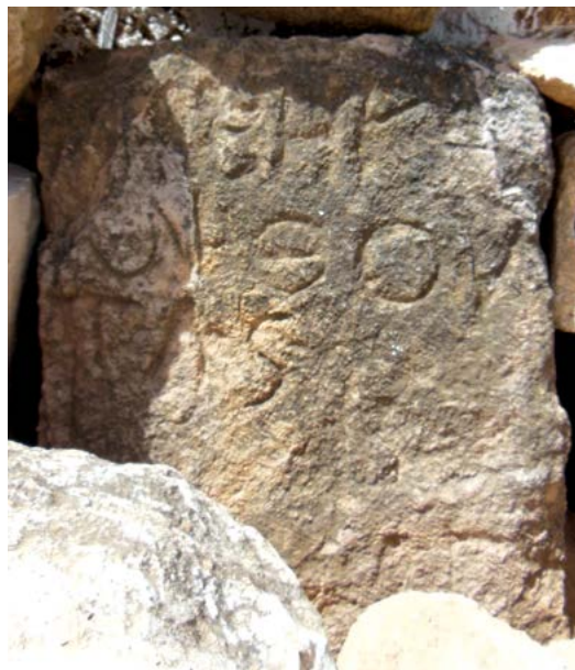
Figure 28: Tombstone of ...athe daughter of Kamithos (23).

Καμιθος: Hellenized Semitic name, rare, but known in this form for the father of a high priest of the Temple of Jerusalem under Tiberius. See Josephus, Antiquities 18.34 (Σίμωνι τῷ Καμίθου); Chronicon Paschale , p. 408, 14–5 (ὄντος ἀρχιερέως ἐν Ἱερουσαλήμ Σίμωνος τοῦ Καμαθεὶ υἱοῦ) and 417, 20 (Σίμωνα τὸν τοῦ Καμαθεὶ). Maybe derived from Aramaic qmḥ , qmḥ , 'flour'; cf. Yon 2018: 161, about the female names Καμαθ, Καμαθα and Καμαθη in Zeugma.