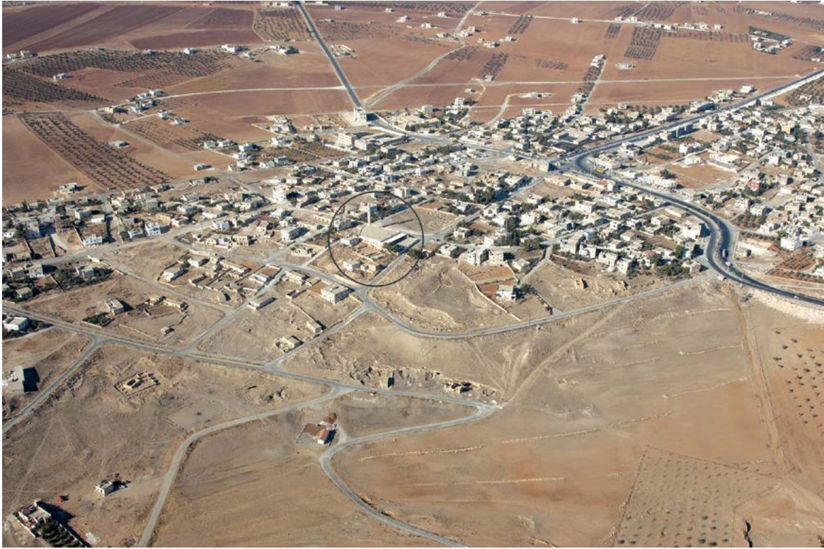
Figure 2: Aerial photograph showing the location of the ecclesiastical complex of St. John the Baptist in Rihāb.