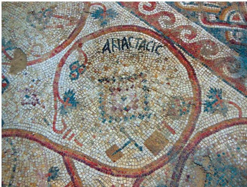
Figure 8: Mosaic medallion with the name of a donor (4).