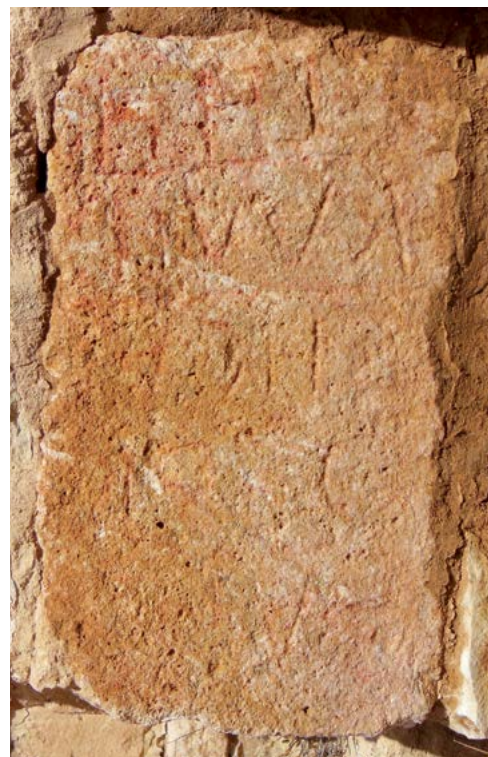
Figure 29: Tombstone of Obd... son of Valens (24).

The deceased probably had a Hellenized Semitic name derived from 'bd, "servant". The name of his father, Οὐάλης, is the Greek transcription of the Latin Valens . It was very popular in Roman Arabia, probably because of its similarity to Semitic names such as the Safaitic w'l . See Sartre 2007: 217–24 with Harding 1971: 645.