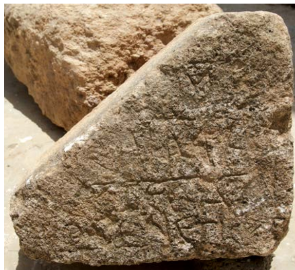
Figure 26: Tombstone of ... son/daughter of Thaimalas(?) (21).

Θαιμαλας/Θαιμαλλας: Hellenized Semitic name, common; cf. Sartre 1985: 204–5, Gatier 1998: 416 and I. Jordanie 5/1, nos. 94, 294, 312.