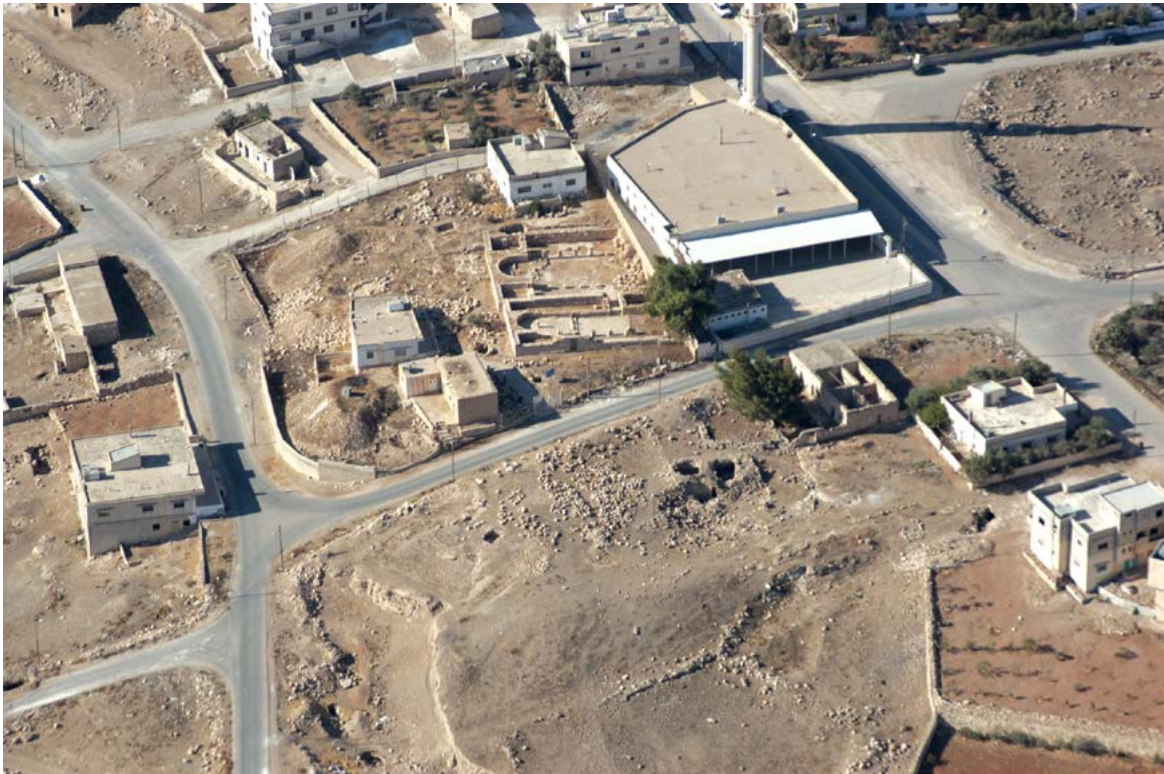
Figure 3: Aerial photograph of the church complex after the excavation.