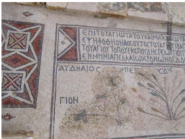
Figure 6: Mosaic pavement with the left side of the first dedication (1), month names (2) and river names (3).