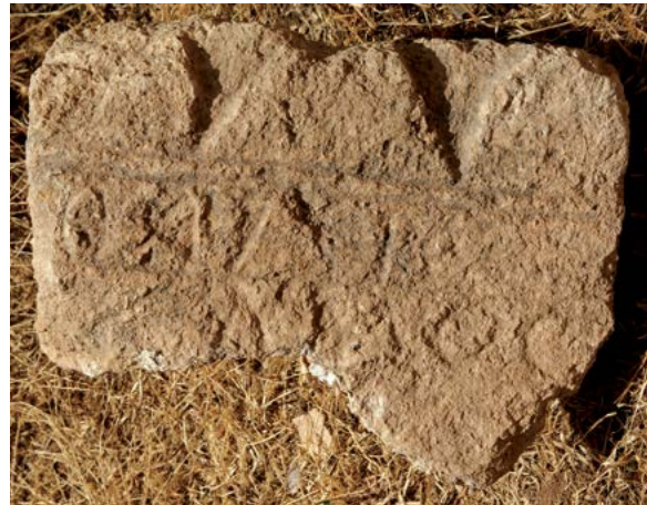
Figure 12: Tombstone of Amos (7).

Αμος: Hellenized Semitic name, common in Arabia; cf. , e.g., I. Jordanie 5/1, nos. 641, 650, 660 (Ṣabḥā, territory of Bostra), with Harding 1971: 434 s.v. ‘m, “entire”, “perfect”.