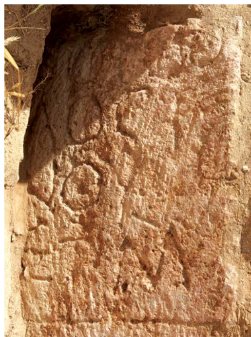
Figure 27: Tombstone of ...los son of Ianos (22).

Ιανος: Hellenized Semitic name, uncommon, but already recorded twice in Riḥāb; cf. Gatier 1998: 417.