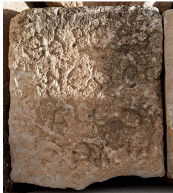
Figure 13: Tombstone of Anemos son of Ausos (8).

Ανεμος, Αυσος: two Hellenized Semitic names, both common in Arabia and already recorded in Rihāb; cf. , e.g., I. Jordanie 5/1, nos. 3, 196, 197, 198, 318, 359, 366, 380, 425, 479, 683, 697(?), 710 (Αναμος), 367 (Ανεμος), 152, 378, 432, 467, 522, 572, 661, 666 (Αυσος), with Gatier 1998: 415 (Rihāb) and Sartre 2007: 217–24 (on Αναμος/Ανεμος). For Αυσος, see also below, 19.