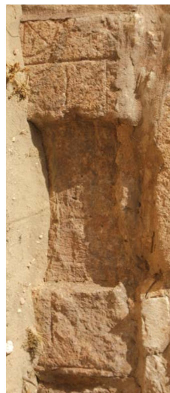
Figure 31: Tombstone with fragmentary epitaph (26).