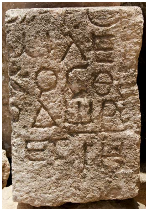
Figure 20: Tombstone of Mileichos son of Theodoros (15). © Julien Aliquot CNRS/HiSoMA 2016.

Although it looks like the Greek Μείλιχος , Μιλειχος is most probably a Hellenized Semitic name which is derived either from the root mlk , ‘to rule’, or from the Aramaic ml’k , ‘messenger’, ‘angel’. It is commonly found in Arabia and Palestine under various spellings ( Μειλιχος , Μιλιχος , Μιλχος ). See Meimaris and Kritikakou-Nikolaropoulou 2005: 193. The Greek name Θεόδωρος is common in the whole Near East.