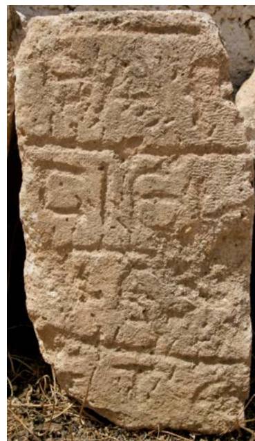
Figure 18: Tombstone of Hektor (13).

The heroic Greek name Ἐκτωρ is extremely rare in the Near East, but it has already been recorded twice in southern Syria, not far from Rihāb. See IGLS 14, no. 558 (Şanamayn); 15, no. 296 (Jrayn).