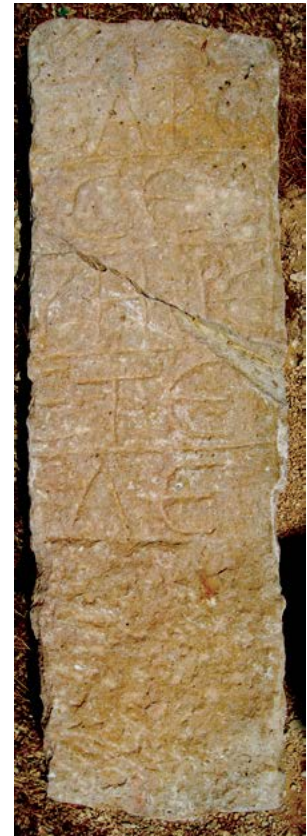
Figure 22: Tombstone of Severos (17).

Σεουῆρος: Latin Severus , which maybe owed its success in Roman Arabia to the reputation of the first governor of the province Claudius Severus, to the prestige of the Severan emperors or to the fact that it might transcribe phonetically close Semitic names. See, e.g., I. Jordanie 5/1, nos. 121, 243, 268, 328, 365, 441, 443, 472, 473, 474, 475, 476, 477, 478, 524, 728, with Sartre 1985: 237; below, 18.