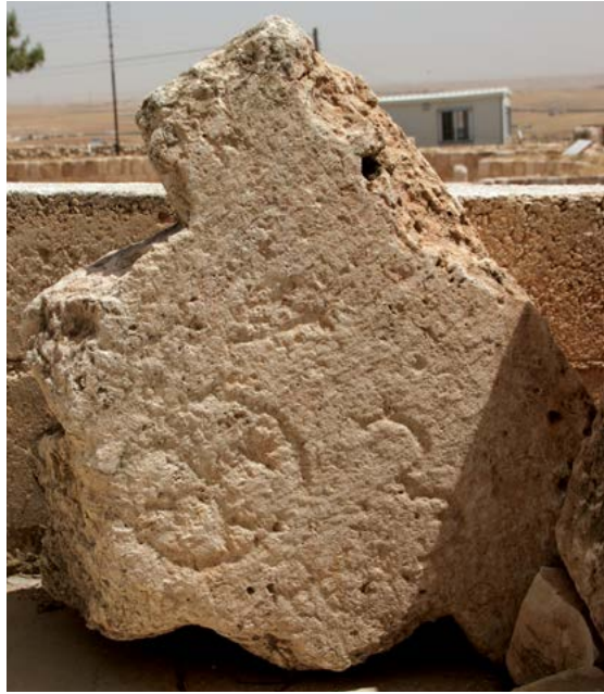
Figure 10: Block with a circled cross and Greek letters omega and alpha (5).