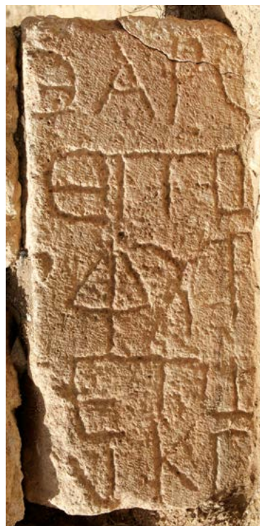
Figure 21: Tombstone of Porphyrios (16).

Πορφύριος : Greek name, commonly found in Byzantine Arabia and Palestine, but already recorded twice at Rihāb in its feminine form in Greek epitaphs from the Roman period. See Gatier 1998: 419, who reminds us that it can correspond to the translation of a Semitic name such as mlk , after the example of the philosopher Porphyrios/Malchos.