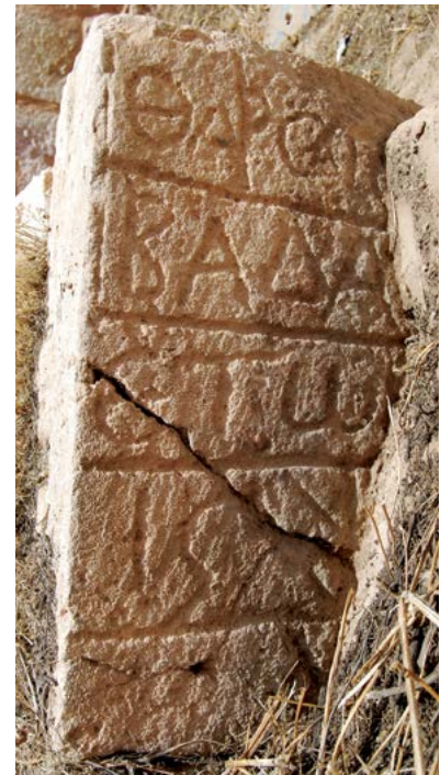
Figure 15: Tombstone of Badaros (10).

Βαδαρος: Hellenized Semitic name, very common in the northern part of Provincia Arabia; cf. Gatier 1998: 415.