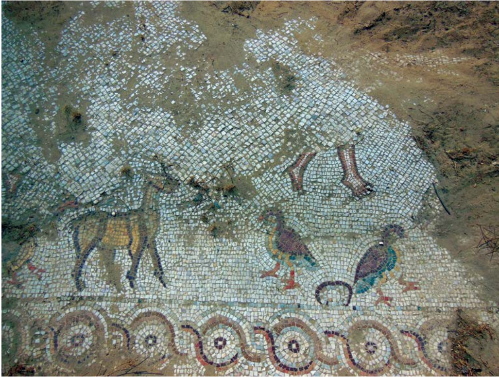
Figure 9: Animated images exceptionally spared by iconophobes in the northern aisle of the north church.

The presence of tools (double axes or hammers) inside the inscribed medallion may indicate that Anastasios was a craftsman ( cf. Piccirillo 1981: 83, plate 75, photos 39a–b, for similar images in the church of St. Mary at Riḥāb). The tools must have been associated with the representation of the donor himself. Unfortunately, all the images formerly related to the labels of the months, the rivers of Paradise, and Anastasios are lost. In all the mosaics of the church, the animated figures were almost systematically destroyed by iconophobes in the seventh or eighth century AD before being replaced by geometric, Nilotic and other plant motifs (Figure 9; for parallels, see Gatier 2012; Hachlili 2009: 209–17; Piccirillo 1998). At least it proves that Christian worship was still celebrated in this church in the Umayyad-Abbasid period.