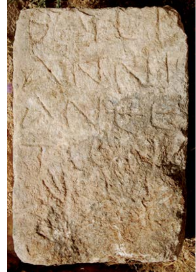
Figure 14: Tombstone of Annianos (9).

Ἄννιανός: Latin Annianus , common in Arabia; cf., e.g., I. Jordanie 5/1, nos. 2 and 26 (territory of Bostra).