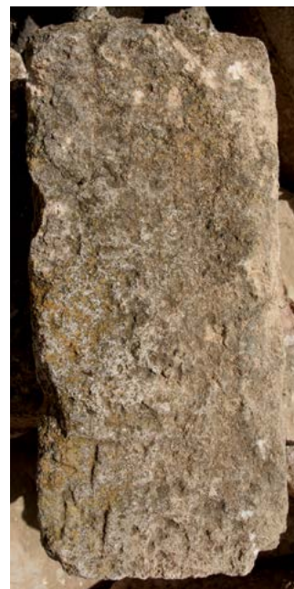
Figure 34: Tombstone with fragmentary epitaph (29).

30. Greek epitaph or dedication? Limestone block, broken on all sides, with a few letters visible to the left of the image of a horned altar. H. 48 × W. 57 × D. 20 cm. H. of the letters: 8 cm (Figure 35).