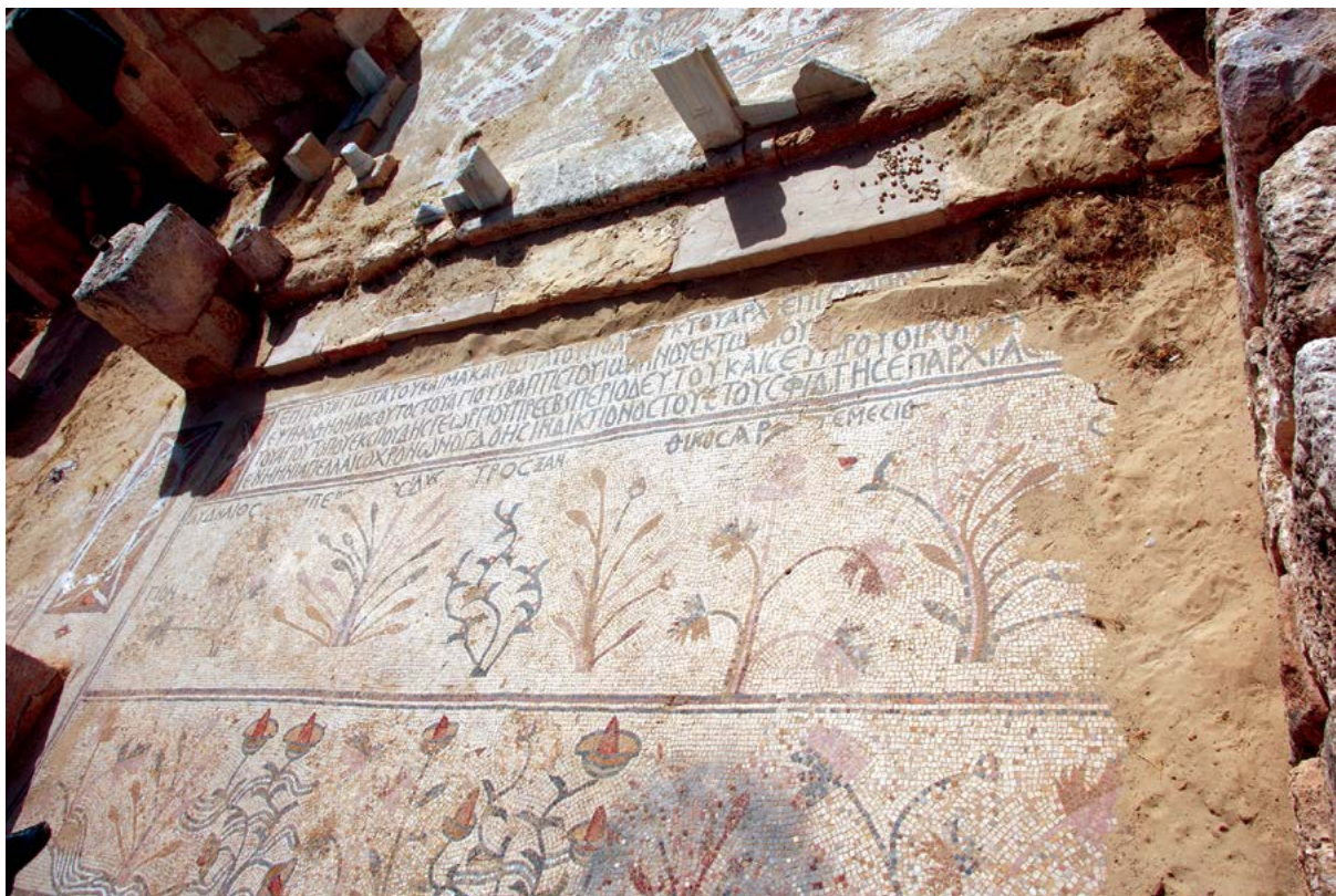
Figure 5: Mosaic pavement with the first dedication (1), month names (2) and river names (3).