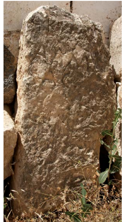
Figure 33: Tombstone with fragmentary epitaph (28).

Line 2–4. Maybe [Π]άλμας, Latin Palma , already recorded in Rihāb; Gatier 1998: 419.