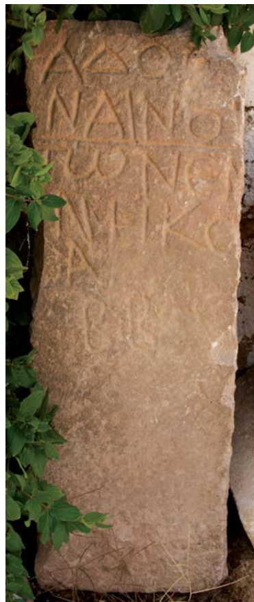
Figure 16: Tombstone of Gados son of Onainos (11).

Γαδος, Οναινος: two Hellenized Semitic names, both common in Arabia. Only the first one was already recorded in Rihāb; cf. I. Jordanie 5/1, no. 700 (Γαδδος in Umm al-Quttayn), Gatier 1998: 416 (Rihāb) and below, 20 . For the second, see, e.g., I. Jordanie 5/1, nos. 13 (female Οναινα), 413, 454 (Ονενος), 610 (Ονηνος), with Sartre 1985: 222 and Yon 2018: 53.