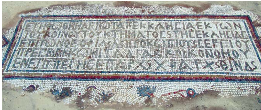
Figure 11: Greek dedication (6) on the mosaic pavement in the south church.

Ἐψηφώθη ἡ ἀγιωτάτ(η) ἐκκλησία ἐκ τῶν τοῦ κοινοῦ τοῦ κτήματος (καὶ) τῆς ἐκκλησίας, ἐπὶ τῶν θεοφιλλ(εστάτων) Προκωπίου (καὶ) Σεργίου 4 πρεσββ(υτέρων) κ(αὶ) Κωμιτᾶ διακ(όνου) κ(αὶ) οἰκονόμου, ἐν ἔτι υπε΄ τῆς ἐπαρχ(ίας), χρό(νων) ἀρχ(ῆς) θ΄ ἰνδ(ικτιῶνος).