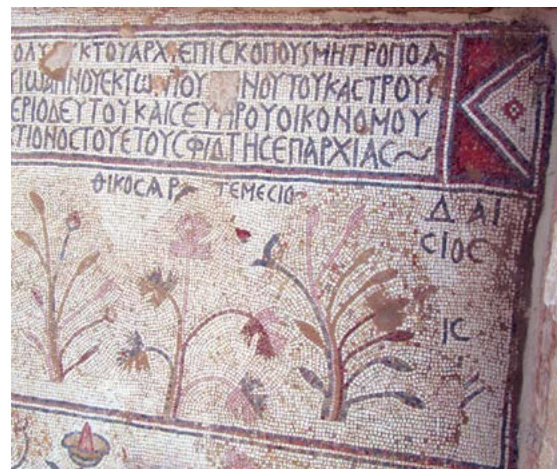
Figure 7: Mosaic pavement with the right side of the first dedication (1), month names (2) and river names (3).