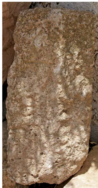
Figure 30: Tombstone of B... (25).

Translation: “Be courageous, B..., 9 years old.”