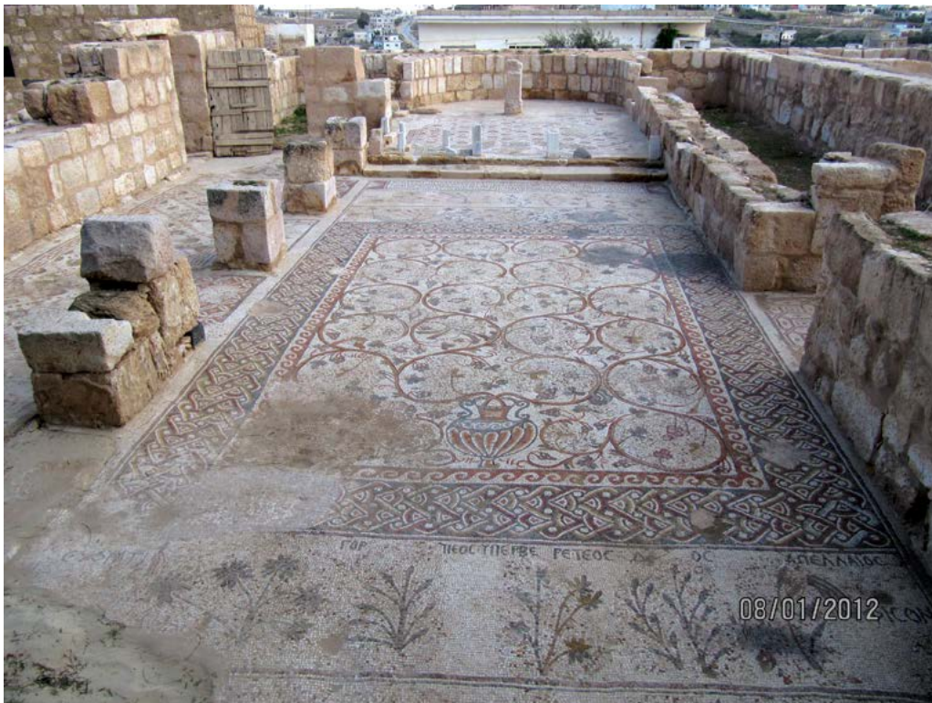
Figure 4: Mosaic pavement in the nave of the north church of St. John the Baptist.

The dedication was still poorly established in previous editions, especially on its right half. Although correct for the date, Piccirillo’s translation remains flawed. Line 1. [ἀρχιεπισκ(όπου)] ( SEG ). Line 2. At the beginning, ἐψηφώθη ( SEG ). In the end, ἐκ [τῶν προσόδων?] ( SEG ); “this temple of Saint John the Baptist of Neon Kastron [?]” (Piccirillo). Line 3. After περιοδευτοῦ: [---] ( SEG ). Line 4. τ[οῦ . . . ἔτους] ( SEG ). Note the spelling of ἐψηφώθη for ἐψηφώθη and ἰνδικτιῶνος for ἰνδικτιῶνος.