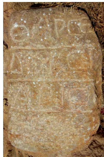
Figure 17: Tombstone of Dousarios (12).

The pagan theophoric name Δουσαριος, derived from the name of the great Nabataean god Dushara ( dwsr '), was very popular in Roman Arabia. See, e.g., Sartre 1985: 198–9 and Gatier 1998: 416 (Δουσαρις in Rihāb).