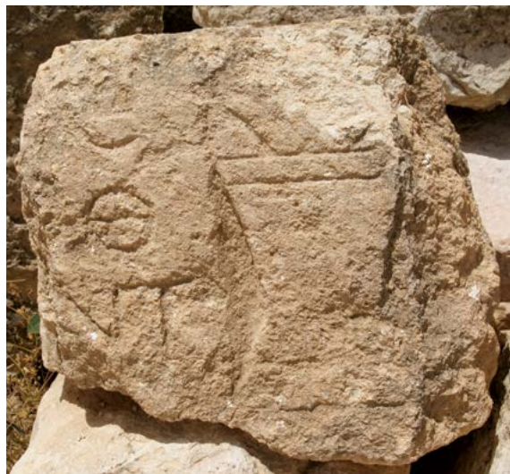
Figure 35: Block with fragmentary inscription (30).

According to its shape and decoration, the block does not belong to the series of funerary stelae. The inscription may be a fragmentary dedication.