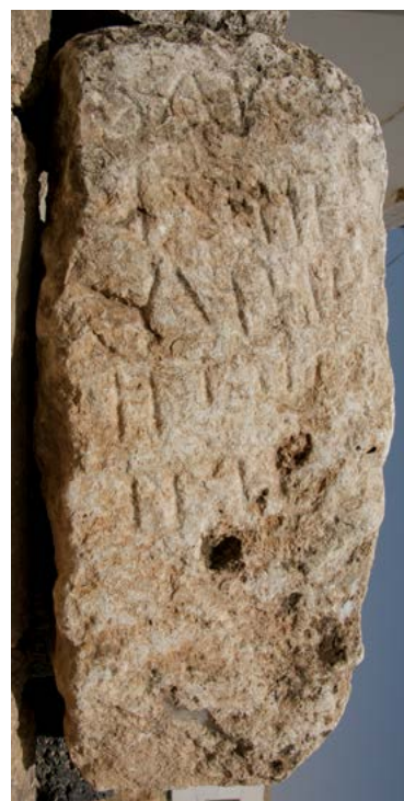
Figure 19: Tombstone of Ianouarios (14).

Ἴανουάριος; Latin Januarius . See Gatier 1998: 417.