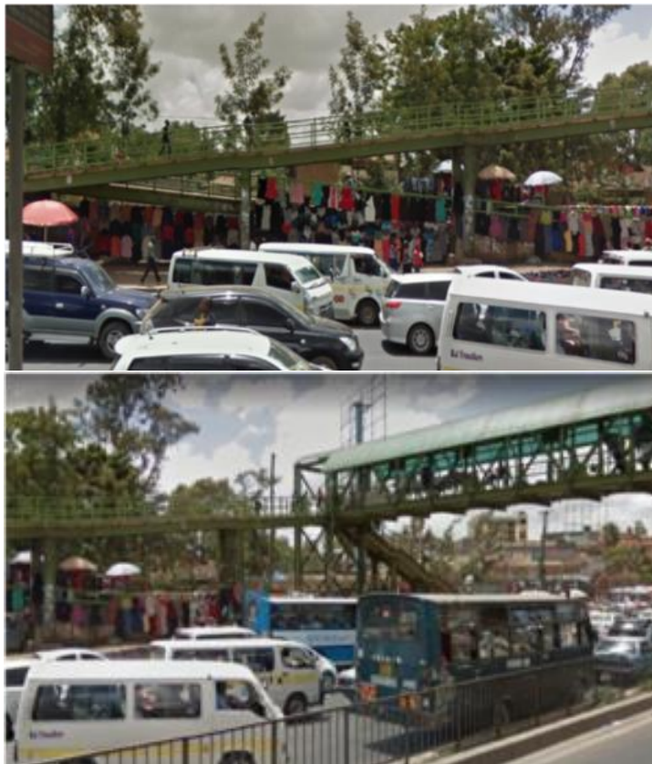
Illustration 3: Encroached bridge at rush hour (represented by a green color on the map, illustration 1) @ Google Maps 20/02/2018.

This bridge is a power configuration between city authorities and street-vendors. It materializes a symbiotic power relation. As the state attempts to control human flows in Ngara, street-vending techniques evolve and change shape to capture fluxes growing through these new state-imposed paths (i.e. the bridge). Space is indeed not a mere background witnessing human encroachment, as Bayat's theory suggests. As it creates geographical constraints (relief, location, etc.) on social agents, space is also a matrix within which power relationships operate. The state imposes paths and ways for human fluxes in addition to a set of rules on how to properly use space, while the street-traders develop their own (collective) spatial strategies in order to survive. The subversive dimension of the quiet encroachment lies in the sellers' capacity to change the symbolic sense inscribed in the bridge and its supposed use and utility (Hmed 2008). From a mere high pathway, the Ngara bridge is becoming a crowded air market and an unsecure crosswalk at night.