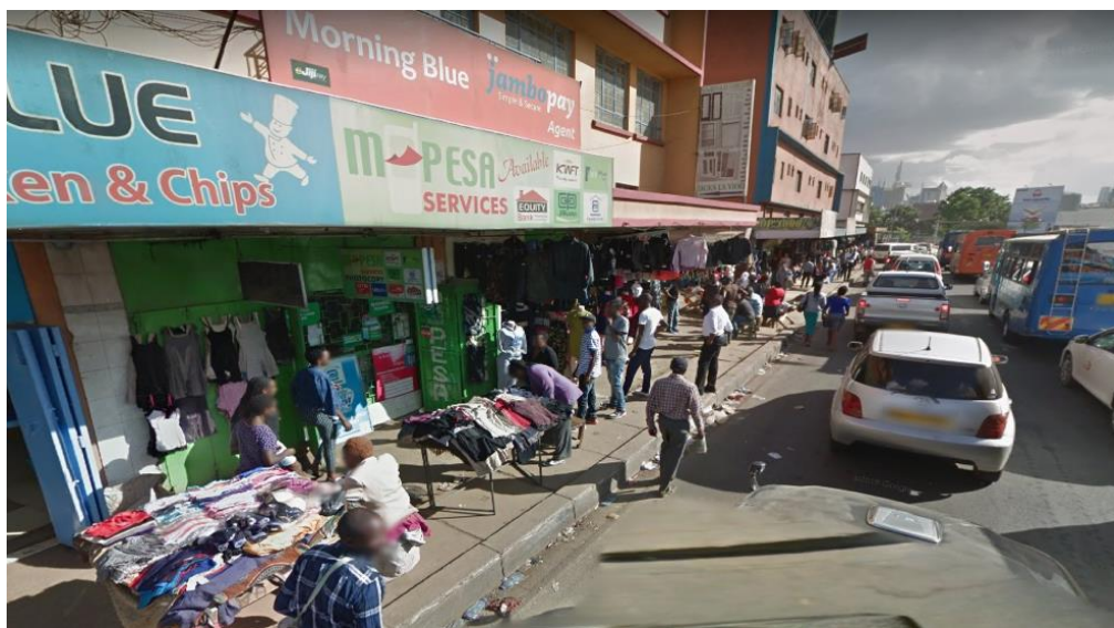
Illustration 1: An informal market on Ngara Main Road, with Nairobi CBD in the background. 20/02/2018.

dynamic area. Street-vendors – as mobile informal businessmen and women – are key actors in such practices. Since current projects are threatening informal markets area, I also anticipated that street-vendors would have a strong opinion and would likely share it and discuss with me. Moreover, their perceptions and feelings appear as a prism to capture citizens' support of and contest over state-led urban projects, and furthermore to understand citizens' relations to the state itself. Also, underpinned by direct interviews and observations and the study of one particular case, this paper sheds light on the Kenyan state's technique of city planning: forced evictions, violence, nepotism, etc. It will allow us to address Kenya's "authoritarian" rule at work, that is, in its local and daily making.