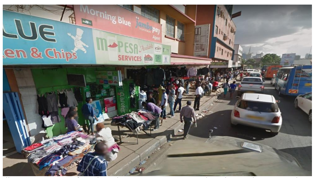
Illustration 1: An informal market on Ngara Main Road, with Nairobi CBD in the background. @Google Maps, 20/02/2018.

dynamic area. Street-vendors – as mobile informal businessmen and women – are key actors in such practices. Since current projects are threatening informal markets area, I also anticipated that street-vendors would have a strong opinion and would likely share it and discuss with me. Moreover, their perceptions and feelings appear as a prism to capture citizens' support of and contest over state-led urban projects, and furthermore to understand citizens' relations to the state itself. Also, underpinned by direct interviews and observations and the study of one particular case, this paper sheds light on the Kenyan state's technique of city planning: forced evictions, violence, nepotism, etc. It will allow us to address Kenya's "authoritarian" rule at work, that is, in its local and daily making.