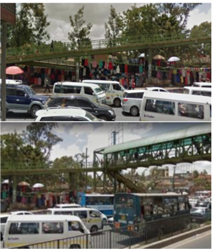
Illustration 3: Encroached bridge at rush hour (represented by a green color on the map, illustration 1) @ Google Maps 20/02/2018.

This bridge is a power configuration between city authorities and street-vendors. It materializes a symbiotic power relation. As the state attempts to control human flows in Ngara, street-vending techniques evolve and change shape to capture fluxes growing through these new state-imposed paths (i.e. the bridge). Space is indeed not a mere background witnessing human encroachment, as Bayat's theory suggests. As it creates geographical constraints (relief, location, etc.) on social agents, space is also a matrix within which power relationships operate. The state imposes paths and ways for human fluxes in addition to a set of rules on how to properly use space, while the street-traders develop their own (collective) spatial strategies in order to survive. The subversive dimension of the quiet encroachment lies in the sellers' capacity to change the symbolic sense inscribed in the bridge and its supposed use and utility (Hmed 2008). From a mere high pathway, the Ngara bridge is becoming a crowded air market and an unsecure crosswalk at night.