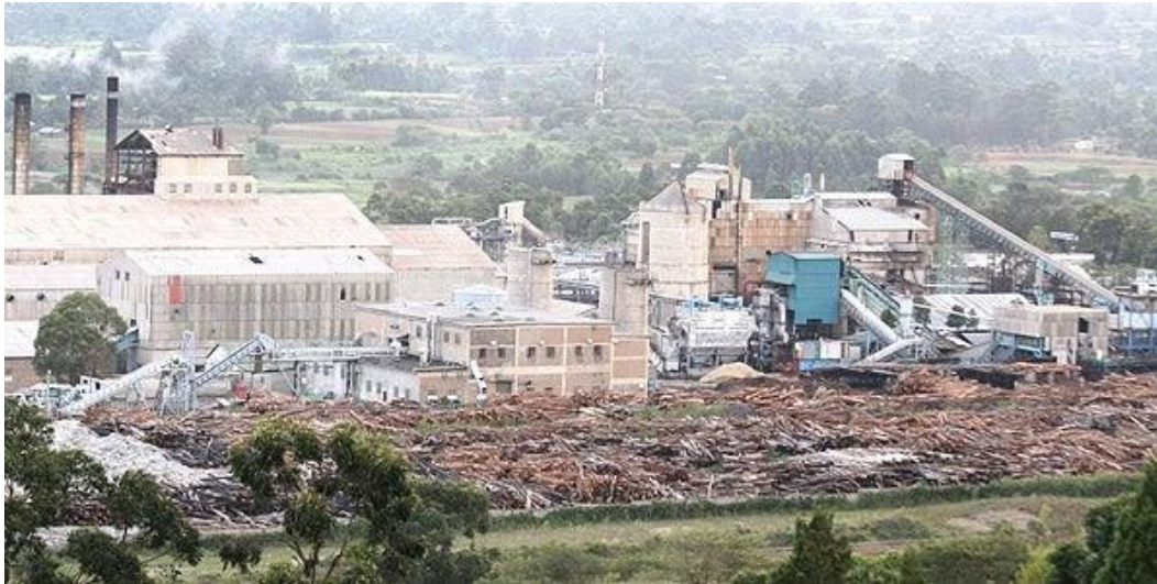
Figure 3: Photograph of Pan African Paper Mills that collapsed in 2009.

hope that either the national government or the county government of Bungoma would bring the company back to life. Over 3,000 people lost their jobs, shopping centres that were beaming with life closed down, families broke, education was affected and the town curled its tail like an elephant, full of potential but slowly rotting from within. 21