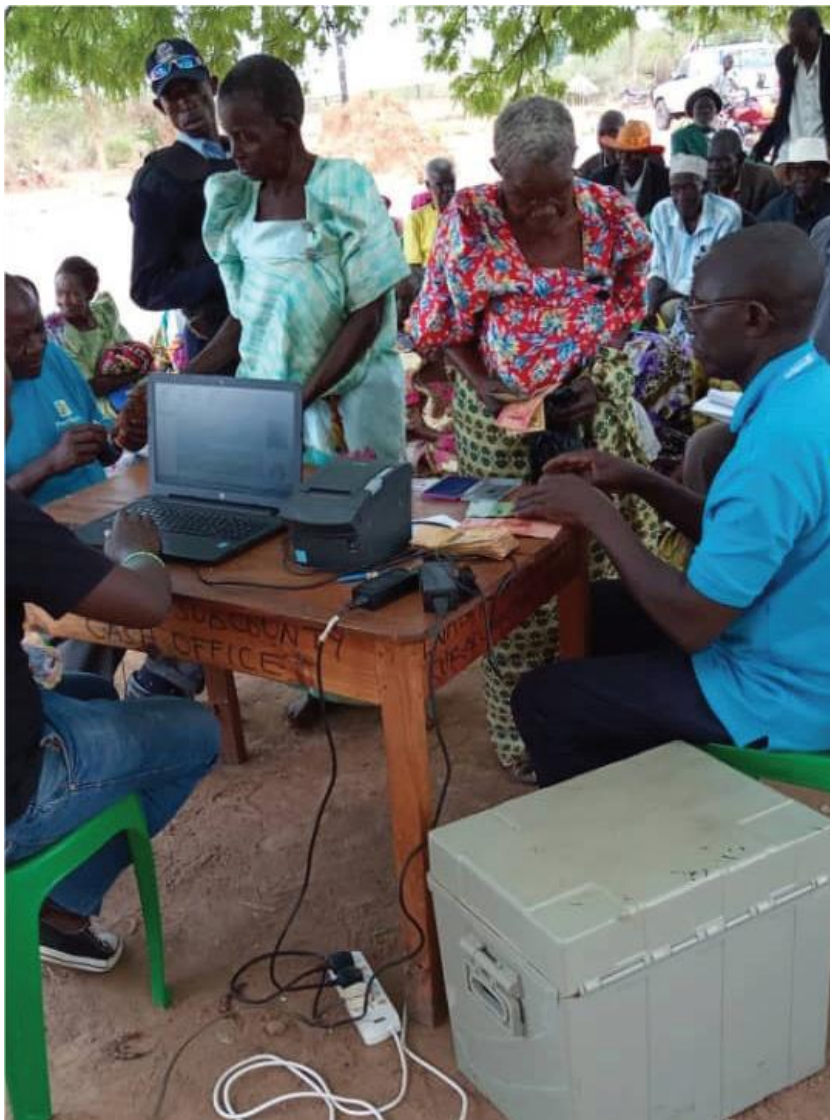
Picture 1: Beneficiaries receiving their money at the payment desk. Photo: Ronan Jacquin (March 2019).

on an individual basis to figure out “how they have gained out of this programme” 10 . For instance, they will visit beneficiaries at their home if they suspect that the money is used in ways they consider inadequate. Another example is about “prepayment addresses”. Before payment sessions, beneficiaries are gathered and SAGE agents tell them about the good and bad ways to spend the grant, in order to “educate” them and give them what they call “financial literacy”: “What we do in the prepayment address is to try to guide you that when you get your money, try to use it in a way that benefit yourself, don’t waste it, because you’re vulnerable” 11 .