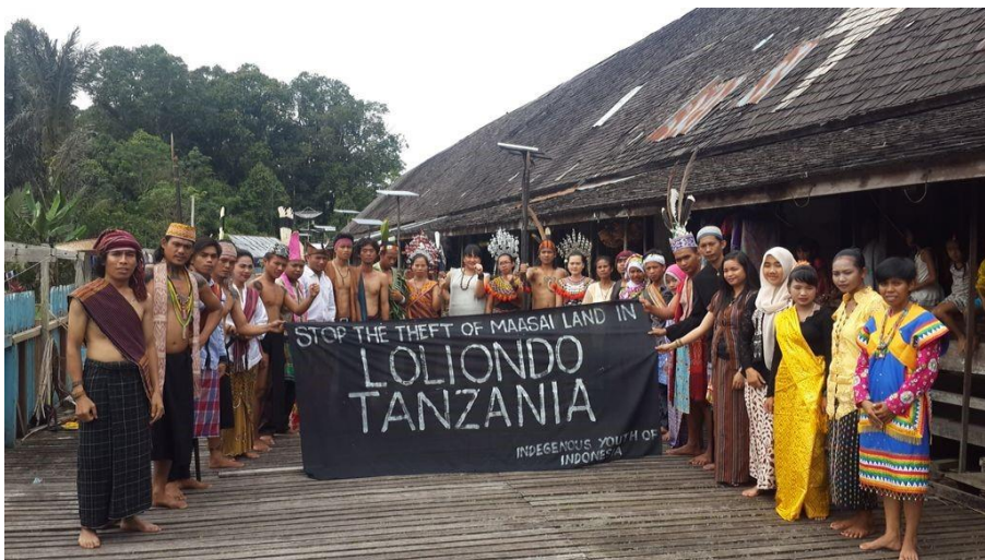
Indigenous youth of Indonesia show their support to the Maasai of Loliondo. 9