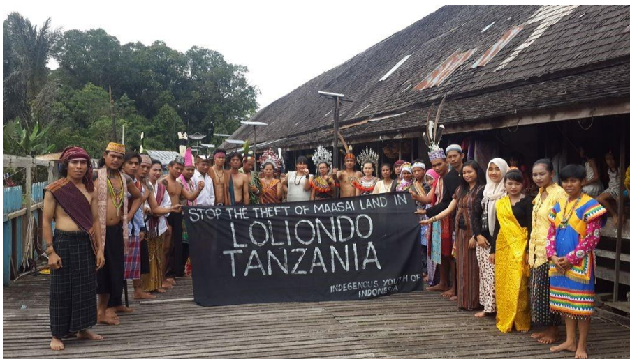
Indigenous youth of Indonesia show their support to the Maasai of Loliondo. 9