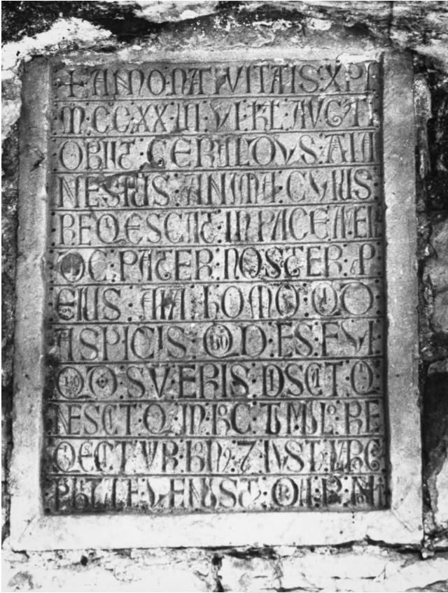
Figure 14.3 Funerary inscription for Géraud of Aniane, 1223, Boussagues church, La-Tour-sur-Orb, department of Hérault.

the construction qui in line 6 of Peter's epitaph. La Tour-sur-Orb is 40 km from Campagnolles. The succession of the 3 letters QIO in Peter's inscription should not be read as q(u) i o(die) , as P.-V. Claverie proposed, but as q(u) id , the neuter form of the interrogative pronoun quis , with a D uncial, very rounded, as found in the inscriptions from La Tour-sur-Orb, and very close in appearance to the letter O due to his form if we do not see the tiny left stroke. Given the irregular letterforms made by the engraver, the proper reading is doubtless q(u) id which is besides very common in this rhetorical formula, while hodie is never found.