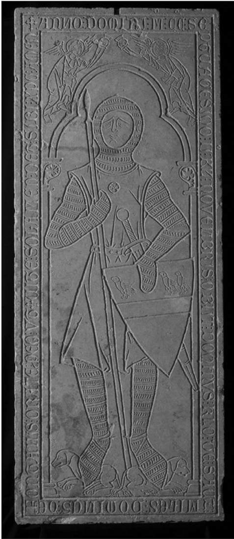
Figure 14.2 Tomb for Calon of Saul, 1270, Archaeological Museum of Dijon, department of Côte-d’Or, Burgundy.

in the southwest, the first examples appeared in the second half of the thirteenth century (in 1263 and 1287) and that it is only from 1290 that a series of tomb slabs appeared in the Occitan capital of Toulouse and its region. 49 It is not the purpose of this article to explain all the reasons of this almost absence, but would be an interesting avenue for future research. 50