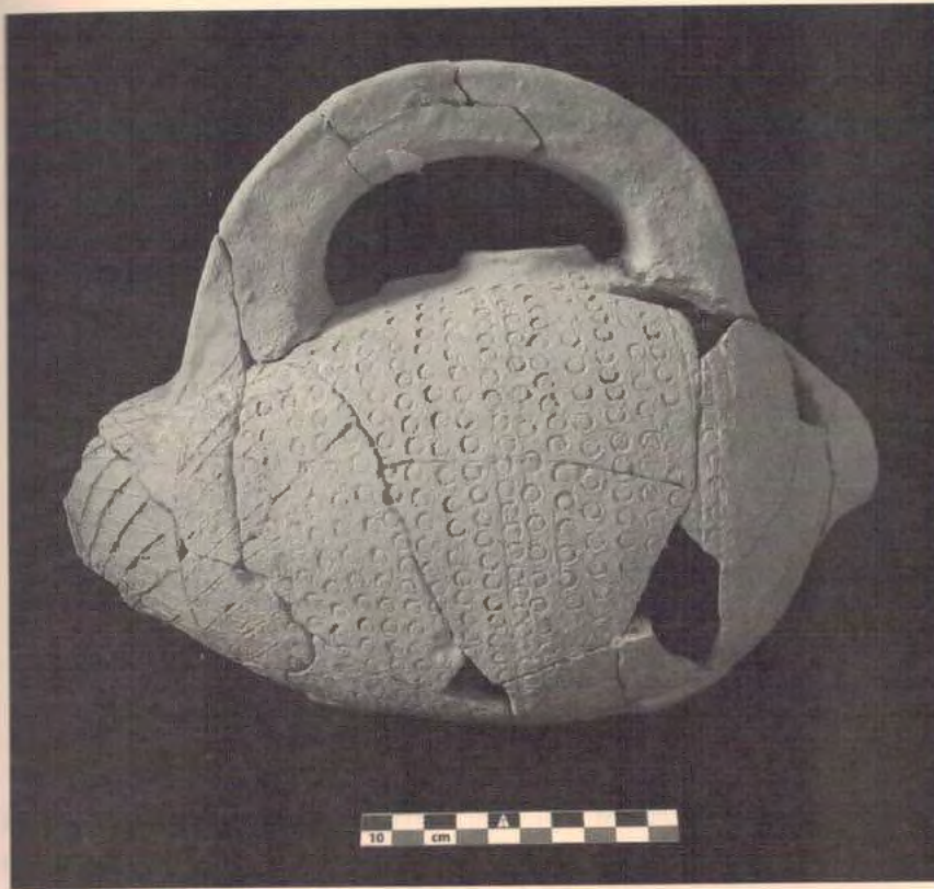
Fig. 08: Zoomorphic vessel in the shape of stylized fish(Florine Marchand, Mission archéologique française du Peramagron).