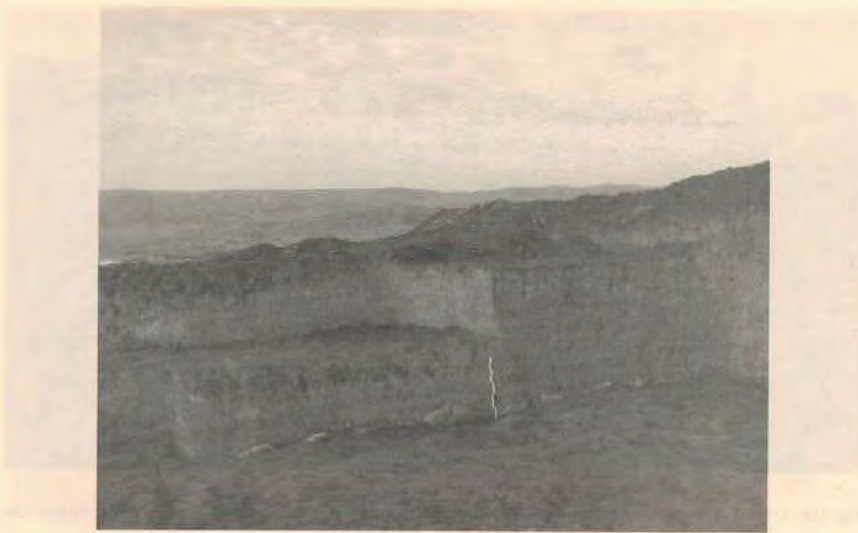
Fig. 06: Earthen superstructure with visible layers in wall 114, Area B, (Aline Tenu, Mission archéologique française du Peramagron)