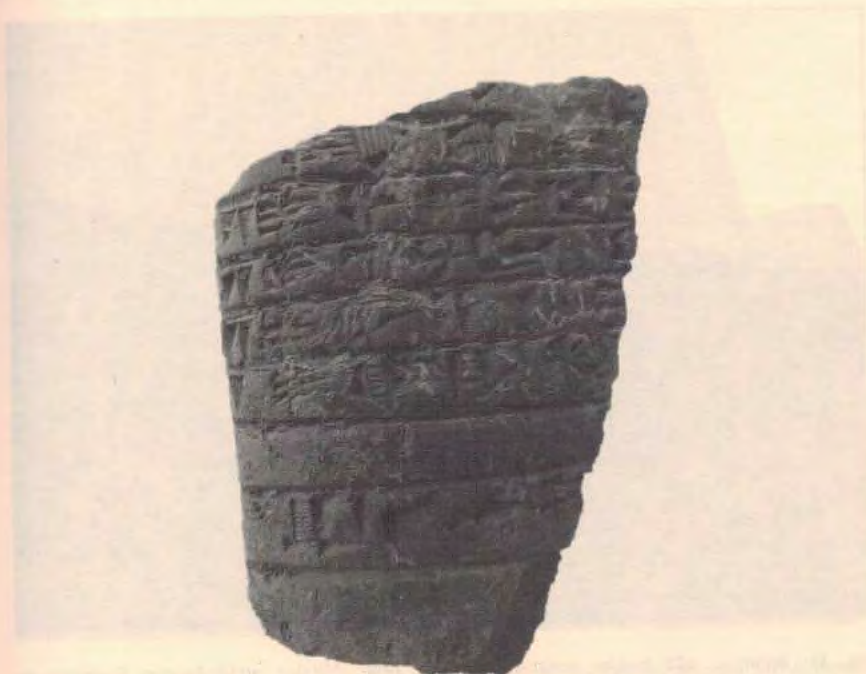
Fig. 10: Reverse of the tablet M. 632, Area E (Aline Tenu, Mission archéologique française du Peramagron)