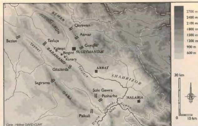
Fig. 01: Map of the area around Kunara (H. David-Cuny, Mission archéologique française du Peramagron)