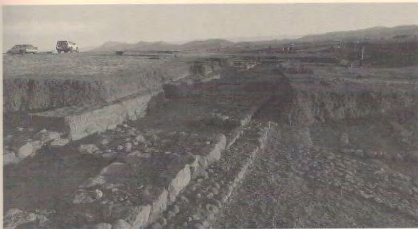
Fig. 04: Area B, the main building B. 712 and the passageways