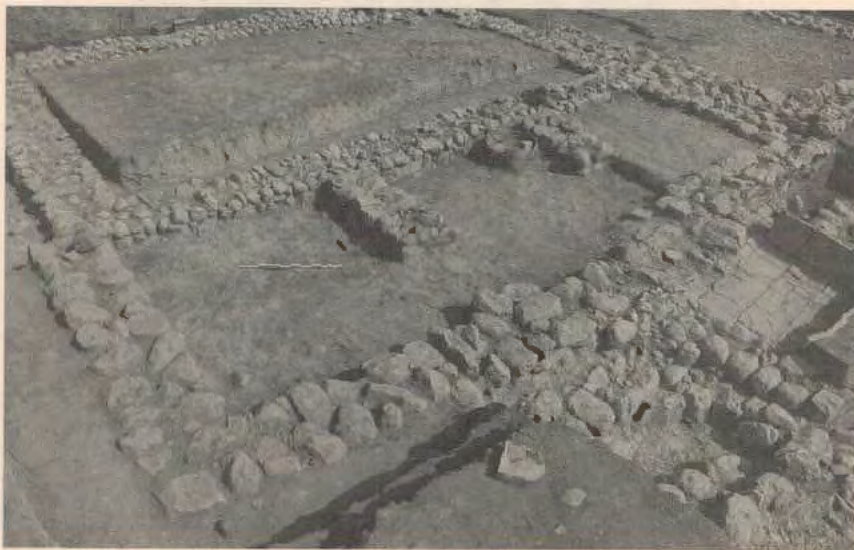
Fig. 07: Building B. 517, area C (Barbara Chiti, Mission archéologique française du Peramagron)