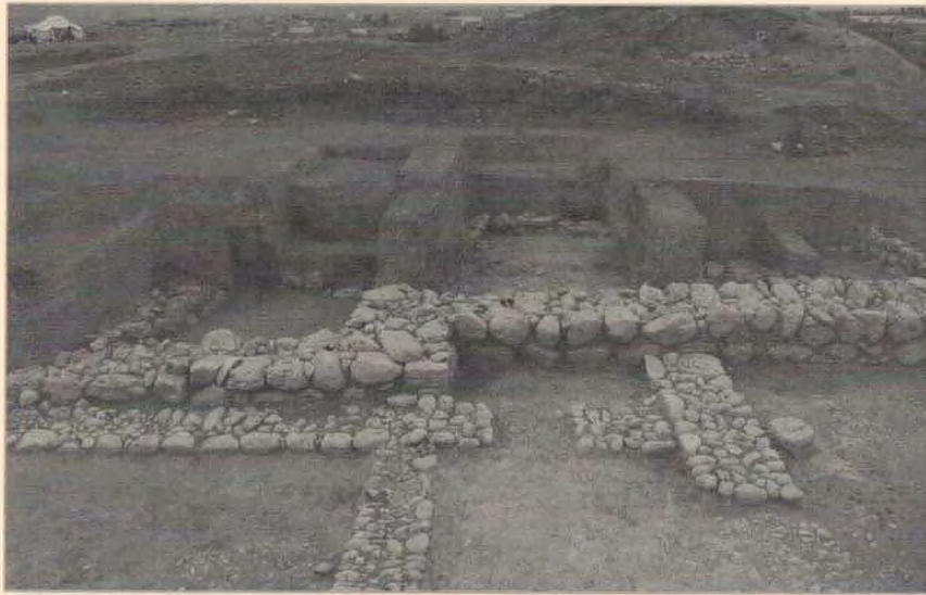
Fig. 09: The three rooms of building B. 659 looking west, Area E