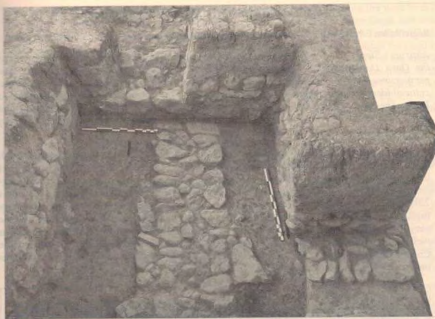
Fig. 12: Stone structures of phase 4, Area C.