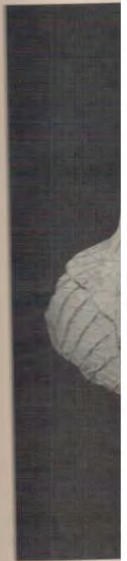
Fig. 08: Zoomorpi française du Perar