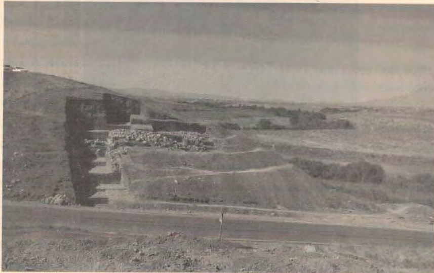
Fig. 03: General of view of Area A looking west in 2013