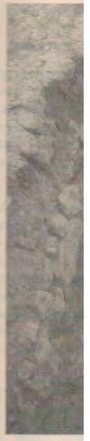
Fig. 12: Stone wall of Room L. 692