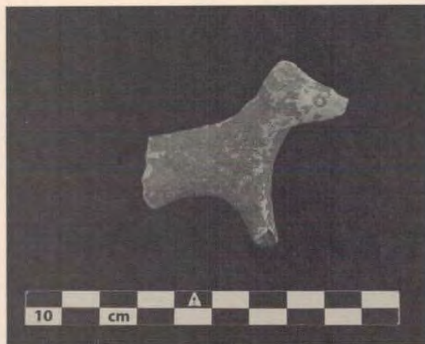
Fig. 05: Animal figure M. 163 (Laetitia Munduteguy, Mission archéologique française du Peramagron)