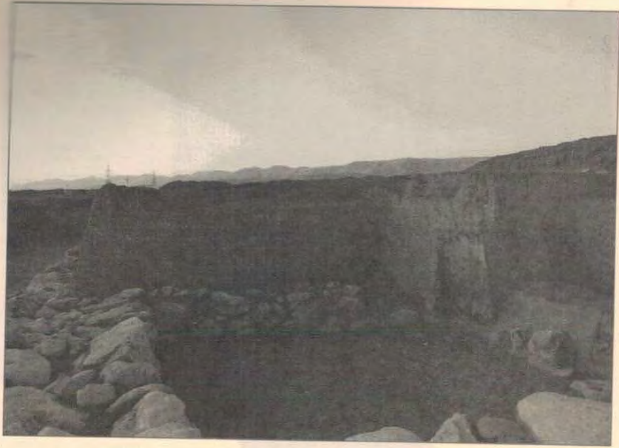
Fig. 11: Room L. 692 looking south-west