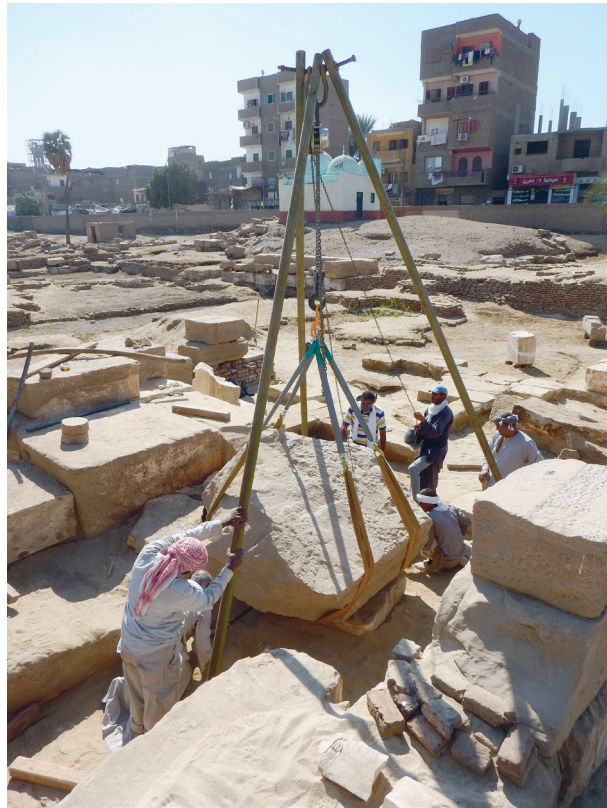
4. Movement of blocks in the central area of the temple.