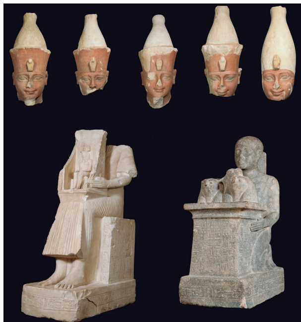
5. Royal and private statues after restoration.