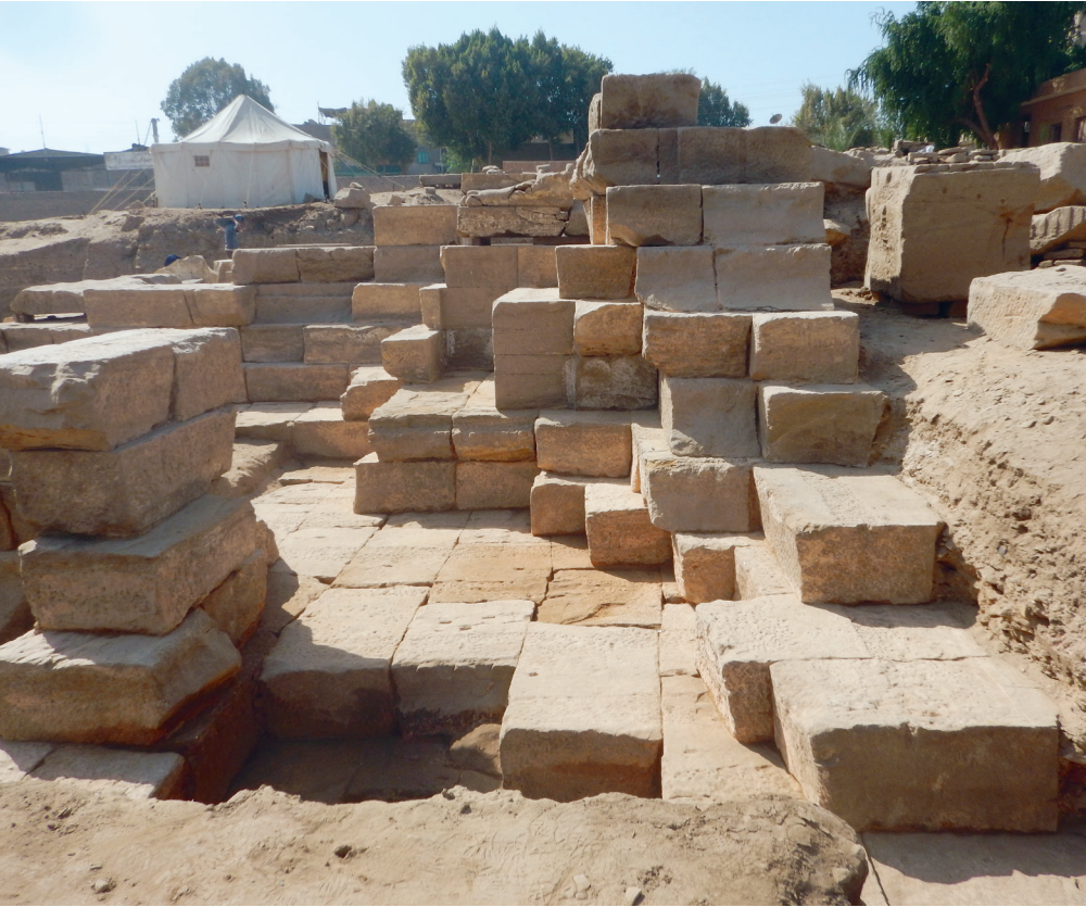
3. Foundation layers of the Ptolemaic naos, at the back of the temple.

structure's stonework from the 5th century. Work there was conducted intermittently by the Supreme Council of Antiquities (SCA) in the 1980s and 1990s, exposing in particular a set of crypts. In 2003 and 2004, under the auspices of the IFAO, the two short seasons led by Christophe Thiers and Youri Volokhine enabled the texts of these crypts, which date to Ptolemy XII Neos Dionysos (80-51 BC), to be copied and published. It was only after 2004-2005 that work was undertaken to attempt to understand the scattered remains in the city in their entirety and to propose an architectural, topographic and epigraphic analysis of the ruins of the main temple of the god Montu. At the same time an inventory of blocks scattered over the site and a programme of restoration and conservation was initiated.