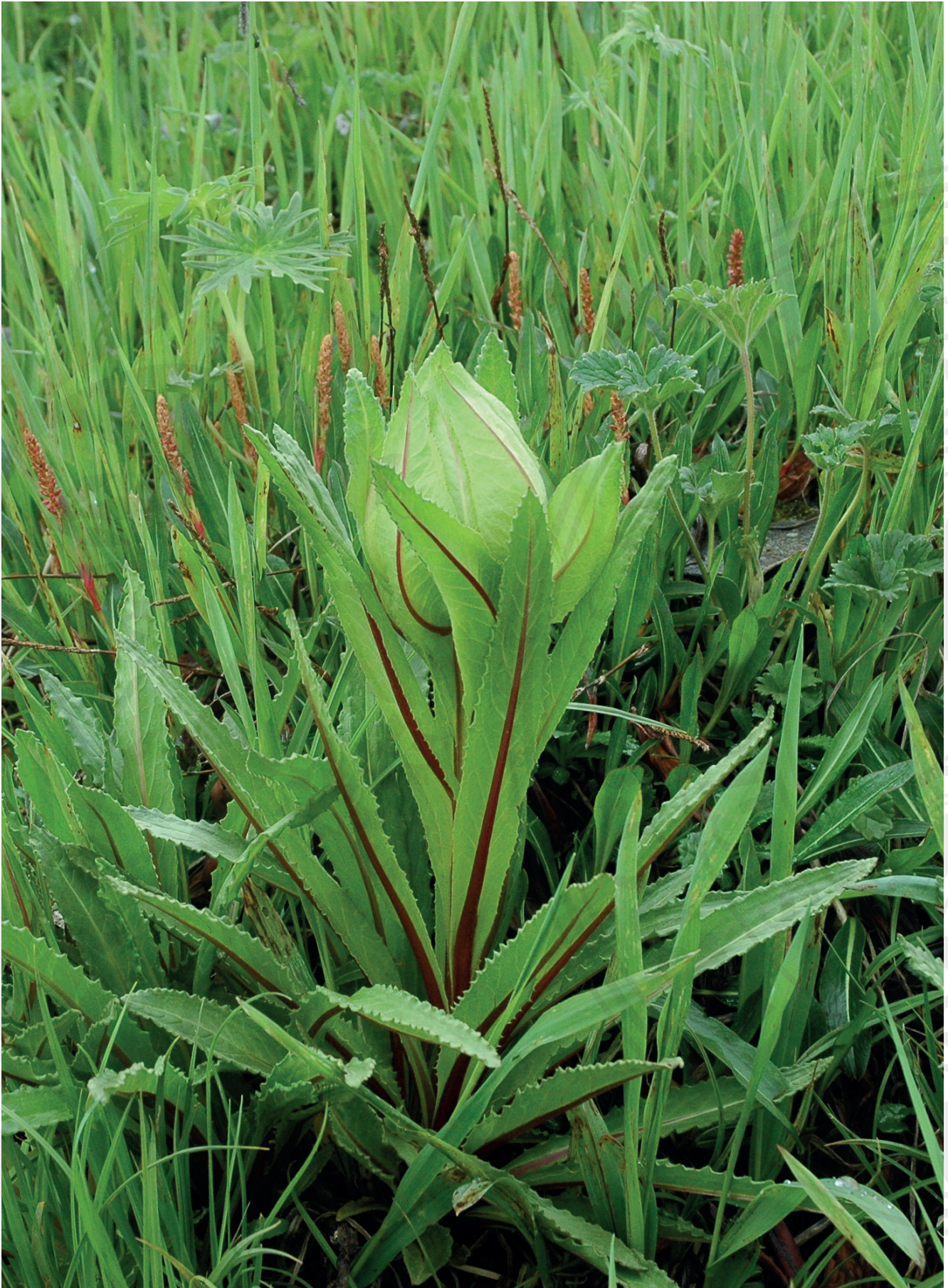
The prominent bracts of Saussurea obvallata protect its inflorescences which attract insects by their strong citrus-like scent. S. obvallata has culinary and medicinal uses, but it is best known for its religious significance; it is said to be the lotus which is always depicted with the Hindu god Brahma. Api Himal, 4,200 m, 29°57'N/80°57'E, July 2012. (CP)