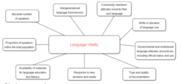
Click to view larger

A widely used and highly regarded method for gauging the status and prospects of a language is the UNESCO Language Vitality Assessment (Figure 1; Brenzinger et al., 2003). This tool advances a holistic approach for measuring linguistic vitality that draws on multiple elements, since "no single factor alone can be used to assess a language's vitality or its need for documentation" (Brenzinger et al., 2003, p. 7).