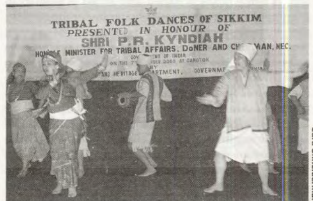
Thami Welfare Association members perform for the Union Minister of Tribal Affairs in Gangtok

At around the same time, thanks largely to pressure from the Mandal Commission, the Indian government set about revamping the country’s stagnant reservation policy. Released in 1980, B P Mandal’s report revitalised the practice of setting aside a certain percentage of government jobs and seats in public