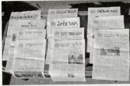
Issues of the Sikkim Herald in 11 different languages - and scripts!

Still, for a sizeable number of people the benefits of the reservation system remain conceptual, since regardless of whether their ethnicity is currently classified as OBC, ST or MPT, each