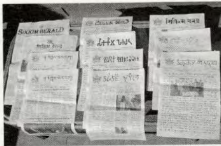
Issues of the Sikkim Herald in 11 different languages - and scripts!

Still, for a sizeable number of people the benefits of the reservation system remain conceptual, since regardless of whether their ethnicity is currently classified as OBC, ST or MPT, each