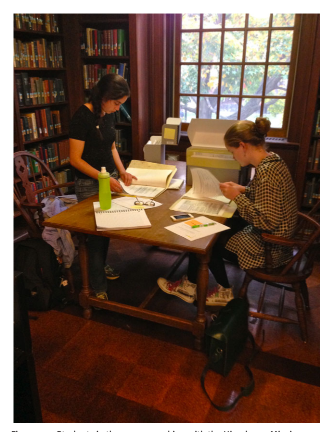
Figure 3. Students in the course working with the Himalayan Mission Archive Collection at the Yale Divinity School, 2013.

We had designed the class in an experimental and modular way, moving between five locations during the 13-week semester. It was logistically far easier to bring the class to the collections than the collections to our class. We were eager to expose students to the rare pleasure of working with, handling, examining, and exploring primary materials during their undergraduate careers (Figure 3). We wanted to encourage and build the critical faculties that would help students evaluate different sources of information, weigh their value and legitimacy, and be mindful of the enduring residue of their coursework in the archive. In their introduction to Sensible Objects , Elizabeth