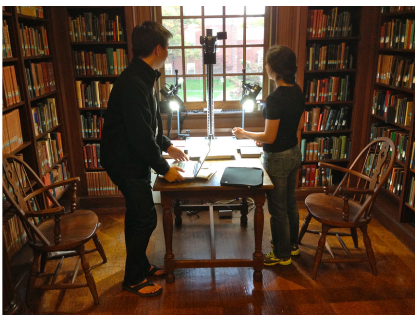
Figure 4. Students digitizing correspondence from the Himalayan Mission Archive Collection at the Yale Divinity School, 2013.

Overall, though, most of the students did seem to appreciate the challenge and the intent through which it was delivered. "For me, it was less about actually learning about the Himalayas and more so about puzzling over the archives, trying to engage with the stories that they had to offer" wrote one, while another stated: "loved the emphasis on digital humanities and thinking critically about archival work, and the fact that we were able to make a real contribution to the archival work happening at Yale." The concluding comments in two