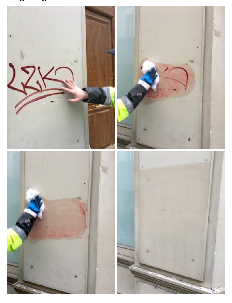
Figure 2. Making the graffiti react with chemical solvents

The use of chemical solvents goes hand in hand with a green scraper (a kind of dish scouring sponge) and several clean rags (figure 2). The buffers pour a small quantity of aqueous product on the scraper, coat the graffitied surface with it in small circles, and leave it to act for a short time over the inscription. They carry on their circular movements without pressing on the scraper until the letters are distorted by the ink or paint that gets liquefied.