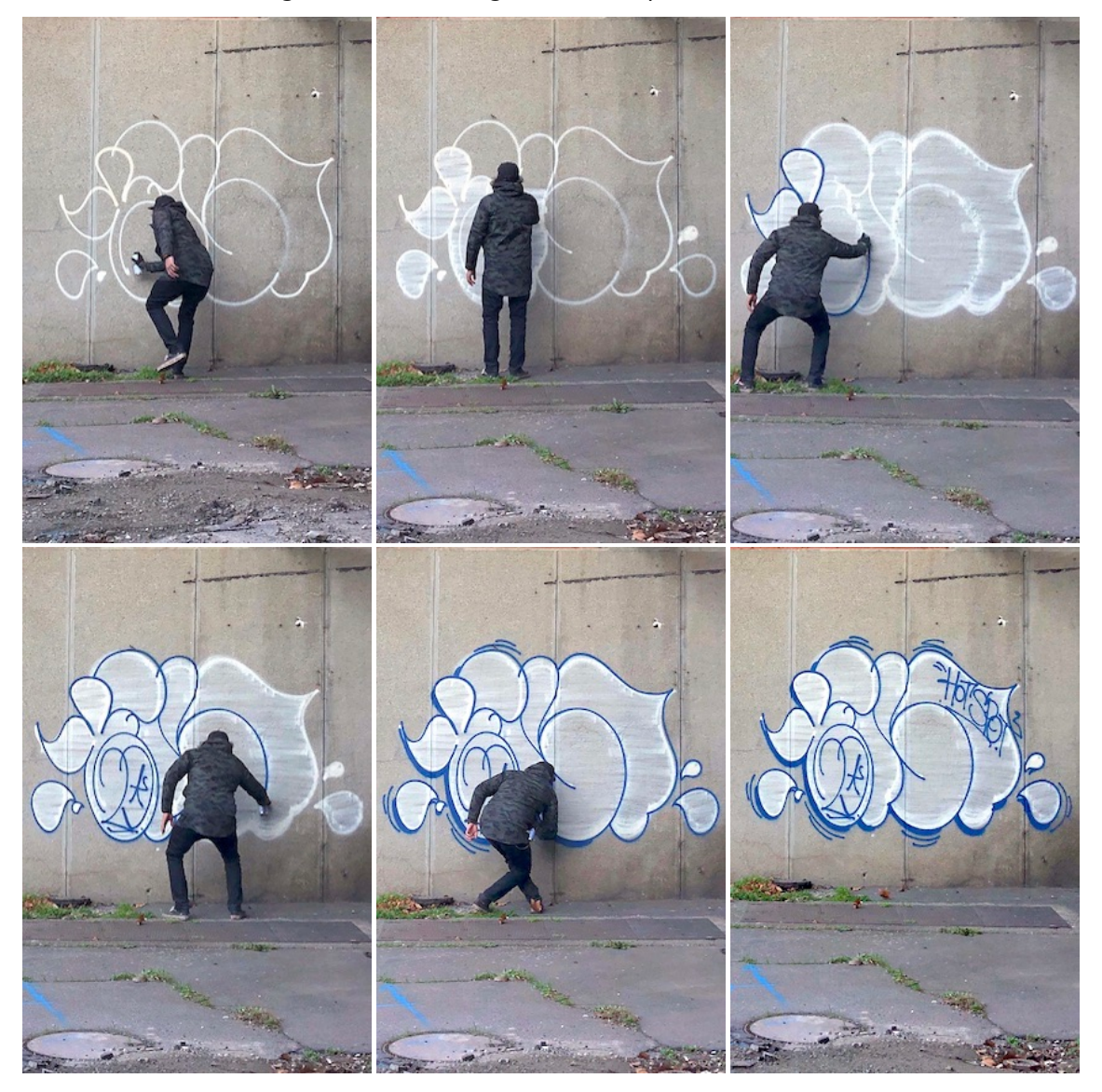
Figure 1. Tilt writing his throw-up

vibrating strokes, the initials of a crew, the current year, or a dedication. Without forgetting the photographic shooting, just after or the next day depending on the light, which completely concludes the intervention.