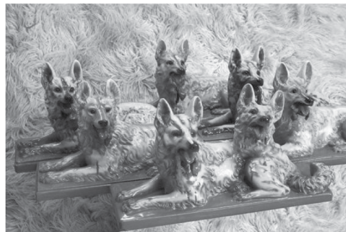
Figure 4: Dogs drooling green algae. Plastic figures by Xavier Théffo (2010) (© Xavier Théffo). Reprinted with permission.