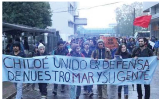
Figure 7: Protest following a massive red tide episode in Chiloé, Chile, in 2016 (© PienSaChile.com/T.Tricot). Reprinted with permission.

In a liberal and specialized economy, nonpoint-source pollution associated with global change is a factor of diffuse antagonisms and social tensions in coastal areas. The literature relates two main processes by which these stalemates may be overcome and by which people's experience regains visibility through grassroots movements. The first has been observed in industrial aquaculture areas such as the coast of Chile. Aldo Mascareño et al. (2018) show, for instance, how a red tide crisis serves as both an indicator of social-ecosystem vulnerability and as an ordeal, which can eventually give rise to organized social movements such as public protests by workers in fisheries and aquaculture (Figure 7). The second process is the development of popular epidemiology (Brown 1987), associated with health risks of micro- and macroalgal blooms, which eventually leads to recognition of human victims and to emergence of community science, like those for green tides in Brittany since 2009 (Levain 2014).