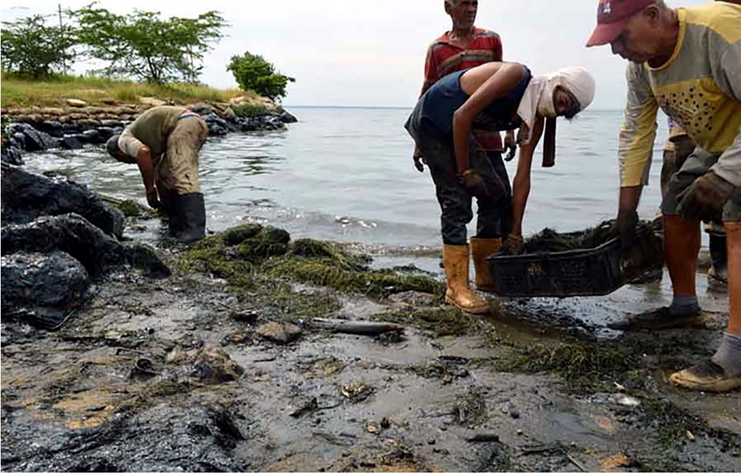
Figure 6: Fishermen landing fish on the shore of Lake Maracaibo (Venezuela) in 2015 (© Vitalis NPO). Reprinted with permission.

Consequently, water degradation reaches a point at which excessive organic inputs to the aquatic system, even when associated with noticeable and damaging changes, cannot be captured and are lost in global pollution. The coastal lake of Maracaibo, Venezuela, is an example of such a silent configuration (Conde and Rodriguez 1999). Overall, riverine communities that depend on fishing struggle with blue-green microalgal blooms, chronic proliferation of aquatic duckweed ( Lemna spp.), and massive oil spills from pipelines and an extractive industrial complex nearby. Fishermen, most from indigenous communities such as the Anu, are the first victims of green-black lake pollution (Figure 6). Despite desperate efforts of local NGOs and concerned scientists from diverse backgrounds, no organized research (whether in ecology or, even less probable, social sciences) or advocacy campaign can be performed in the current political context there, and the only academic sources available on the phenomenon adopt a biotechnical perspective.