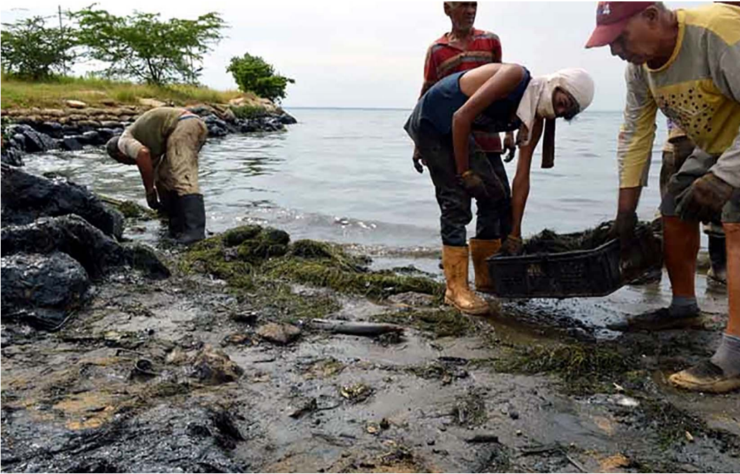
Figure 6: Fishermen landing fish on the shore of Lake Maracaibo (Venezuela) in 2015. Reprinted with permission.

Consequently, water degradation reaches a point at which excessive organic inputs to the aquatic system, even when associated with noticeable and damaging changes, cannot be captured and are lost in global pollution. The coastal lake of Maracaibo, Venezuela, is an example of such a silent configuration (Conde and Rodriguez 1999). Overall, riverine communities that depend on fishing struggle with blue-green microalgal blooms, chronic proliferation of aquatic duckweed ( Lemna spp.), and massive oil spills from pipelines and an extractive industrial complex nearby. Fishermen, most from indigenous communities such as the Anu, are the first victims of green-black lake pollution (Figure 6). Despite desperate efforts of local NGOs and concerned scientists from diverse backgrounds, no organized research (whether in ecology or, even less probable, social sciences) or advocacy campaign can be performed in the current political context there, and the only academic sources available on the phenomenon adopt a biotechnical perspective.