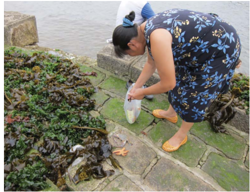
Figure 5: Women harvesting and selling algae on the urban shoreline of Qingdao (Shandong, China) in 2011.

Indeed, in most documented cases, management of nutrient pollution was first dominated by health concerns and focused on specific areas and sensitive points (e.g., water supply sources and watersheds) and only rarely on strategic relocation or extension of wastewater discharge to lakes or seashores. Management strategies were concerned mainly with protecting human health and fisheries (Laakkonen and Laurila 2007). In addition, since water pollution management was governed by social perception of the feasibility and practicability of solutions, abatement strategies focused on biotechnical control of the water cycle. This kind of socio-technical system leaves the ocean separate, as an unmanageable place, until more holistic conceptual-