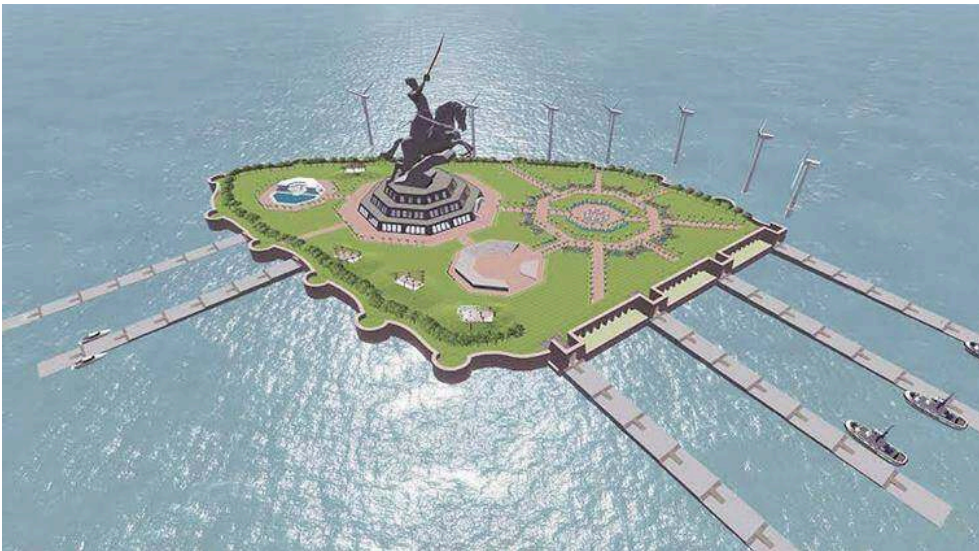
Figure 6: Model of Shivaji memorial in Mumbai