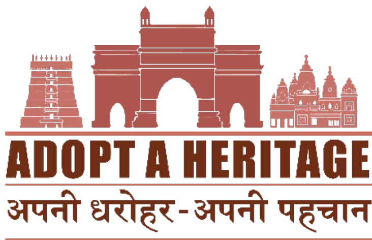
Figure 2: Official logo of the “Adopt a Heritage” scheme, © Ministry of Tourism, Government of India