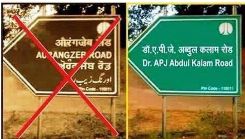
Figure 10: Renaming Aurangzeb Road, Delhi, 2015