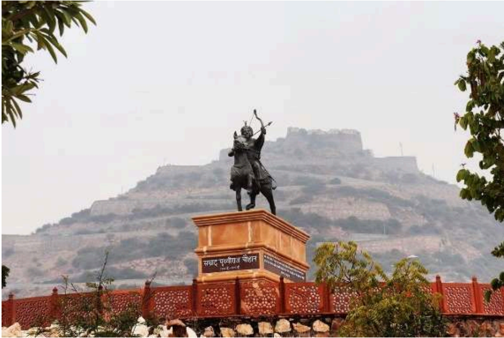
Figure 3: Prithviraj Chauhan memorial in Ajmer