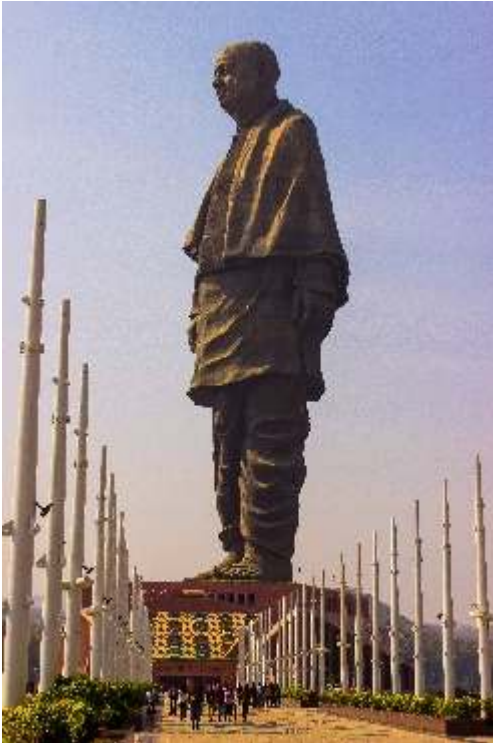
Figure 5: Sardar Patel statue in Gujarat, © Vijay B. Barot

Source: https://en.wikipedia.org/wiki/Statue_of_Unity#/media/File:Statue_of_Unity.jpg