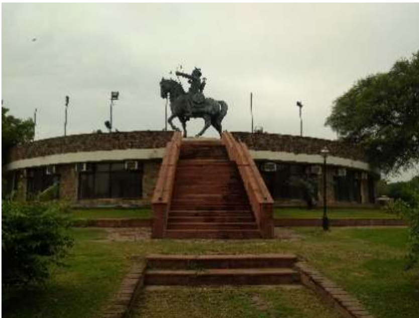
Figure 4: Prithviraj Chauhan memorial in Delhi, © आशीष भटनागर

Source: https://commons.wikimedia.org/wiki/File:Prithviraj_Chauhan_III_statue_at_a_distance_at_Qila_Rai_Pithora,_Delhi.jpg