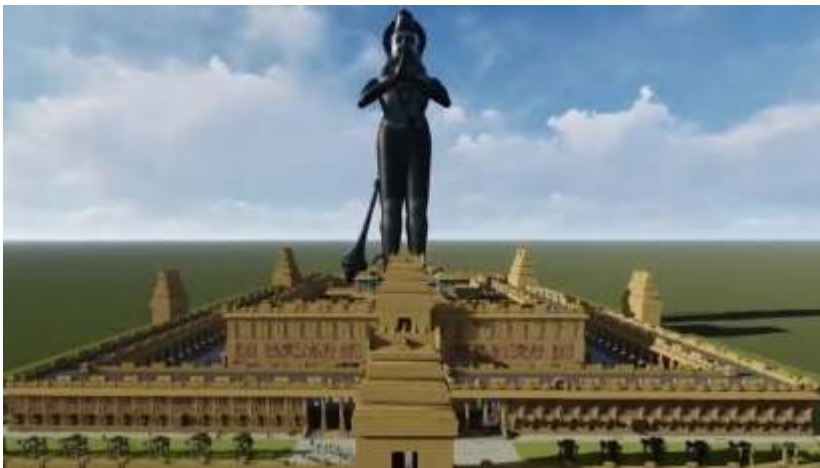
Figure 8: Model of Hanuman statue in Hampi