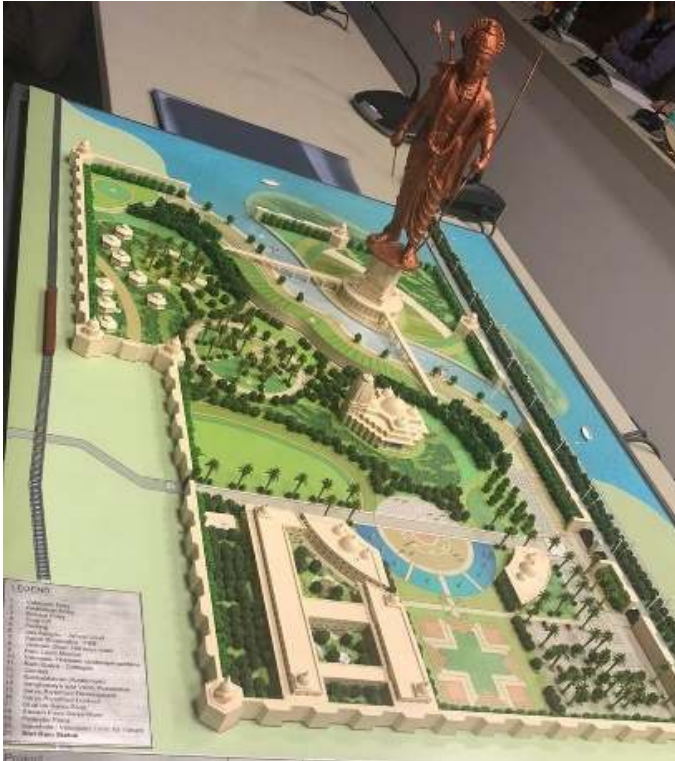
Figure 7: Model of Ram statue in Ayodhya