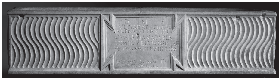
Fig. 1. Front of child's sarcophagus.

This sarcophagus is a single piece of marble that has remained intact: a single block of Italian marble from the quarries of Luni (Carrara, Italy). It measures 39.1 cm in height, 139 cm in length and has a thickness of 43.2 cm. It bears decoration on three of its four sides. The main side is composed of a tabula ansata in which the text has been inscribed, and a decoration with a spiralled fluting pattern ( strigila ) flanks the epigraphic area. Lateral sides are decorated with a military theme: a composition of shields and spears.