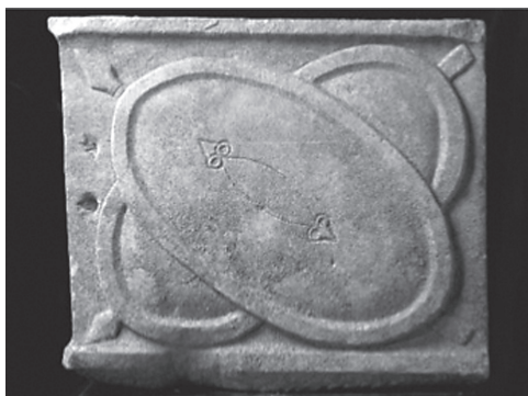
Fig. 2. Side of child's sarcophagus.

The conditions of this piece are good. There are only some erosions that have affected mainly the bottom corners. There are also four holes on the main side: three of them afflict the fluted decoration while another affects the tabula ansata (3), however this does not alter the interpretation of the text. This sarcophagus can be catalogued in the typology of strigilar sarcophagi.