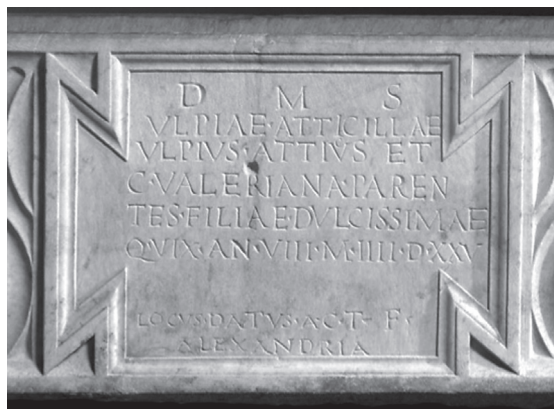
Fig. 3. Epigraphic area.

the definitive correct form Attius . The text in lines 4, 5 and 6 has been extended up to the right part of the framework (the extreme part of the right handle of the tabula ansata ). This is somewhat surprising because there is sufficient space directly after to avoid the need for the insertion of text in such a forced fashion.