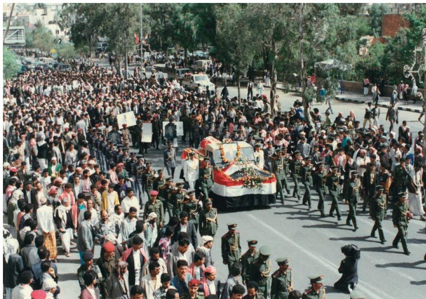
Figure 2. The funerals of Ahmad Nu'mân's in Sanaa, 1996.