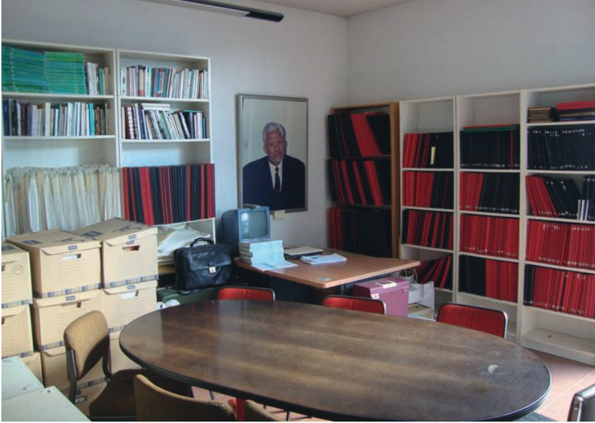
Figure 4. The Ahmad Muhammad Nu'mân archives in the IREMAM, Aix-en-Provence

classification of the papers was lost, a trace of its existence remains in the microfilms and, consequently, in the digital copy of them – a last resort to recover the loss, although the documents are not identified within the films, which makes it extremely difficult to locate them. In 2005, with no place to be stored, the whole collection was put into boxes, and kept in a furniture store in Geneva, from where it was extracted to the shelves of the IREMAM in Aix-en-Provence in 2009. The deposit of the Nu'mân Archives at the IREMAM was intended to guarantee better conservation conditions, to check their classification, to digitalize the papers in order to conserve a copy of them and allow their communication, with the authorization of the Nu'mân's representatives, and with respect for personal data.