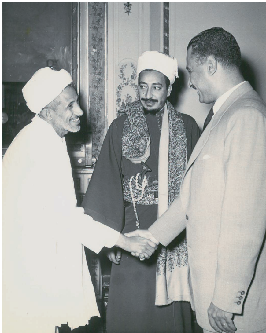
Figure 1. Ahmad Nu'mân, Imam al-Badr and Nasser in the middle of the 1960's