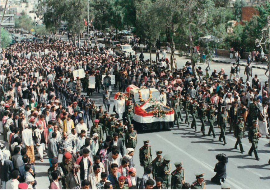
Figure 2. The funerals of Ahmad Nu'mân's in Sanaa, 1996.