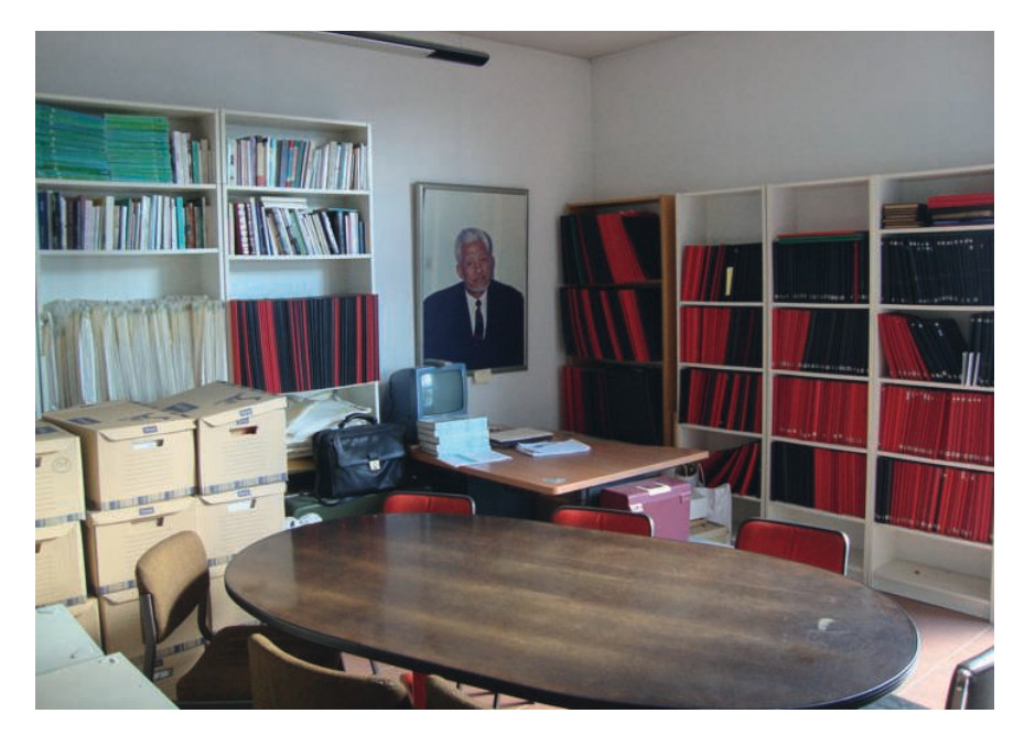
Figure 4. The Ahmad Muhammad Nu'mân archives in the IREMAM, Aix-en-Provence

classification of the papers was lost, a trace of its existence remains in the microfilms and, consequently, in the digital copy of them – a last resort to recover the loss, although the documents are not identified within the films, which makes it extremely difficult to locate them. In 2005, with no place to be stored, the whole collection was put into boxes, and kept in a furniture store in Geneva, from where it was extracted to the shelves of the IREMAM in Aix-en-Provence in 2009. The deposit of the Nu'mân Archives at the IREMAM was intended to guarantee better conservation conditions, to check their classification, to digitalize the papers in order to conserve a copy of them and allow their communication, with the authorization of the Nu'mân's representatives, and with respect for personal data.