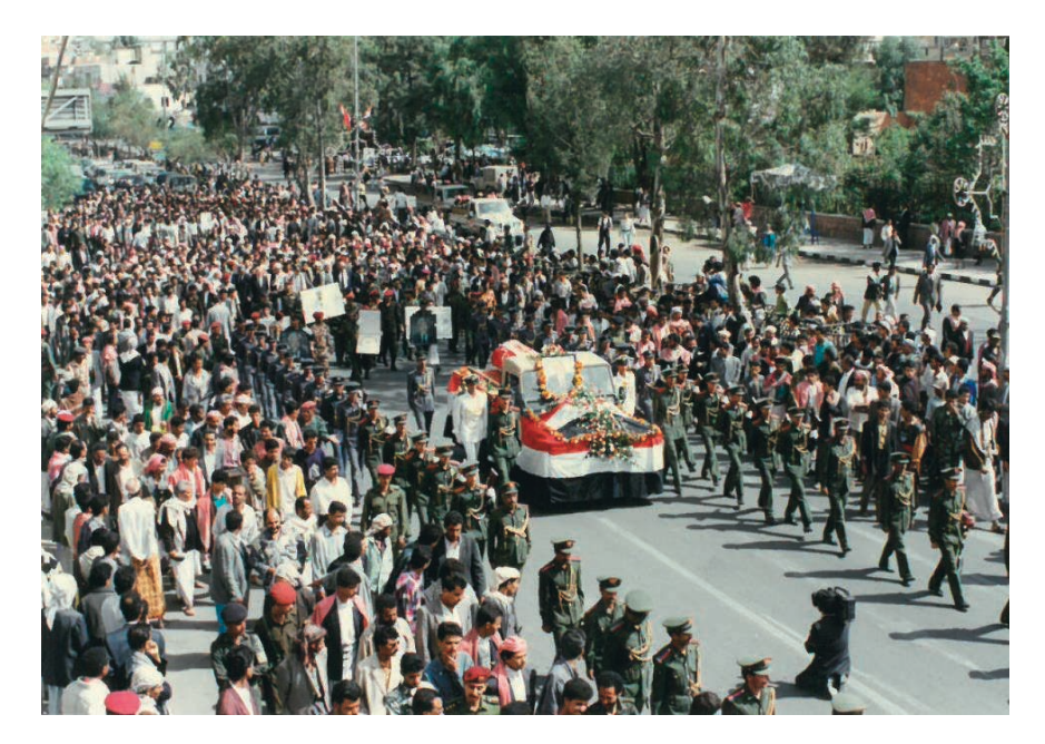
Figure 2. The funerals of Ahmad Nu'mân's in Sanaa, 1996.