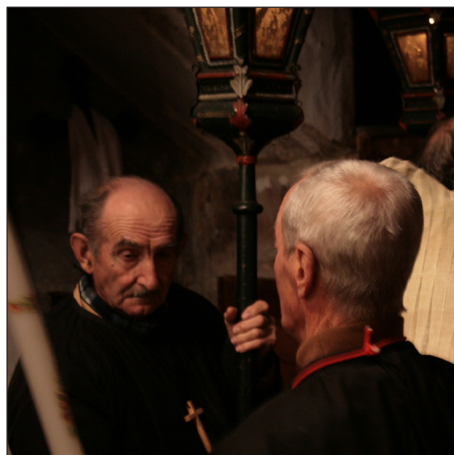
Figure 1: Two black penitents waiting for the departure of the Good Friday procession, Chapel of the Mercy, Tende.

To be part of the procession and of the brotherhood is a way to participate in the remembrance of the ancestors' past. The fact that the entire materiality of the devotional practices (ritual costumes, devotional objects, places of worship) still survives certainly helps to maintain past-presencing discourses. Nevertheless, material testimonies would not be enough without members' will to ensure the re-enactment of the past as a narrative and a ritual performance. A similar strategy is applied to safeguard another ritual of the village, a small-scale pilgrimage at the margins of the territory, though it is subject to a stronger enchantment process than the brotherhoods themselves.