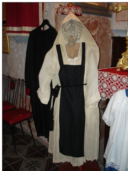
Figure 2: Display of black penitents female and male costumes, Chapel of the Mercy, Tende. (Photo: Cyril Isnart, 2007)