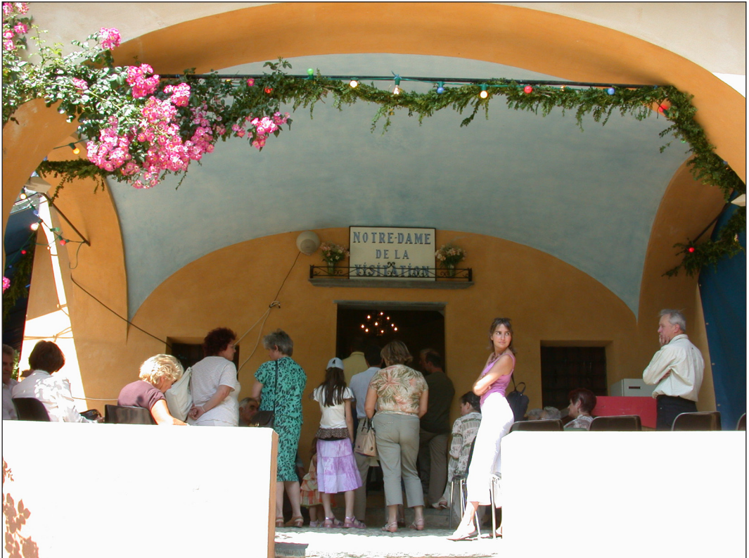
Figure 3: Main entrance of the Chapel of Vievola (Our Lady of the Visitation), during the religious service.

lation has to look. The families taking part in this local religious festival are all touched by the friendly ambiance, the easy transmission and performances of dances and songs. They all insist on the singularity of the Vievola feast, as the closest re-enactment of what their ancestors would have experienced in the past. In the same way that the brotherhoods mobilize narratives of the rural and Catholic past of the village, the mayor and the family who organizes the pilgrimage try to recall some elements of the history that transmit a holy and enchanted understanding of their festival. These are: the massive plague that took place in the seventeenth century, leading to the death of hundreds of inhabitants; the pious multitude of the congregations in the mid-twentieth century; and the spiritual importance of the fight for the survival of the festival. The performance of traditional danc-