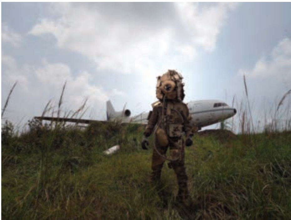
3 Kongo Astronauts Untitled; After Schengen series (2019) Digital print Photo: © Kongo Astronauts

motherboards, wires, and batteries that cover the astronaut's suit contain precious metals—copper and gold, zinc, tantalum, lithium—mined across the DRC amid abject violence by foreign conglomerates working hand in hand with a corrupt local elite.