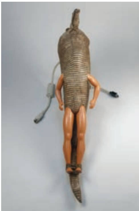
5 Lamyne M Collaboration with marabout Kunfayakun, Gabon Forlamy (for community protection against Trump, Orbán, and other extremist leaders worldwide) Gris-gris series (2018) Reptile skin (Nile monitor), plastic male figurine, data cable hardware, synthetic thread, cat claw, secret inter- ior; 47 cm x 11 cm x 13 cm