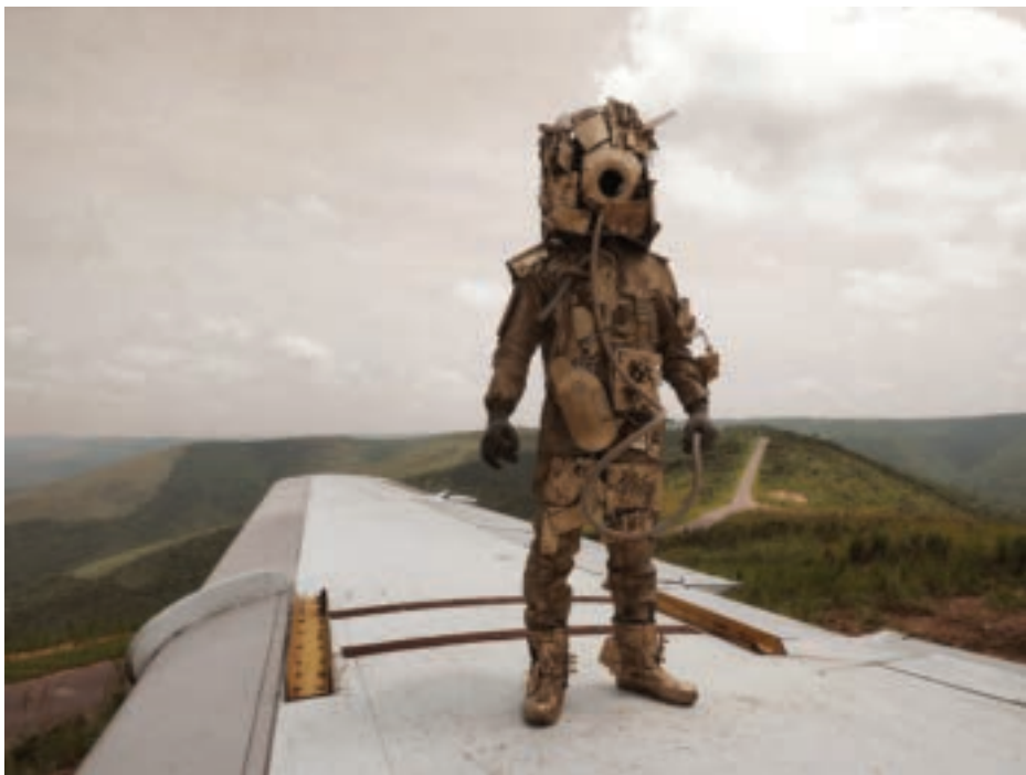
2 Kongo Astronauts Untitled; After Schengen series (2019) Digital print

A Parisian colleague of mine, presented with the photographs, saw in them an expression of desperate flight. From Congo, the series reads differently. For a year, from 2018 to 2019, following a diplomatic row between the DRC