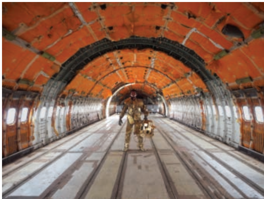
I Kongo Astronauts Untitled; After Schengen series (2019) Digital print