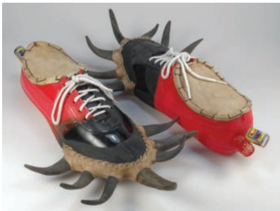
4 Lamyne M Collaboration with marabout Fékomanan, Liberia M’bappélépé (ensures football stardom and Ballon d’Or trophy) Gris-gris series (2018) Plastic soccer cleats, goat horns, cow leather, miniature perfume bottles, secret interior; 36 cm x 22.5 cm x 8 cm

Several of the charms are identified as “wifi sensitive”: updatable, or rechargeable, at a distance by their marabout cocreators in response to the changing needs of those who would deploy them in their quest for lives abroad.