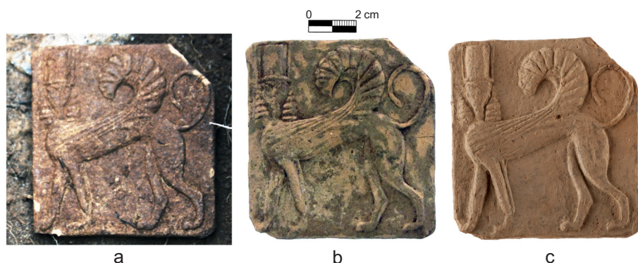
Figure 2. Sphinx plaque 17-03-3116-OB021 (Type 1): (a) in situ, (b) during conservation, (c) after conservation.

more broadly, it aims at reconstructing the role of women in ritual communal practices during a crucial and formative period of transition between the Late Bronze Age and the Early Iron Age.