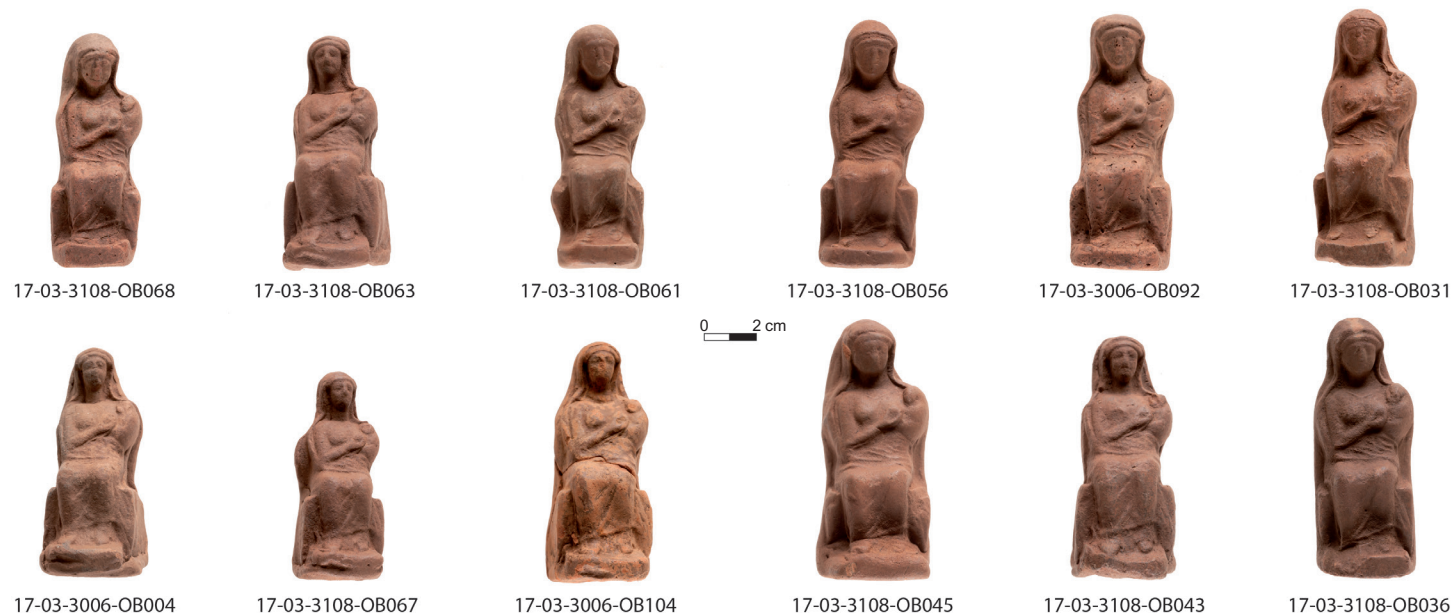
Figure 3. Seated kouroi figures (Type 17).

Fig. 2), and small Daedalic figurines representing a naked woman (Type 3: 26 examples; Fig. 4:b). Most of the terracottas from Deposit 1 find exact or close parallels in the votive deposit from Kako Plaï on Anavlochos itself (Fig. 1), but also at the neighboring sites of Papoura, Smari, Milatos, Dreros, Olous, and Lato, and farther to the east at Praisos and Vamies (Xanthoudides 1918; Demargne 1929, 1930, 1931; Demargne and van Effenterre 1937; van Effenterre 1938; Ducrey and Picard 1969; Chatzi-Vallianou 2000; Zographaki and Farnoux 2010; Pilz 2011; Brun and Duploux 2014). This find therefore includes Anavlochos in a regional network of cultic practices and of coroplastic production and circulation. The quantity and type of material recovered, as well as the topography of the place and the identification of sections of an ancient path near the deposit during the survey seem to indicate that Deposit 1 may have been the final destination of a sacred road that passed the old bench sanctuary at Kako Plaï (Fig. 1). This sanctuary was brought to light in 2017 and 2018, and it remained in use long after the settlement was abandoned in the beginning of the seventh century B.C.