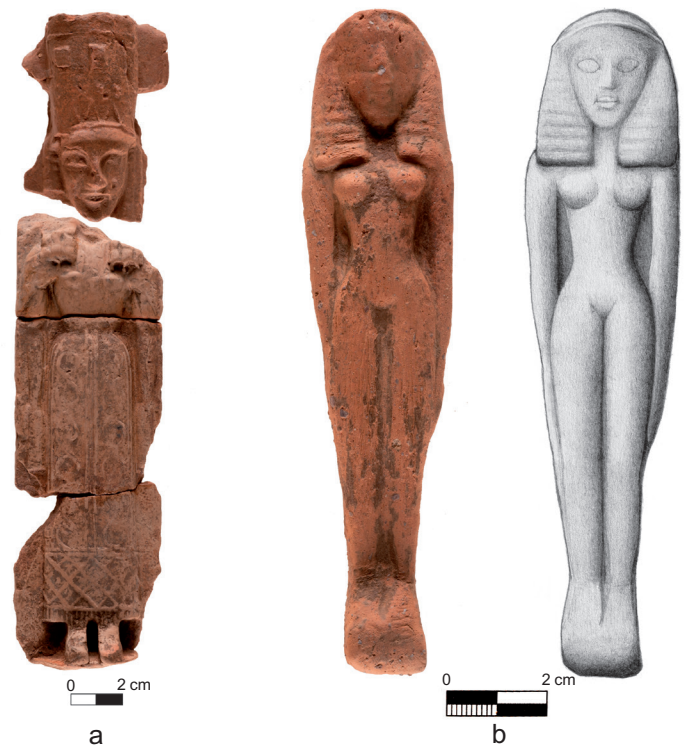
Figure 4. Plaque and figurine: (a) fragments 17-03-3108-OB038, -OB127, and -OB134 of a Daedalic plaque (Type 2); (b) figurine 17-03-3108-OB096 (Type 3).

Erminia Capocelli Library, Sister Orsola Benincasa University of Naples.