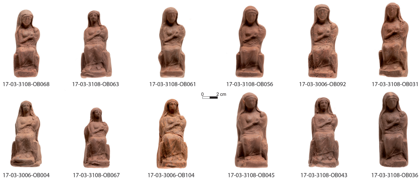
Figure 3. Seated kourotrophi figures (Type 17).

Fig. 2), and small Daedalic figurines representing a naked woman (Type 3: 26 examples; Fig. 4:b). Most of the terracottas from Deposit 1 find exact or close parallels in the votive deposit from Kako Plaï on Anavlochos itself (Fig. 1), but also at the neighboring sites of Papoura, Smari, Milatos, Dreros, Olous, and Lato, and farther to the east at Praisos and Vamies (Xanthoudides 1918; Demargne 1929, 1930, 1931; Demargne and van Effenterre 1937; van Effenterre 1938; Ducrey and Picard 1969; Chatzi-Vallianou 2000; Zographaki and Farnoux 2010; Pilz 2011; Brun and Duploux 2014). This find therefore includes Anavlochos in a regional network of cultic practices and of coroplastic production and circulation. The quantity and type of material recovered, as well as the topography of the place and the identification of sections of an ancient path near the deposit during the survey seem to indicate that Deposit 1 may have been the final destination of a sacred road that passed the old bench sanctuary at Kako Plaï (Fig. 1). This sanctuary was brought to light in 2017 and 2018, and it remained in use long after the settlement was abandoned in the beginning of the seventh century B.C.