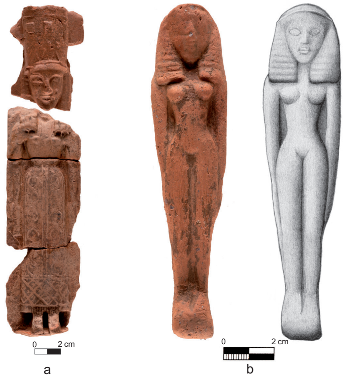
Figure 4. Plaque and figurine: (a) fragments 17-03-3108-OB038, -OB127, and -OB134 of a Daedalic plaque (Type 2); (b) figurine 17-03-3108-OB096 (Type 3).