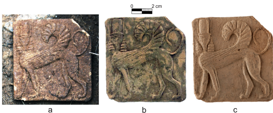
Figure 2. Sphinx plaque 17-03-3116-OB021 (Type 1): (a) in situ, (b) during conservation, (c) after conservation.

more broadly, it aims at reconstructing the role of women in ritual communal practices during a crucial and formative period of transition between the Late Bronze Age and the Early Iron Age.