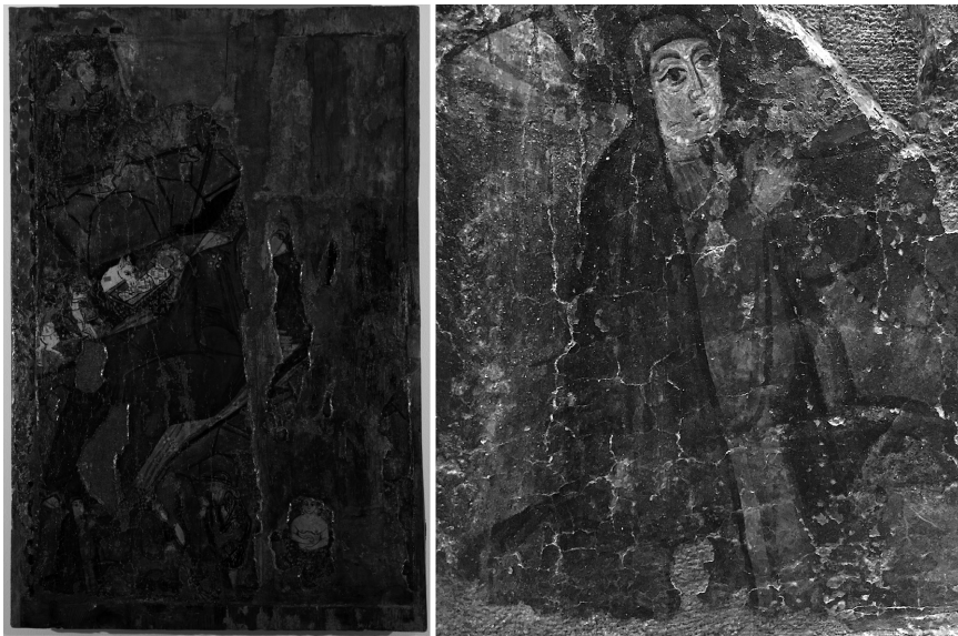
Figure 11.3 Nicosia, Byzantine Museum of the Archbishop Makarios III Foundation, icon of the Nativity of Christ with a female supplicant, end of the thirteenth century