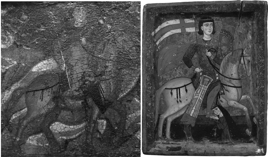
Figure 11.2 Kyperounta, museum of the Holy Cross, detail of the icon of Saint Marina with scenes of her life, second half of the thirteenth century/Sinai, monastery of Saint Catherine, icon of Saint Sergius with a female supplicant, 1260s

The Syrians from the crusader states of the Holy Land once established in Cyprus, maintained a favoured status and close ties with the Franks. 27 Regarding the artistic production, Annemarie Weyl Carr has shown that the "Frankish patrons [of the island] had adopted eastern Christian forms." 28 A recently referenced icon 29 nicely demonstrates this promotion of the " maniera syriaca " by the insular Latin community (Figure 11.3). Currently housed at the Museum of the Foundation of