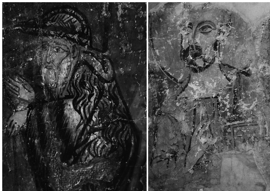
Figure 11.4 Nicosia, Byzantine Museum of the Archbishop Makarios III Foundation, detail of the icon of the Nativity of Christ with a female suppliant, end of the thirteenth century/Qara, monastery of Mar Yakub , detail of the apostle Mark, before 1266