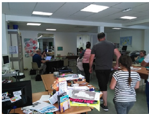
Figure 4. Scene of coworkers' life in Coworkingtoday

In the genesis of collaborative spaces, the bistro is widely recognized as an important gathering place, as one of the first spaces when it comes to sharing and conviviality. In the immediate vicinity of CwT, The Coffee is one such bistro that would sometimes welcome coworkers who wanted to exchange ideas about a project in a space noisier and less constraining than that of CwT. This was a complementary and, in many different ways, necessary moment for the activity that they exercised.