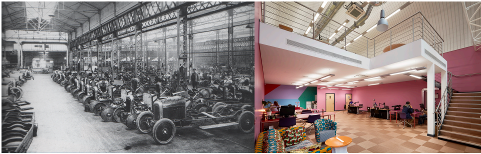
Figure 2. Assembly line of a Citroën 10hp ; Interior Photography of The Hub