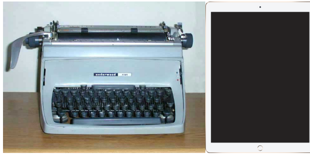
Figure 3. Typewriter Under Underwood Touch-Master 5, early 1960s (public domain); iPad (license: CC BY-SA 4.0)

The semitone silence that prevails in CwT was well perceived and widely accepted by coworkers and other users. It is even helpful when it comes to focus on a particular project, as can be noisy café where the subtle interfering noises are no longer heard and disturbing. This ‘white noise’ seemed to be produced by the many computers in the space. Absolute and prolonged silence does not exist. The form of silence encountered at CwT was simply a silence not disturbed by sonorous, meaningful words or speech. Interestingly, this form of silence was not always appreciated; for instance, in another coworking space in the center of France, the community manager told us that most coworkers cannot stand silence and continuously ask for some musical background in order to create a comfortable and soothing work environment. More precisely, the community manager argued that it thwarts the ‘false silence’, namely that of murmurs, the sound of chairs being moved, or the noise caused by the keystrokes of the keyboard of a computer. Concerned about the wellbeing of the users of the space, he decided to broadcast some carefully-chosen background music so that it would not become an inhospitable element for coworkers. This musical background had become an asset of the place, a distinctive element that was sought after by workers.