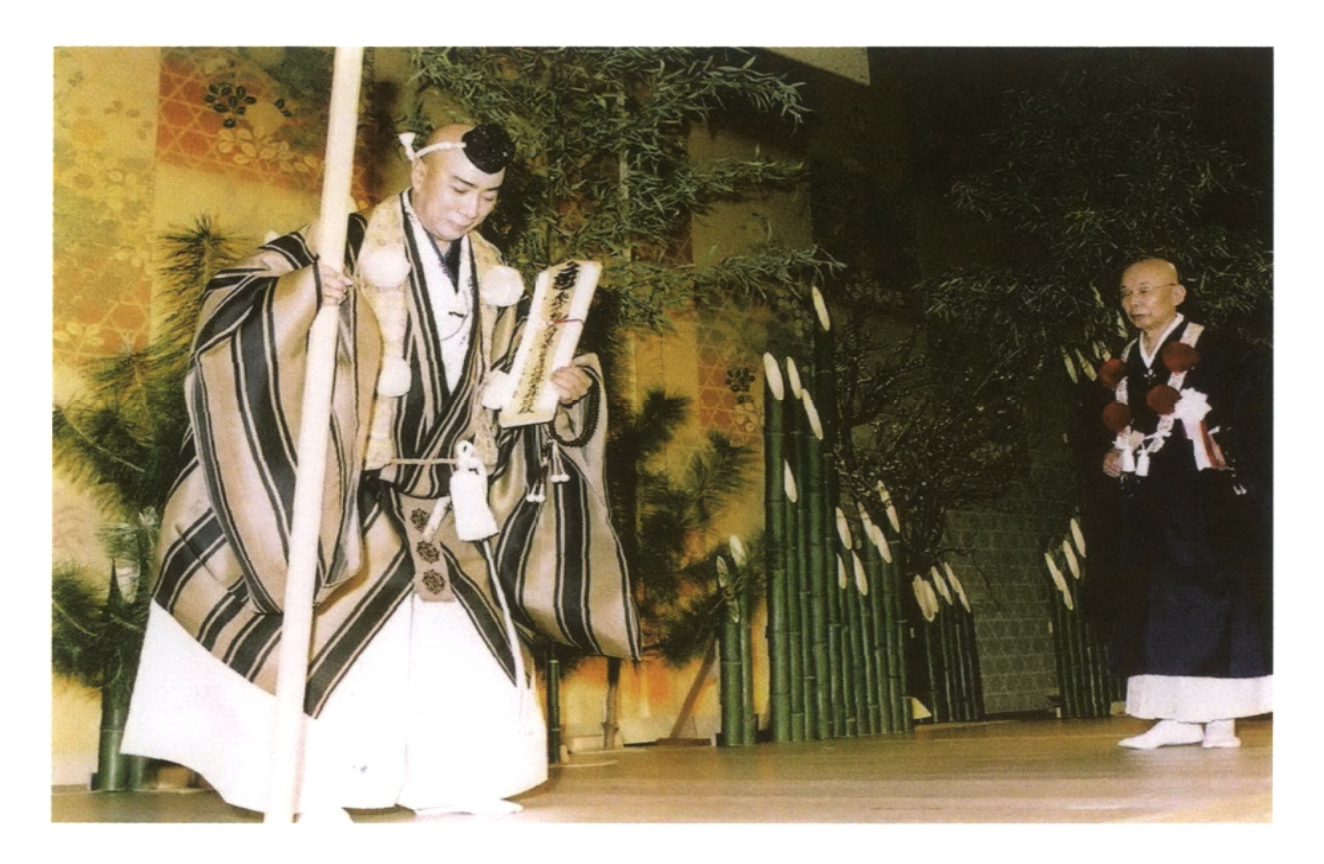
Photo 3: "Impromptu Dialogue under the fall of Cherry Blossom petals at Shōgoin" Shōgōin sakura fubuki tamasaka no mondō 聖護院櫻吹雪偶然之問答

to be creative in this domain, by maintaining or recomposing such ancient rituals. Particularly noteworthy are the recent festivities of April 3, 2008, marking the accession to office (shinzan shiki 晉山式) of the 52<sup>nd</sup> highest dignitary (monshu 門主) of Shōgoin and the Honzan branch of Shugendō. This event confirms doubly, by the accompanying ceremony and entertainments, the consistency of such a tendency. Announced by the press and personal invitation, the ritual was attended by eight hundred people and broadcast by the media.