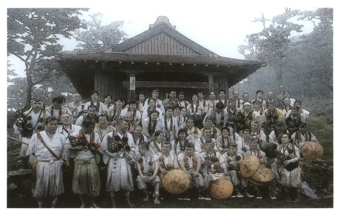
Photo 5: Shōgoin okugake, the mountain-entry in Ōmine, Jinzen. September 2005 (82 participants, 59 men, 23 women). (photograph: P. Simon)

with the exception of the practices at Sanjōgadake. Since this date, thanks to the opening of a forest road from Dorogawa 洞川, women can join the group of men coming from Sanjōgadake at the 58th stage, Gyōja-gaeri 行者還り, and continue on with them southward. In 1981, women finally gained access for the first time to the Jinzen water-pouring rite at the end of the okugake .