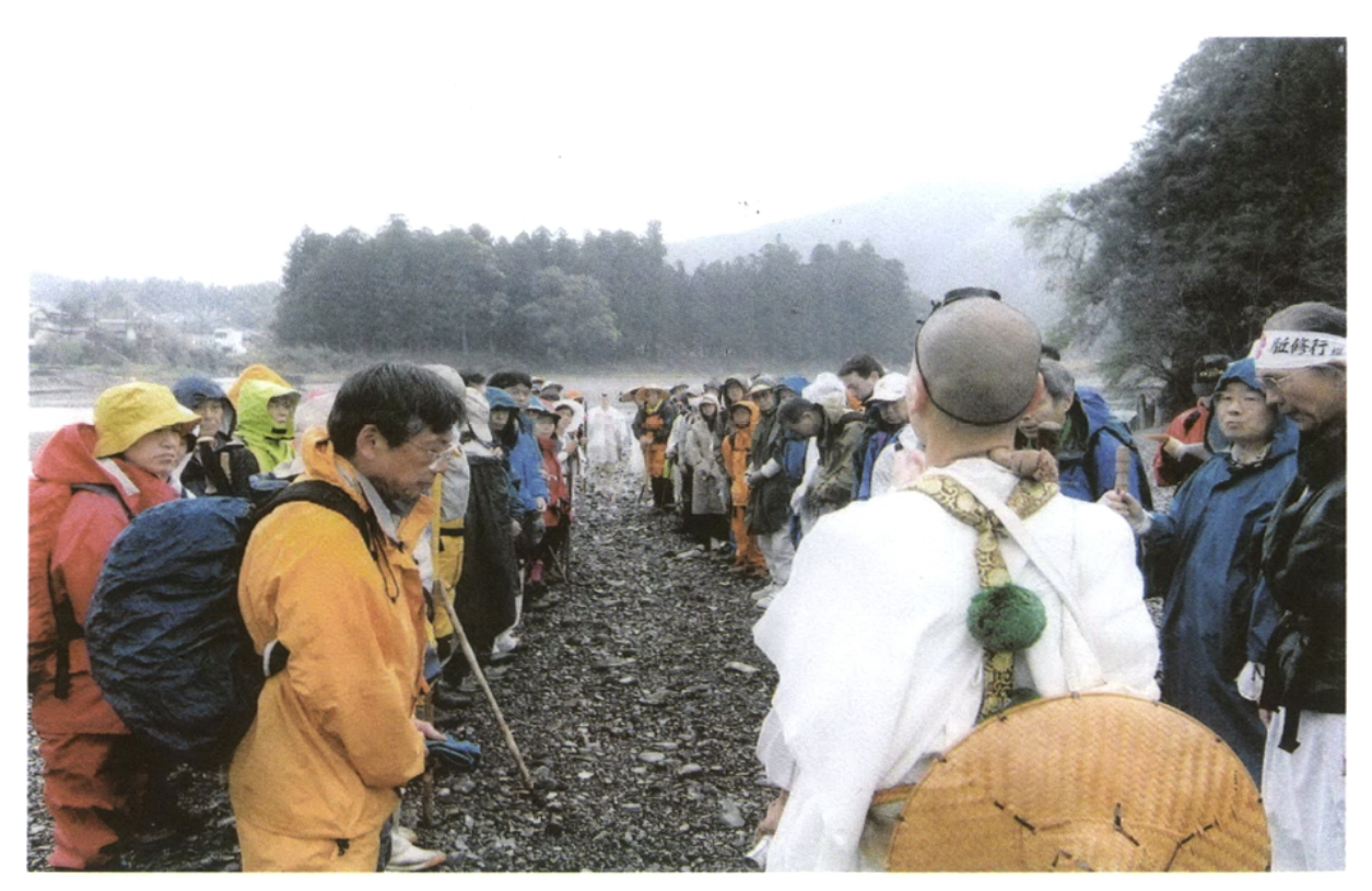
Photo 2: Haru no mine-iri of Kumano Shugen: departure from Sonaezaki 備崎 (Hongū), April 15<sup>th</sup>, 2006.