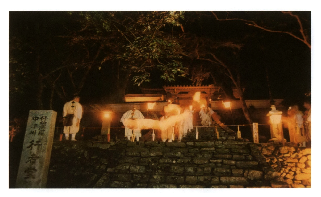
Photo 4: Ascent towards the Gyōjadō at Nakatsugawa for the Katsuragi kanjō , (waterpouring rite), 3 am, September 9, 2002.

Cost per individual to participate: ¥100,000 (1981 value);