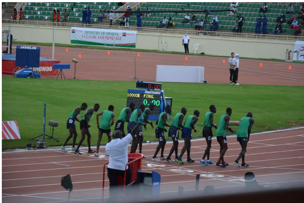
Kenyan runners getting ready for a national competition in Nyayo Stadium, Nairobi, on October 3, 2020.

In sum, the resilience narrative was not only well-planned through a carefully thought-out media strategy, but it also relied on identifiable heroes and heroines who could embody endurance and creativity.