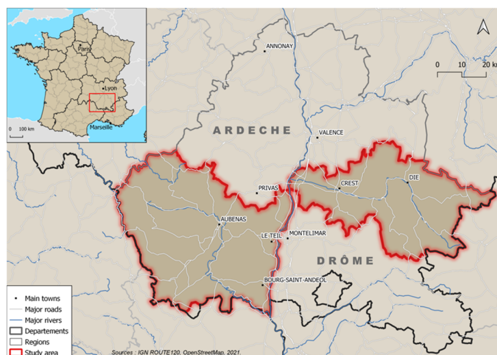
Figure 1. Study areas.