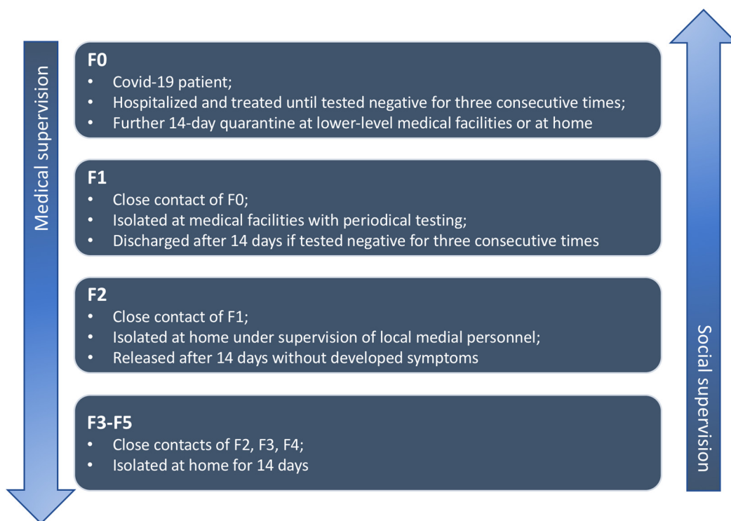
Figure 2. Vietnam's multi-tier 'F-system' for contact-tracing and isolation

Establishing degrees of distance from an infected person enables officials to apply quarantine and testing regimes that correspond to individuals' level of exposure. Tracing, isolating and monitoring can start immediately, even for people at low risk (up to five degrees of distance from a confirmed case).