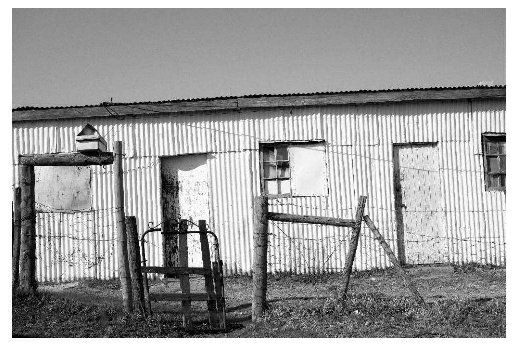
Fig. 6. Shack in which Ayanda rents a room, Fingo Village, Grahamstown, 19 July 2018.

his nephews and nieces. A few months later, Ayanda decided to rent another shack not far away. This is a sheet metal construction of approximately 70 square meters and divided into three dwellings. It is built on a plot vaguely surrounded by a rickety fence at the foot of which lies a pile of torn plastic bags, waste paper and fizzy drink bottles. The landlord is a kind of rentier in the informal economy; he collects rents from the five shacks that his mother built in the neighborhood several years ago. The part occupied by Ayanda consists of a room whose only window is obstructed by pieces of cardboard meant to replace the missing glass tiles. There is not enough space to accommodate much more than a bed and a chair. In the evening, Ayanda goes to eat at his sister's house. More often, he joins his girlfriend who lives in her brother's house, a block away. For lack of 'means,' Ayanda cannot live with her and their young child. His two older sons, whom he had with another wife, live at their aunt's house, with their cousins.