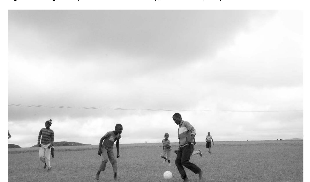
Fig. 10. Training on the plains around the township, Grahamstown, 21 April 2014