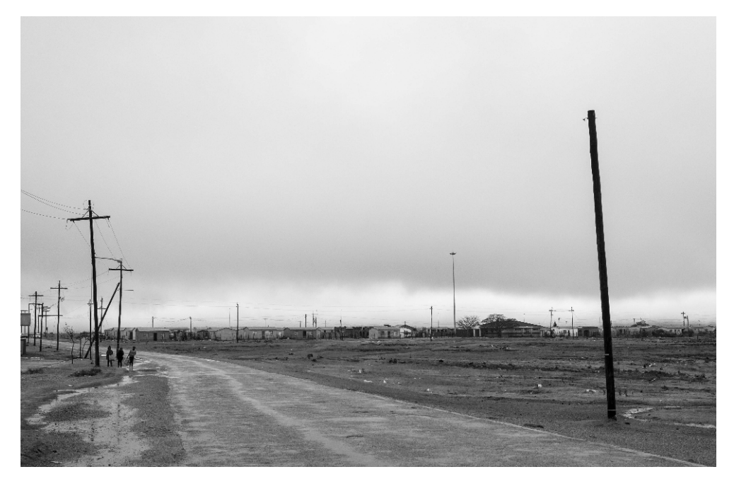
Fig. 2. On the outskirts of the township, Rhini, Grahamstown, 13 July 2018