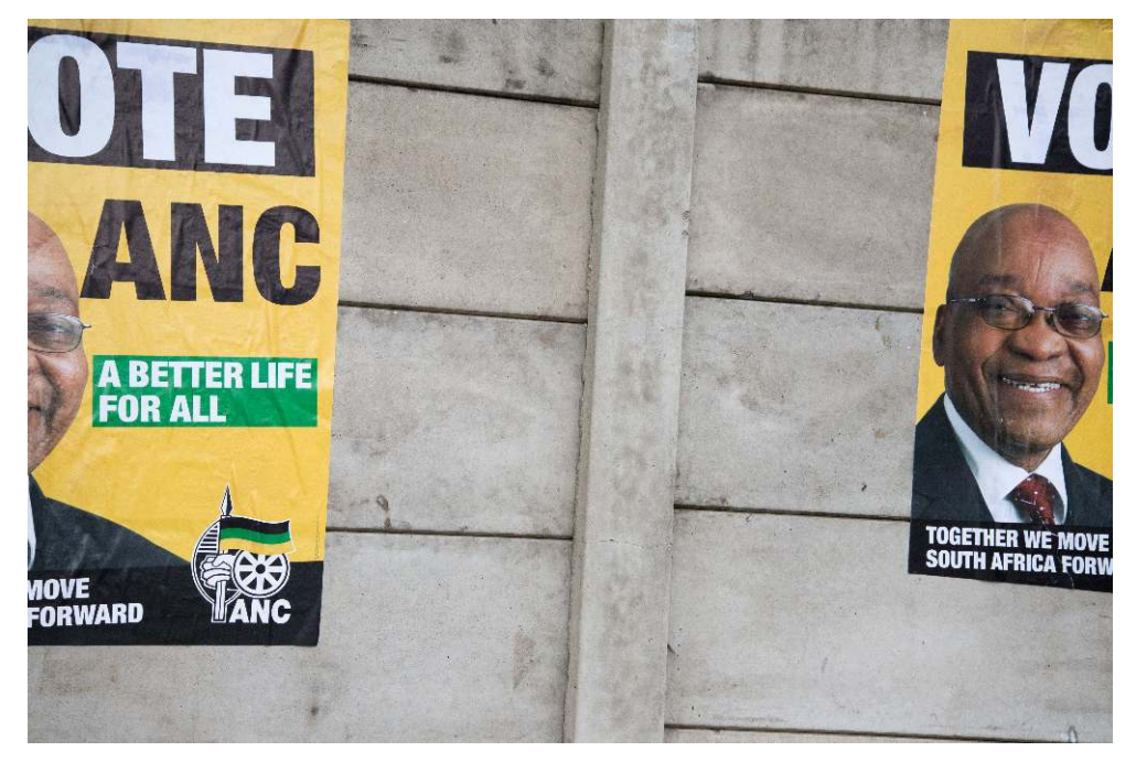
Fig. 7. 'A better life for all', McDonald Street, Grahamstown, 21 april 2014