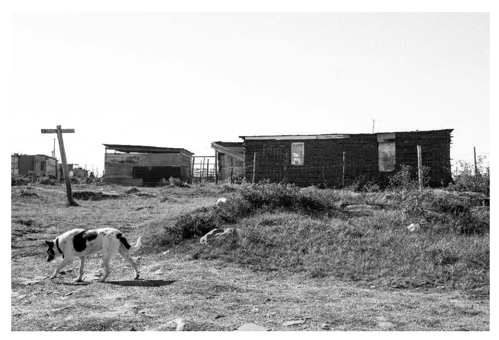
Fig. 5. Informal settlement, Papamani, Grahamstown, 27 avril 2016