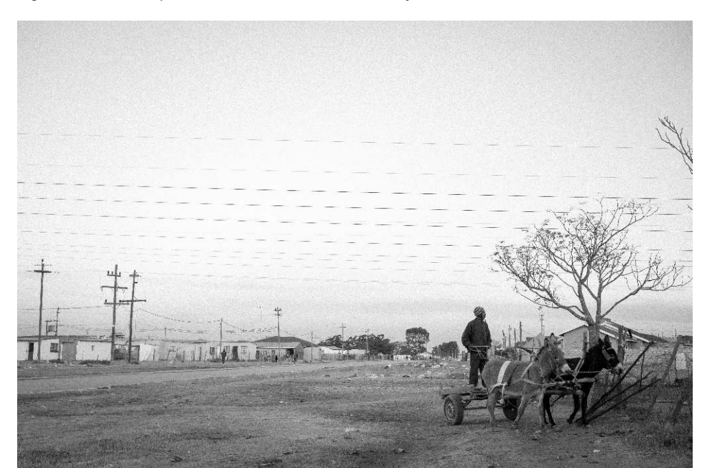
Fig. 4. In the township, Extension 7, Grahamstown, 16 July 2018